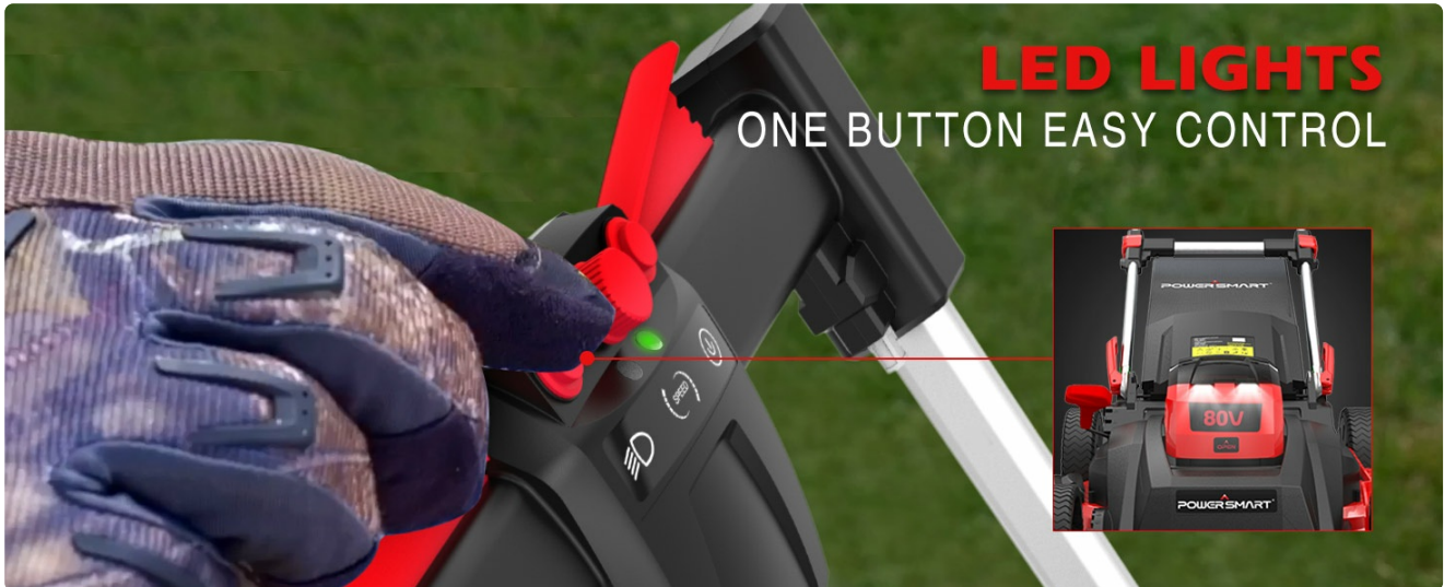
Figure 5.1: LED Lights and One-Button Easy Control. This image shows the control panel on the mower's handle, featuring LED indicators and simple buttons for operation.