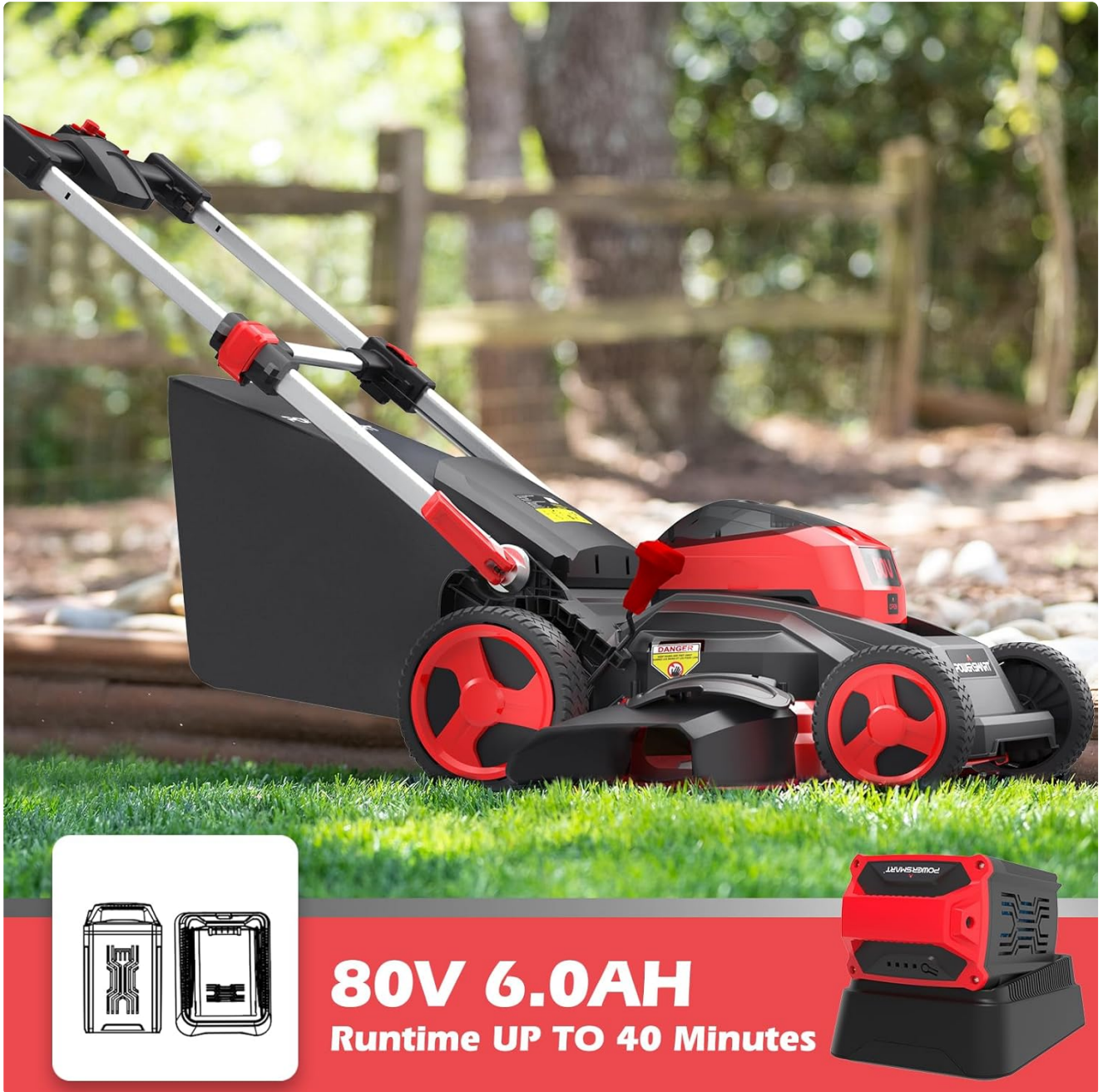
Figure 3.1: 80V 6.0Ah Lithium-Ion Battery System. This image illustrates the powerful 80V 6.0Ah battery and its charger, indicating a runtime of up to 40 minutes.