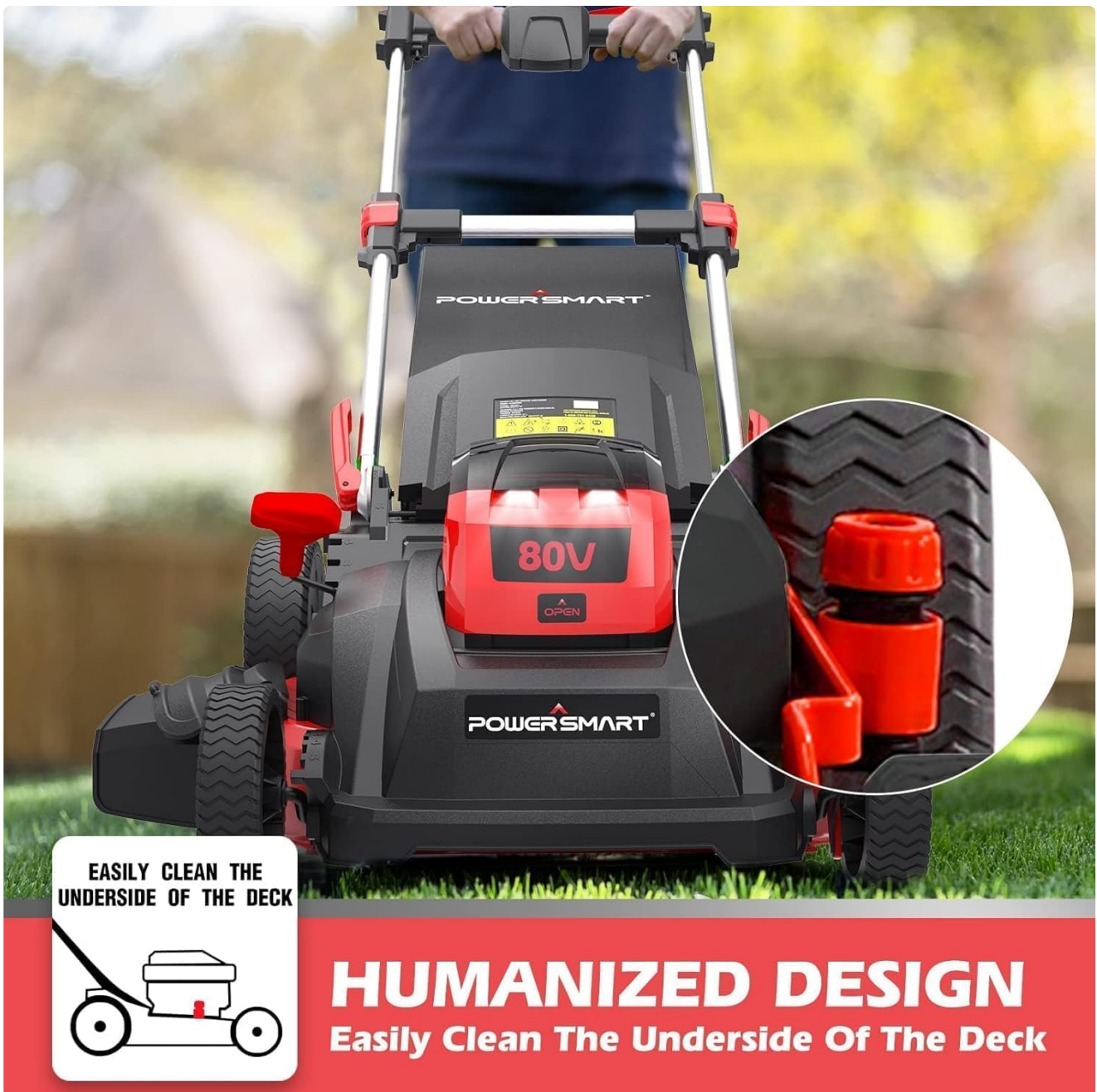
Figure 6.1: Water Pipe Joint for Easy Cleaning. This image highlights the water pipe joint located on the mower deck, designed for convenient hose attachment to clean the underside.