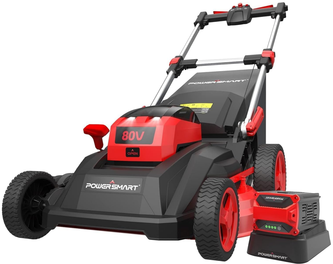
Figure 1.1: PowerSmart 80V MAX 26-Inch Self-Propelled Lawn Mower. This image shows the complete lawn mower unit, including the battery and charger, highlighting its compact design.