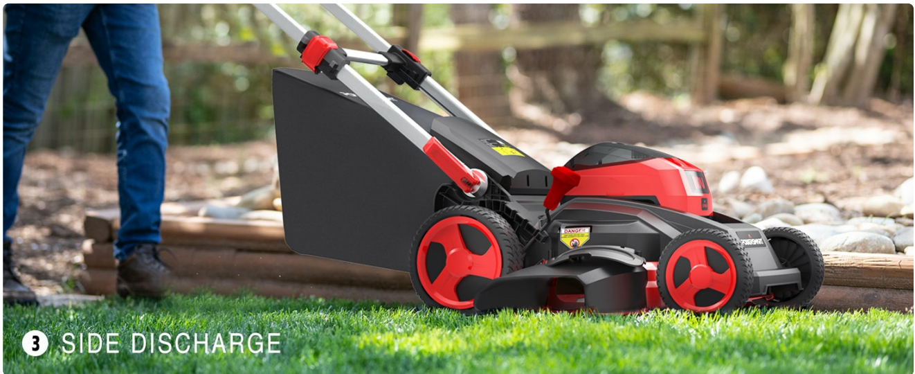
Figure 5.6: Side Discharge Mode. This image shows the mower with the side discharge chute in place, allowing clippings to be expelled from the side.