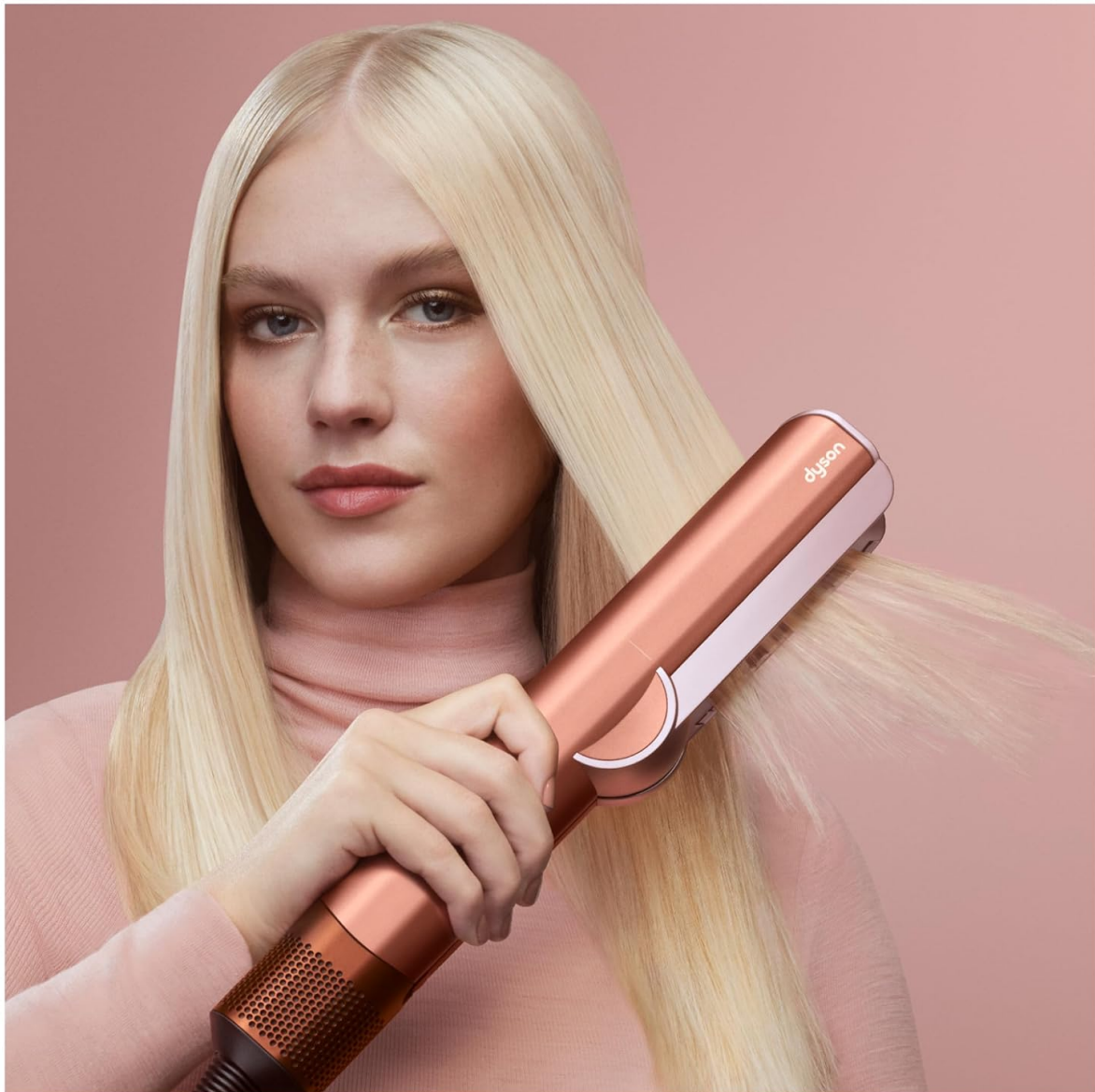
Image: A user styling dry hair with the Dyson Airstrait™ Straightener.