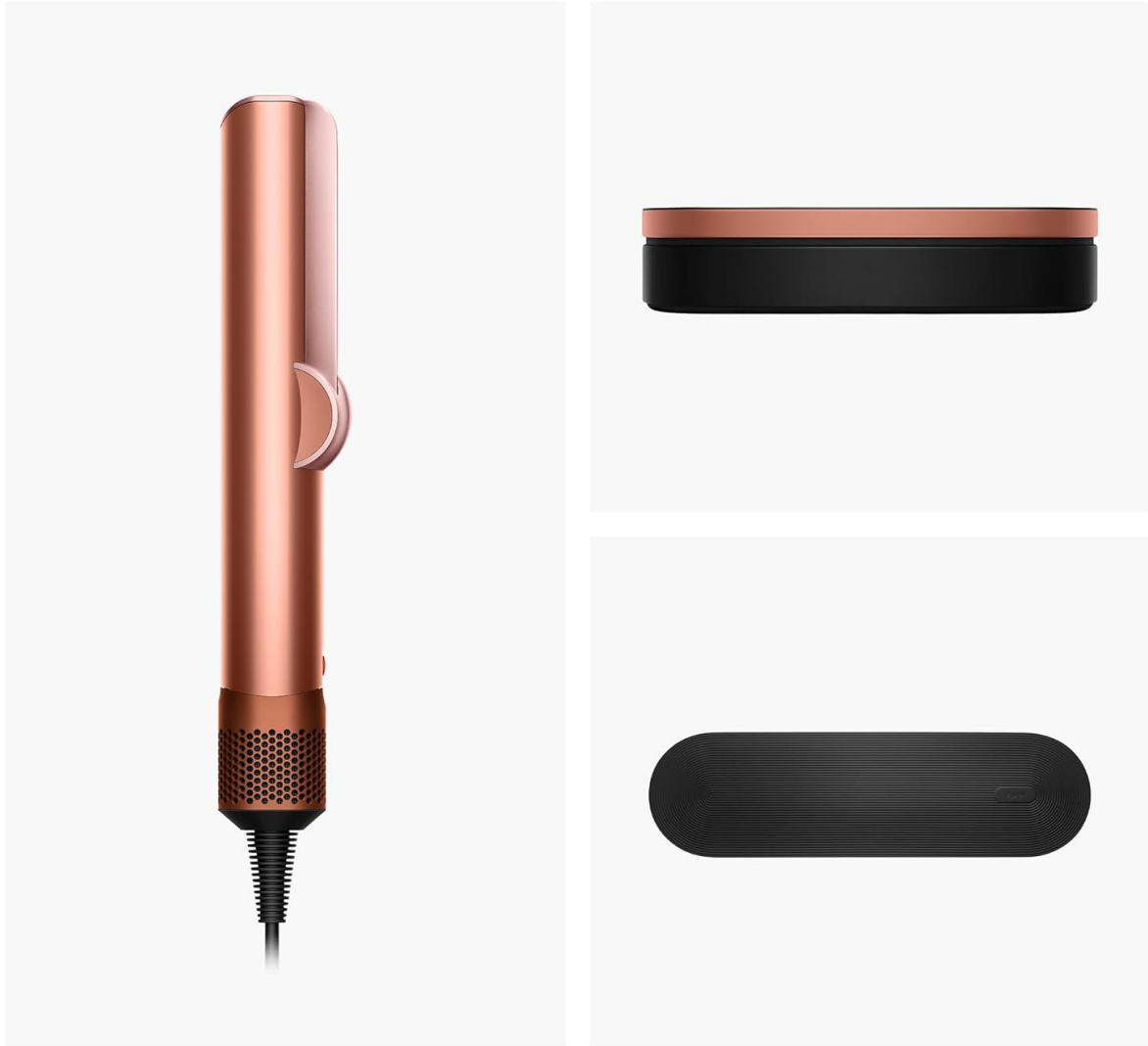
Image: The filter area of the Dyson Airstrait™ Straightener, important for maintenance.