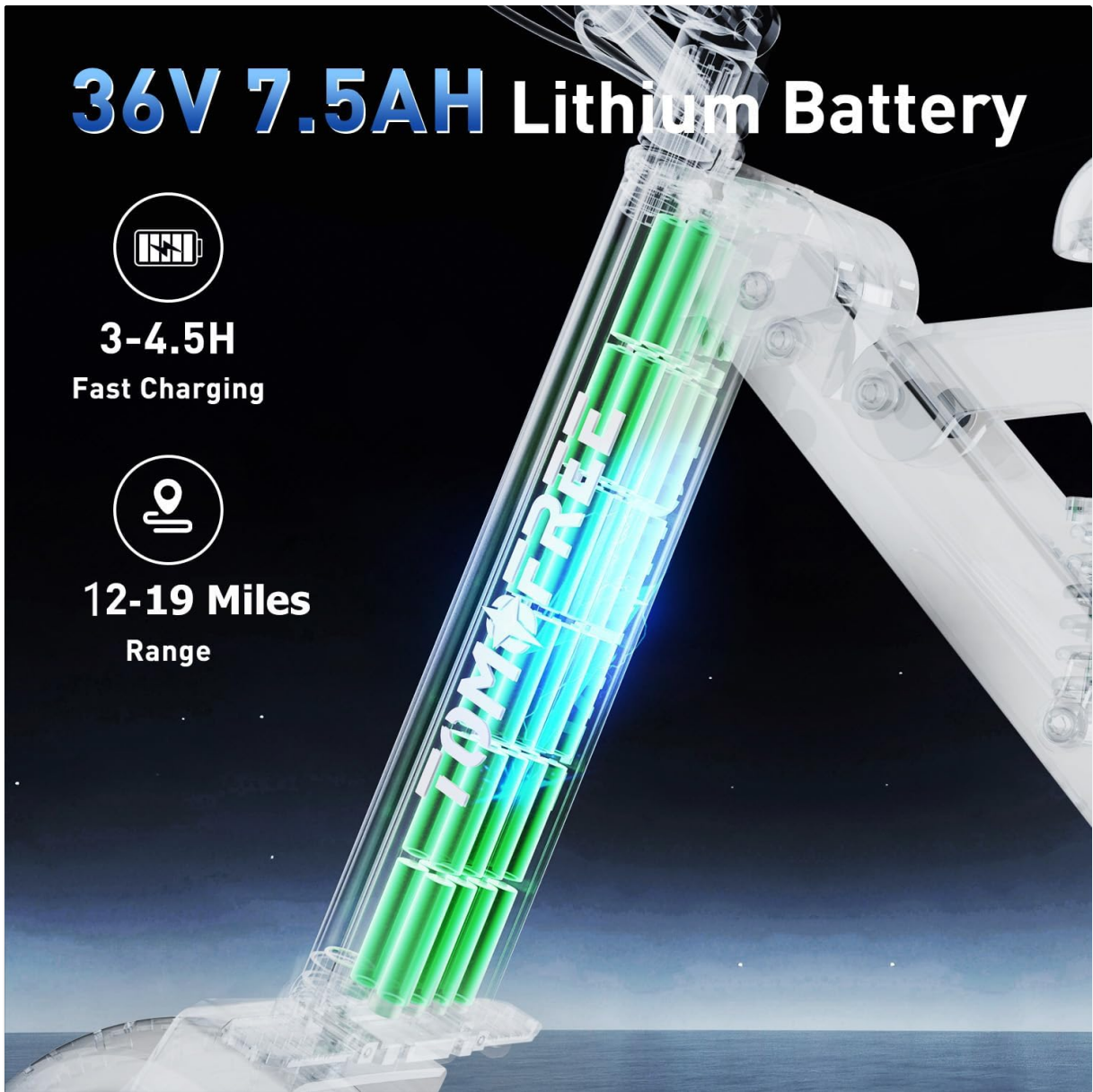
Figure 2.3: Transparent view of the scooter frame highlighting the integrated 36V 7.5Ah Lithium Battery, offering 3-4.5 hours fast charging and 12-19 miles range.