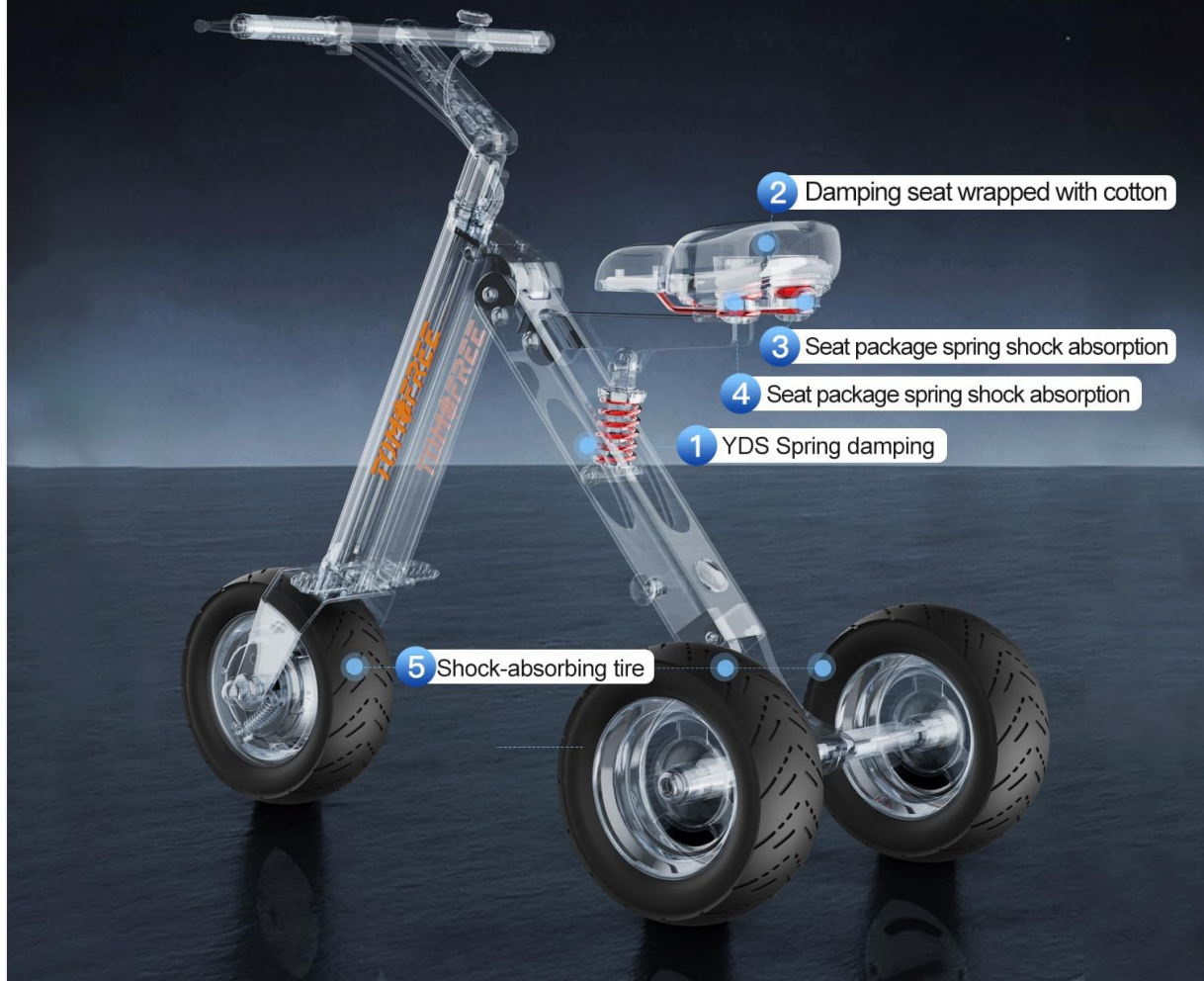
Figure 2.4: Transparent view detailing the 5-fold shock absorption system, including damping seat, seat package spring, YDS spring damping, and shock-absorbing tires.