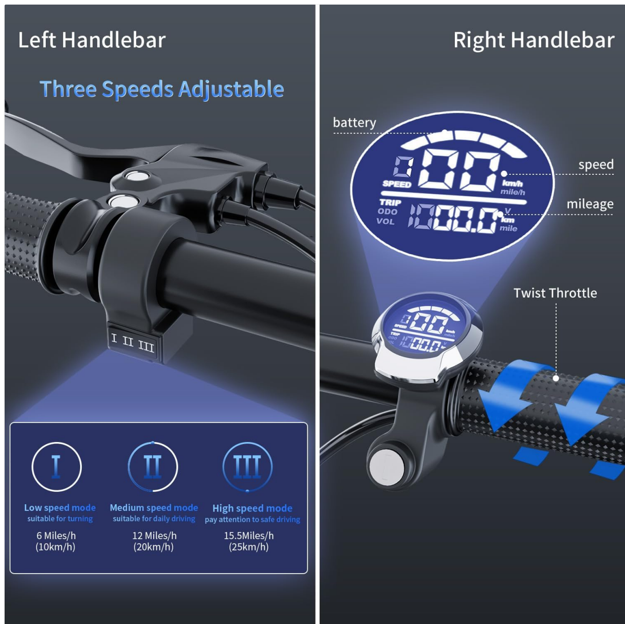
Figure 4.1: Left Handlebar controls, showing the three-speed adjustment buttons (I, II, III).