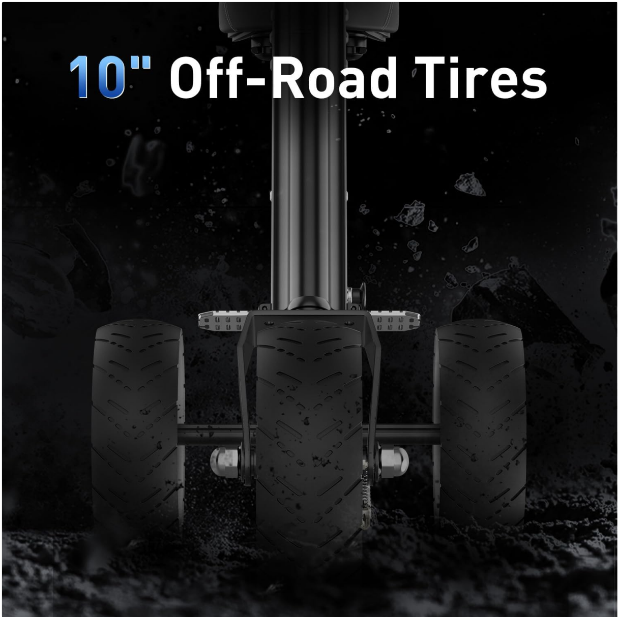
Figure 2.5: Close-up view of the 10-inch Off-Road Tires, designed for various terrains.

Your browser does not support the video tag.