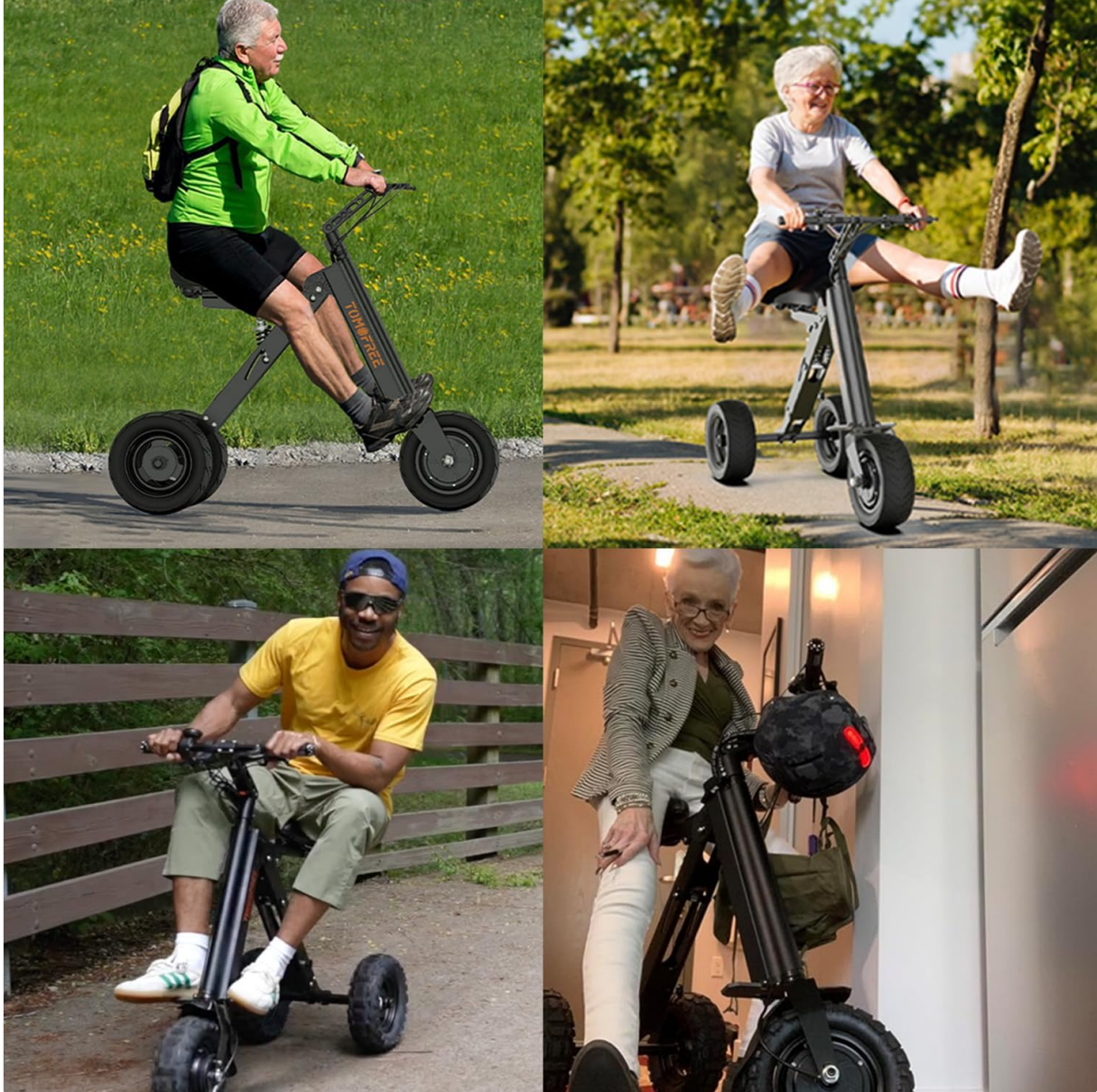
Figure 2.1: General view of the Tomofree K7 PRO scooter.