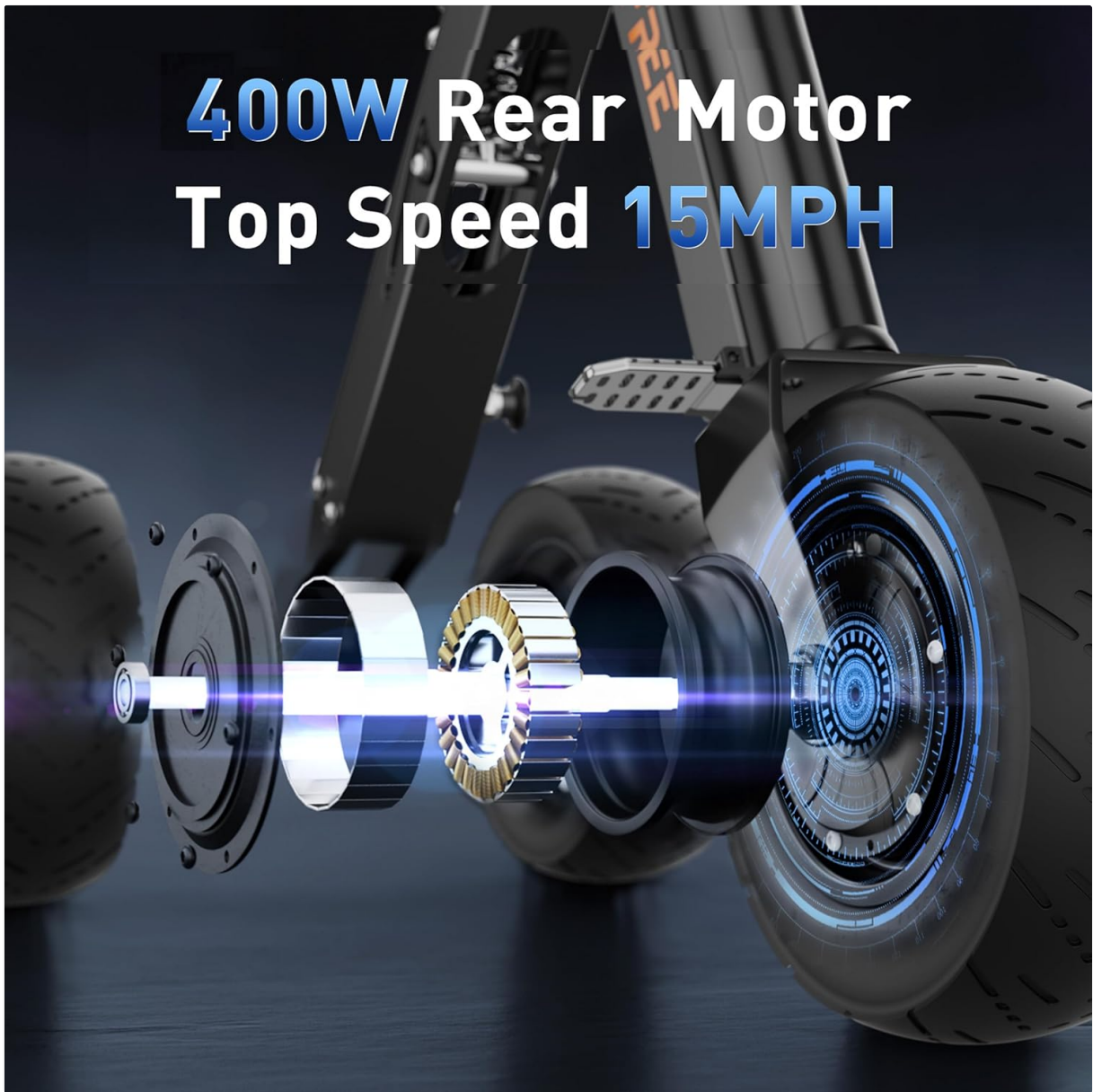
Figure 2.2: Exploded view illustrating the 400W Rear Motor, capable of speeds up to 15 MPH.