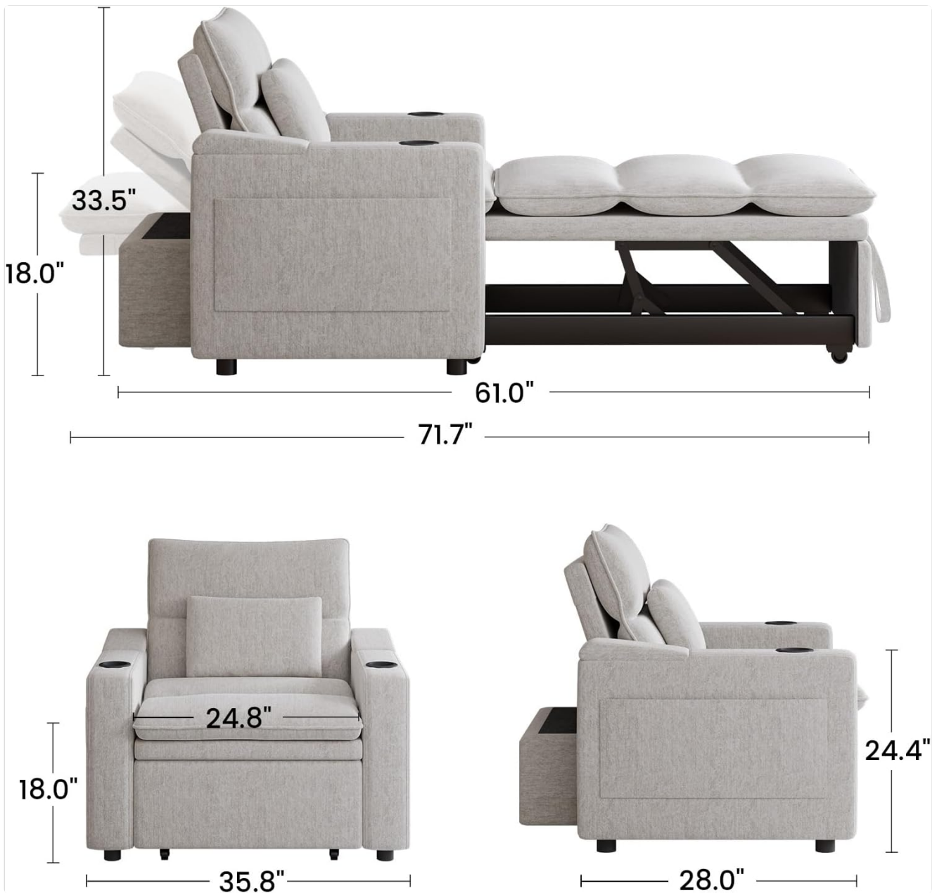
Figure 5: Product Dimensions. This image provides detailed measurements of the sleeper chair. In chair mode, it measures approximately 35.8 inches wide, 28 inches deep, and 33.5 inches high. When fully extended as a bed, the total length is approximately 71.7 inches.