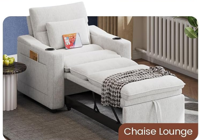
Figure 2: 3-in-1 Sleeper Chair. This image displays the three primary modes of the product: an accent chair (compact seating), a chaise lounge (extended leg support), and a sofa bed (fully flat sleeping surface).