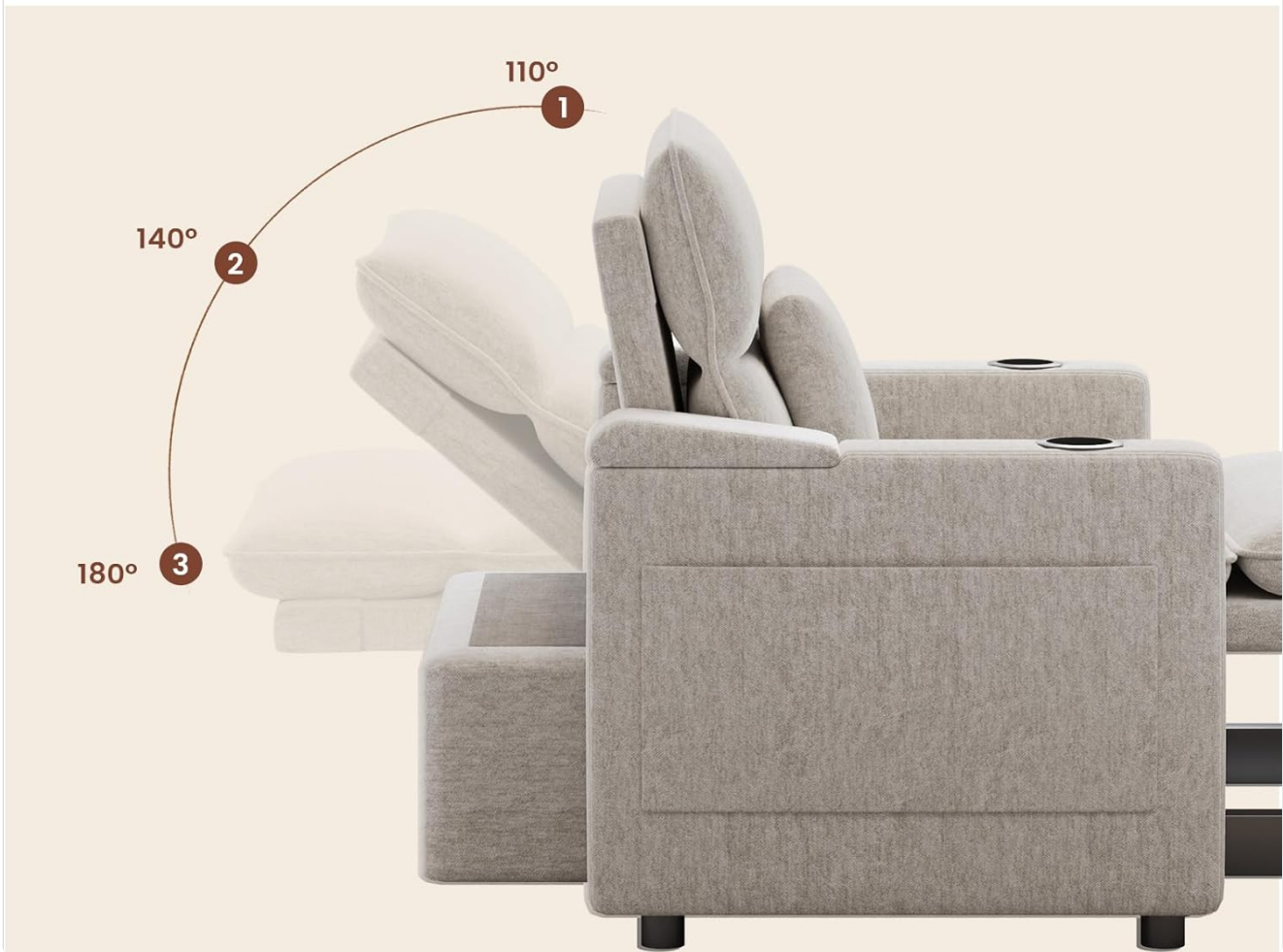
Figure 3: Adjustable Position. This diagram illustrates the three adjustable backrest angles: 110° for upright seating (e.g., gaming, watching TV), 140° for a relaxed recline (e.g., reading, napping), and 180° for a fully flat sleeping position.

The backrest can be adjusted to three angles: 110°, 140°, and 180°. To adjust, gently push or pull the backrest to the desired position until it locks into place. Ensure it is securely set before leaning back.