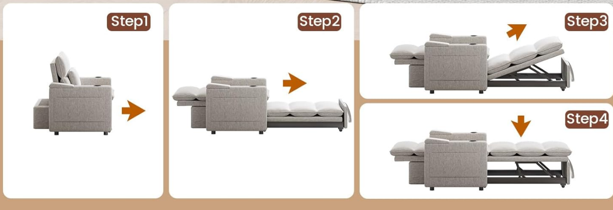
Figure 1: Easy Set-up to Bed. This image illustrates the four steps to transform the chair into a bed. Step 1 shows the chair in its upright position. Step 2 shows the seat cushion extended forward. Step 3 shows the backrest reclining and the bed frame unfolding. Step 4 shows the chair fully converted into a flat bed.

Assembly is required. It is recommended to have two people for assembly due to the product's weight and size. Follow the visual guide for proper component alignment and secure fastening.