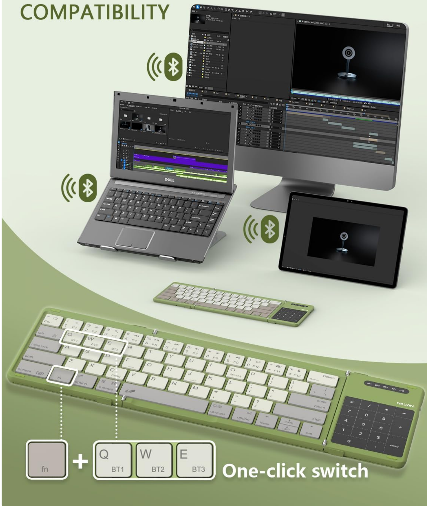
Image: The Nillkin Foldable Keyboard shown connected wirelessly to a laptop, a desktop monitor, and a tablet, demonstrating its multi-device compatibility.