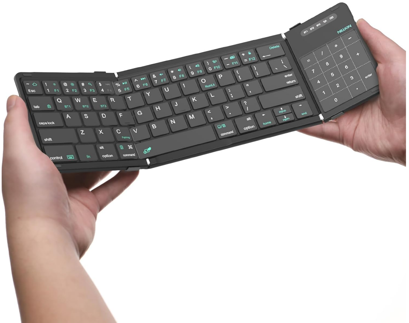
Image: The Nillkin Foldable Keyboard, fully unfolded and held in two hands, showcasing its compact yet full-size design with a numeric keypad and touchpad.