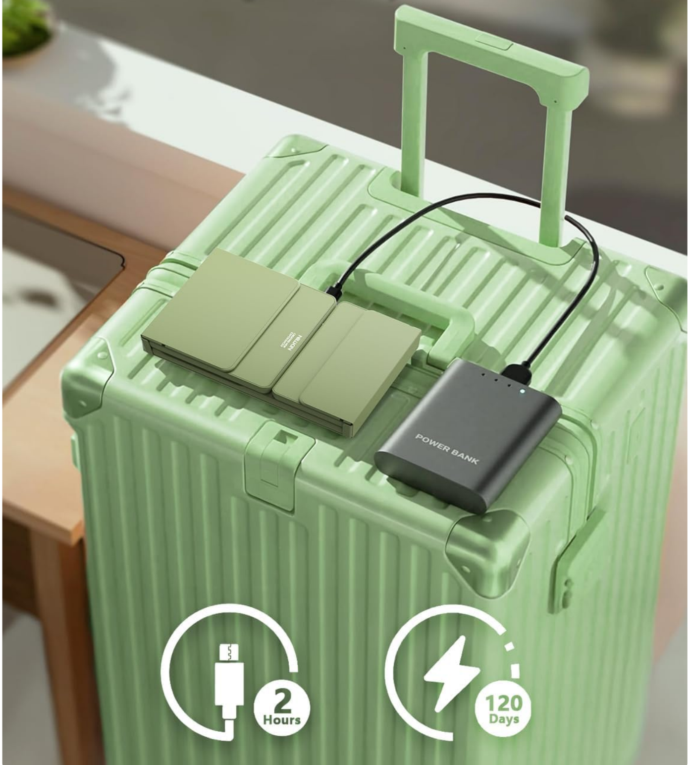
Image: The Nillkin Foldable Keyboard connected via a USB-C cable to a power bank, illustrating the charging process. The image highlights the USB-C port and charging indicator.