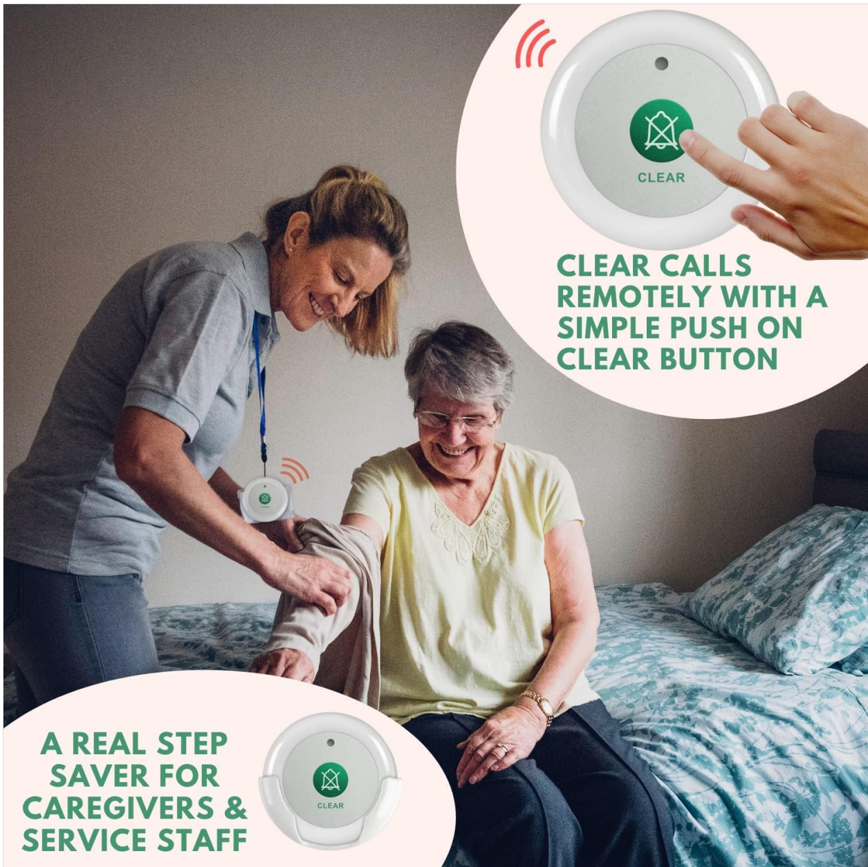
Image: A caregiver using the Clear Call Button, demonstrating its function to remotely clear calls, with an inset showing the button itself.