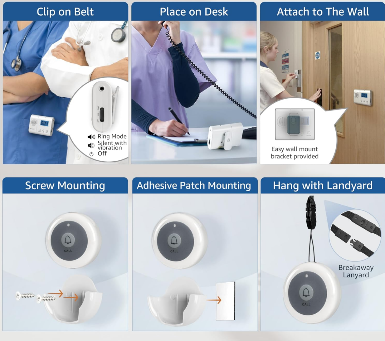
Image: A visual guide showing various mounting and carrying options for the SYNLETT devices, including clip-on belt, desk placement, wall attachment, screw mounting, adhesive mounting, and hanging with a lanyard.