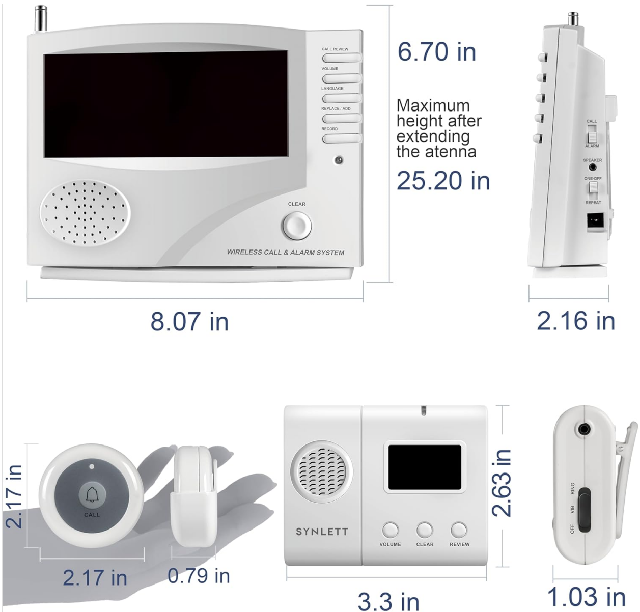
Image: A diagram showing the precise dimensions of the Monitoring Unit, LCD Pager, and Call Button in inches.