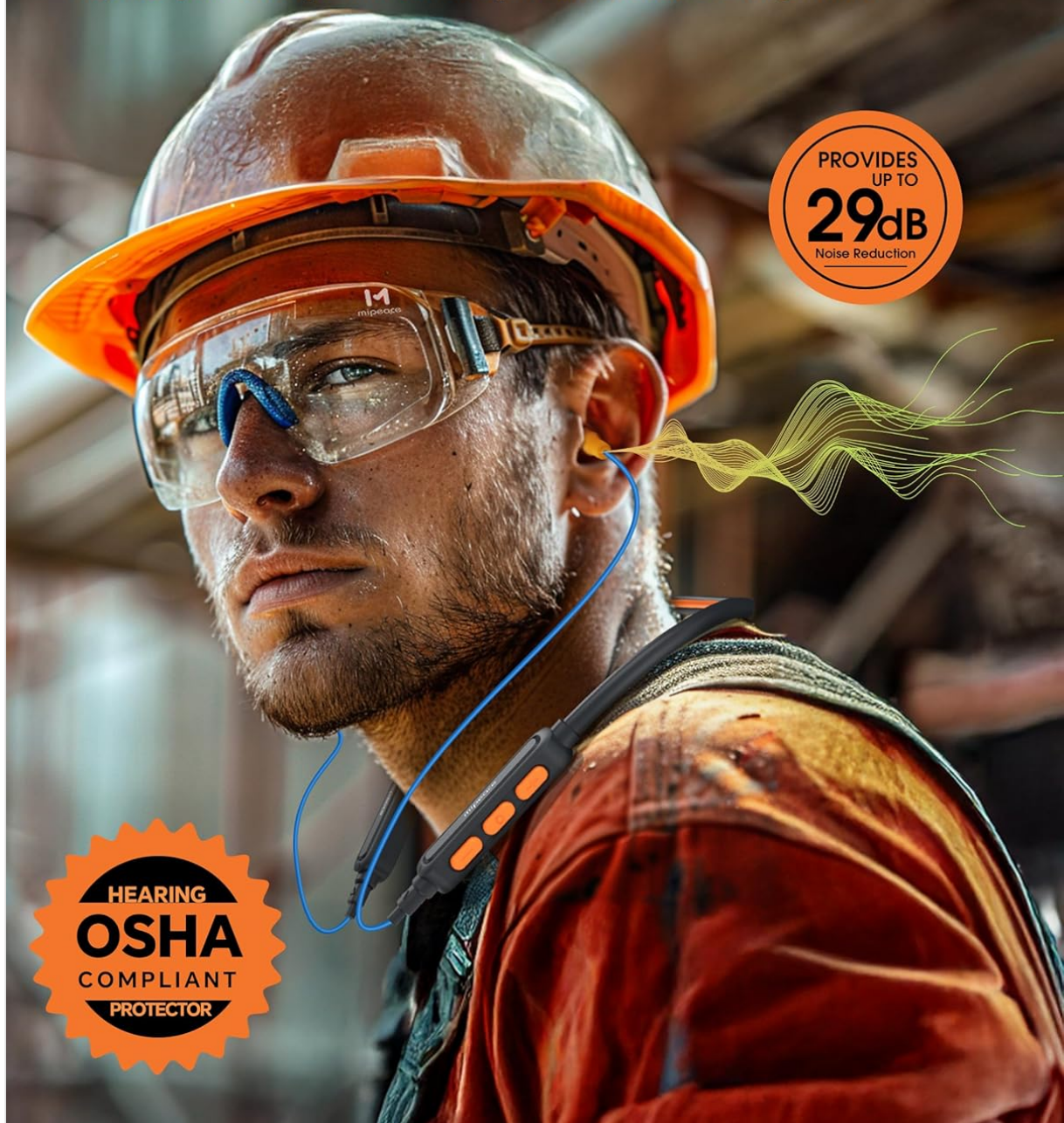
Figure 1.1: A worker wearing MIPEACE MI04U headphones in a construction setting, demonstrating their use for hearing protection and communication in noisy environments.

Stay compliant and protected from power tool noise at the jobsite.