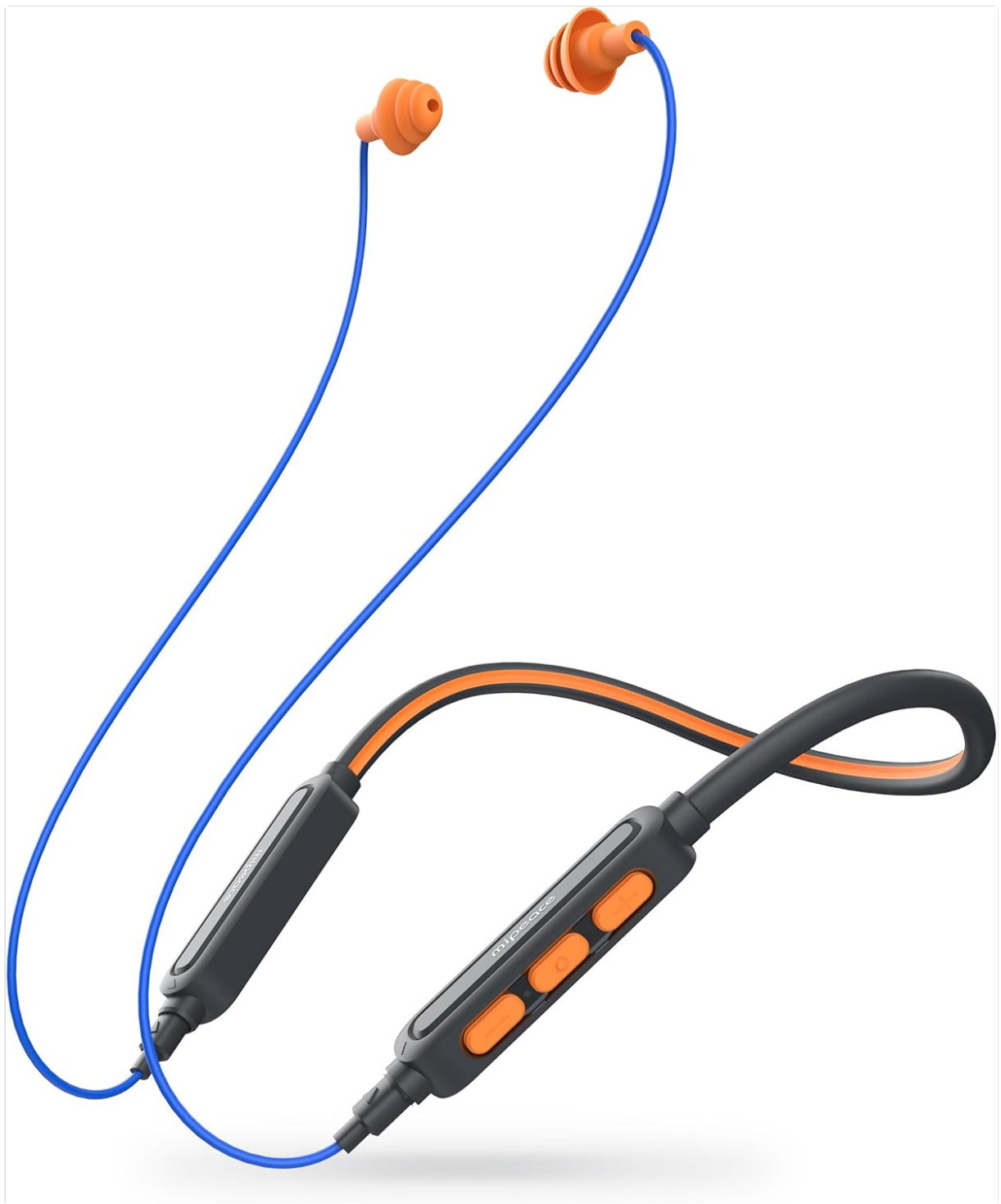
Figure 4.1: MIPEACE MI04U Neckband Bluetooth Work Headphones. This image displays the full product, including the neckband, control panel, and earplugs with blue cables.