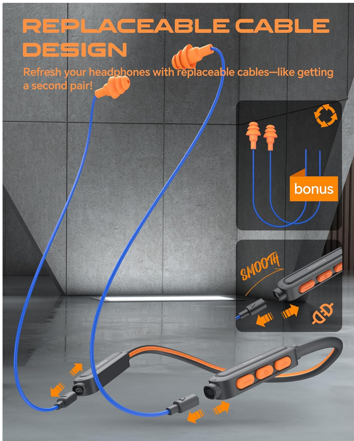
Figure 5.2: Diagram illustrating the replaceable eartip cable design. The image shows how to detach and reattach the eartip cables from the neckband, highlighting the ease of replacement.