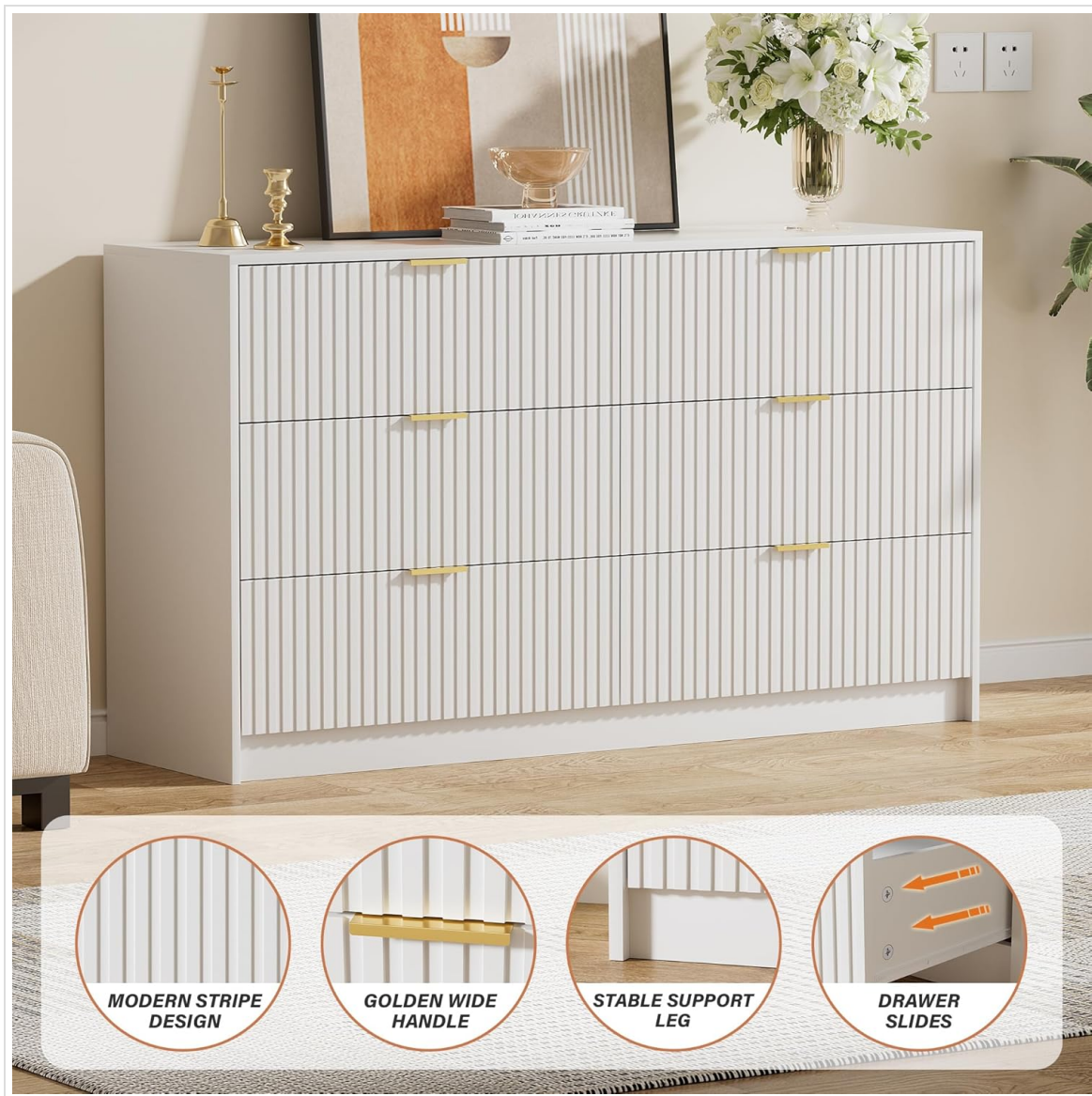
Image: Visual representation of key features such as the modern stripe design, golden handles, stable support legs, and smooth drawer slides.