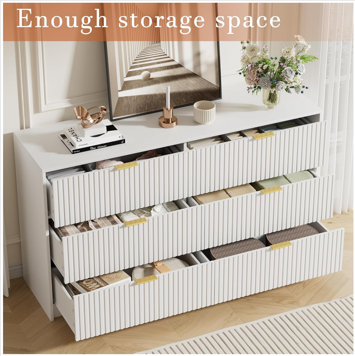
Image: The dresser with multiple drawers open, illustrating the generous storage capacity for organizing various belongings.