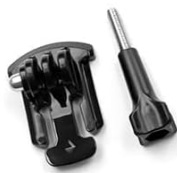
Flat Bottom Bracket*1