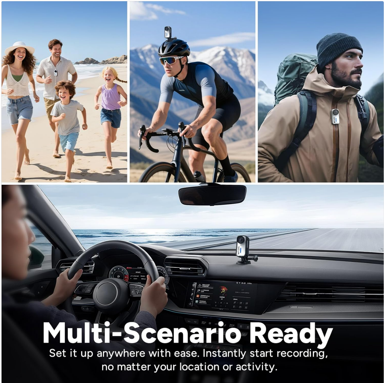
Image: Multi-Scenario Ready mounting options.