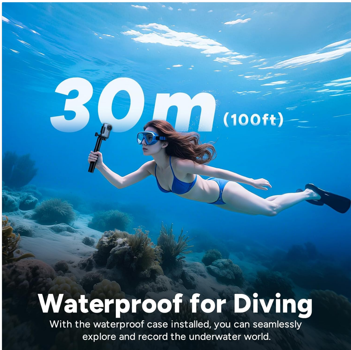
Image: Waterproof for Diving with the waterproof case.