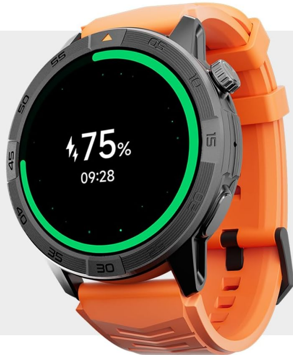
Image: The AGM Legion Pro Smart Watch showcasing its impressive battery life: 370 mAh, 10 days of heavy use, and over 30 days on standby.