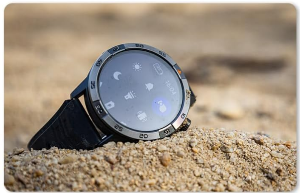
Image: The AGM Legion Pro Smart Watch highlighting its crisp Gorilla Glass display and military durability standard MIL-STD-810H, shown in a rugged outdoor setting.

Shielded by ultra-tough Gorilla Glass, it's built to withstand abuse. Surpassing its predecessor, it is now more rugged than ever!