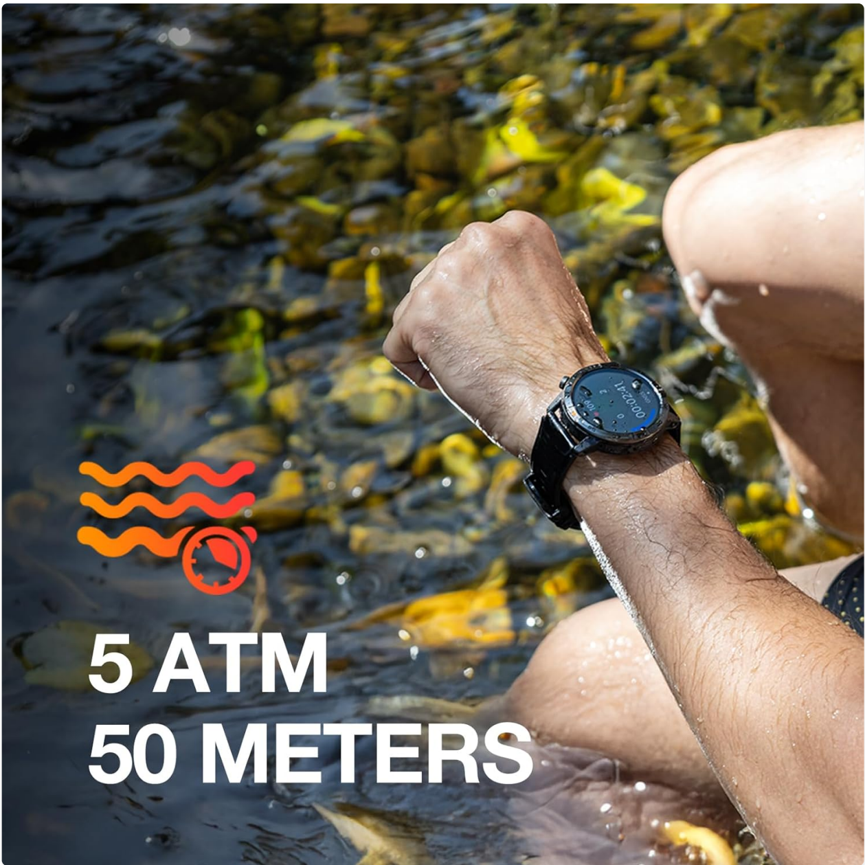
Image: A hand wearing the AGM Legion Pro Smart Watch submerged in water, illustrating its 5 ATM (50 meters) water resistance.

Your browser does not support the video tag.