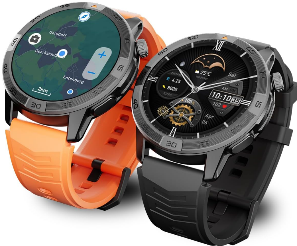
Image: The AGM Legion Pro Smart Watch with key display specifications: 1.43-inch AMOLED screen, 60Hz refresh rate, and 600 Nits maximum brightness.