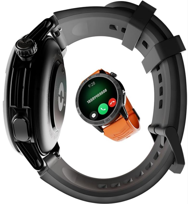
Image: A user making a call directly from the AGM Legion Pro Smart Watch on their wrist, demonstrating the Bluetooth calling feature.