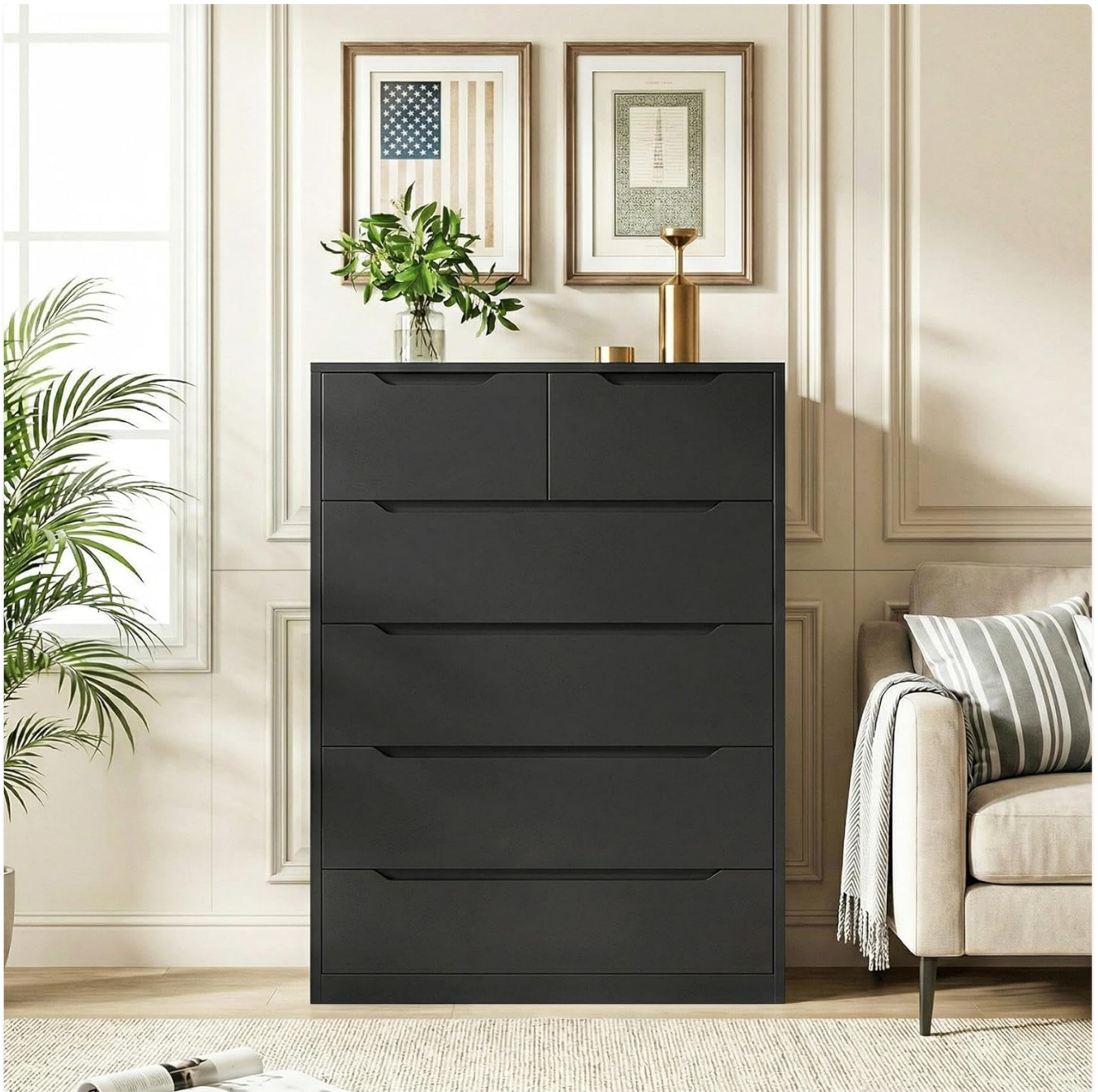
Image: The Romorgniz 6-Drawer Dresser, black, positioned in a modern living room with a sofa and plants.

Your browser does not support the video tag.