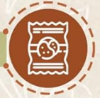
Image: An illustration detailing the storage capacity of the dresser, indicating space for over 40 books, 50 t-shirts, 40 pants, 20 blankets, and 30 snacks.