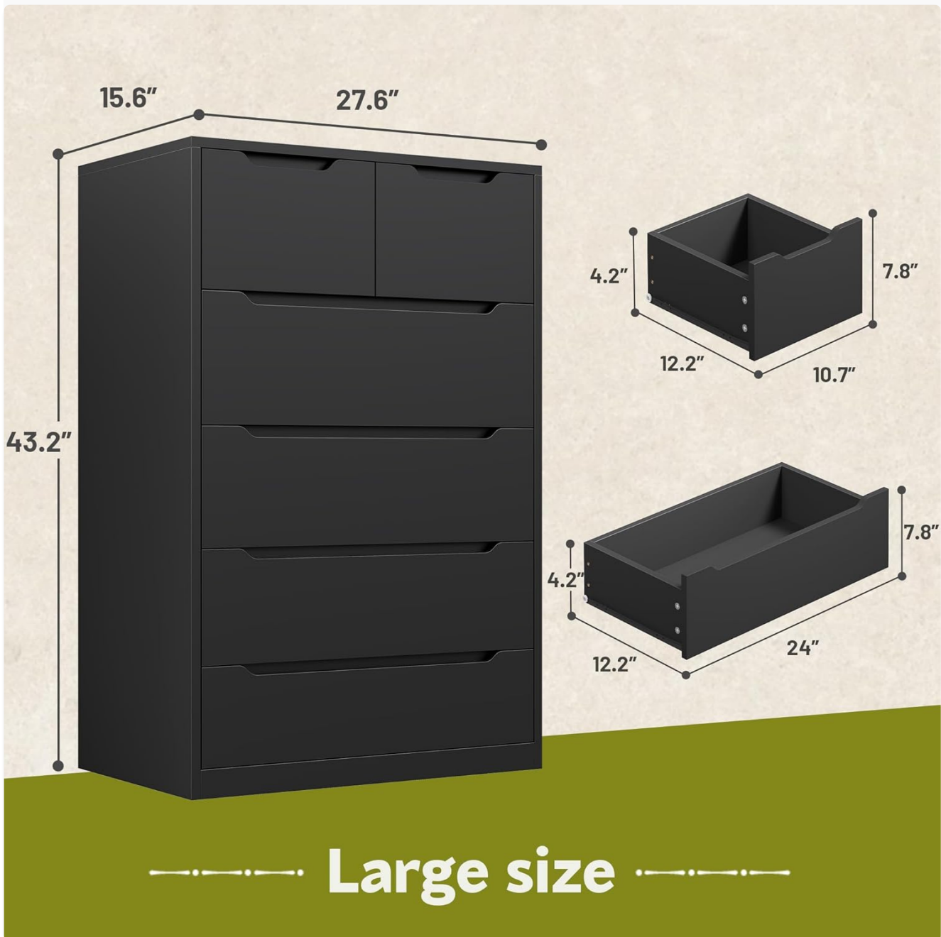
Image: A diagram illustrating the overall dimensions of the dresser (43.2"H x 27.6"W x 15.6"D) and the internal dimensions of both large and small drawers.