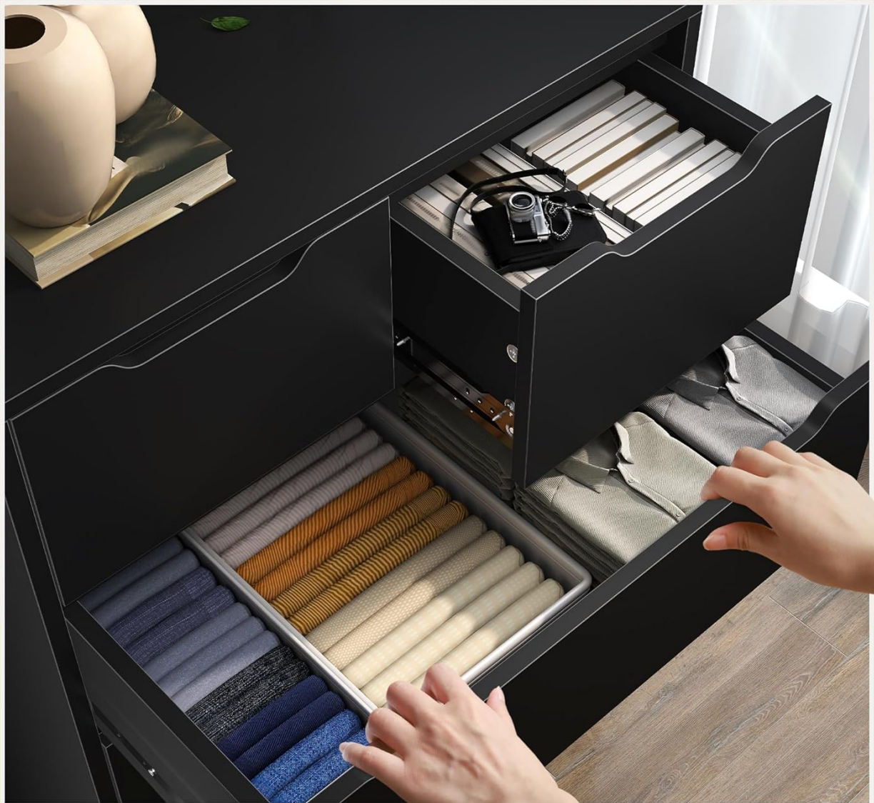
Image: A close-up view of the dresser drawers, demonstrating how items can be classified and stored in the two different drawer sizes.