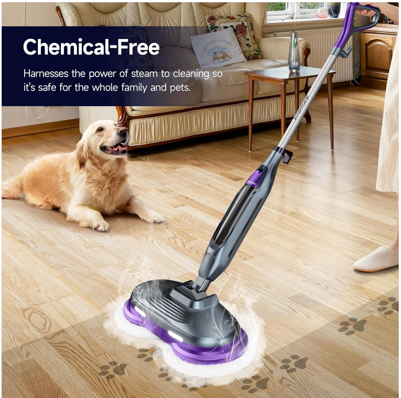
Image: The AlfaBot F2 Steam Cleaner in use on a wooden floor in a home setting, with a dog nearby, highlighting its chemical-free operation for a safe environment for families and pets.

Harnesses the power of steam to cleaning so it's safe for the whole family and pets.