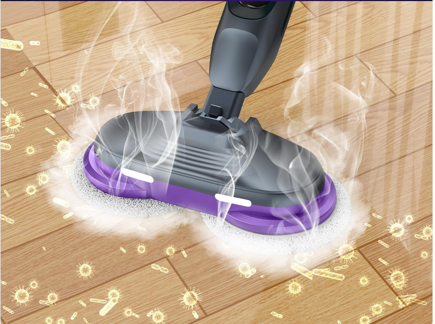
Image: The AlfaBot F2 Steam Cleaner, showing its main components including the handle, water tank, and cleaning head with rotating pads.