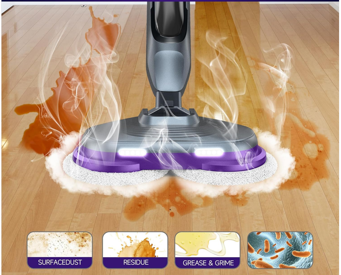
Image: The AlfaBot F2 Steam Cleaner effectively tackling different types of floor stains, including surface dust, residue, grease, and grime, using the power of steam.

It effectively tackles stains while being mild on floors.