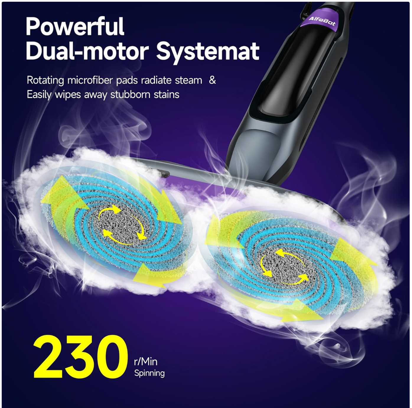
Image: The AlfaBot F2 Steam Cleaner actively cleaning a floor, demonstrating the powerful dual-motor system with rotating microfiber pads and steam emission. The pads spin at 230 revolutions per minute.

Rotating microfiber pads radiate steam & Easily wipes away stubborn stains