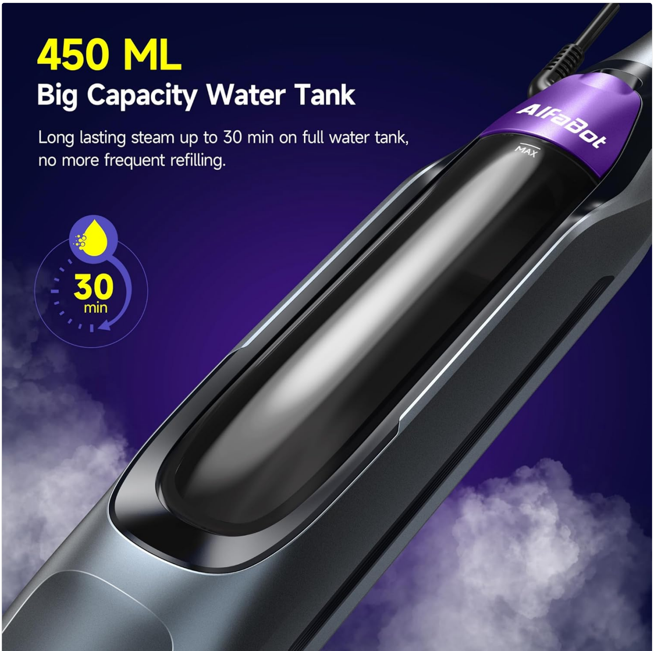
Image: A close-up view of the 450 ml water tank on the AlfaBot F2, showing the 'MAX' fill line. This tank allows for up to 30 minutes of continuous steam.