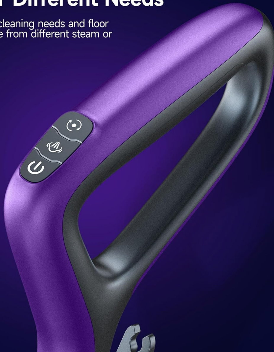
Image: The handle of the AlfaBot F2 Steam Cleaner, highlighting the On/Off button, Steam button, and Speed control button for selecting cleaning modes.