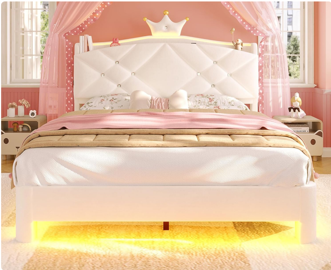
Image 1.1: Overview of the MSmask Full Bed Frame with LED lights activated.