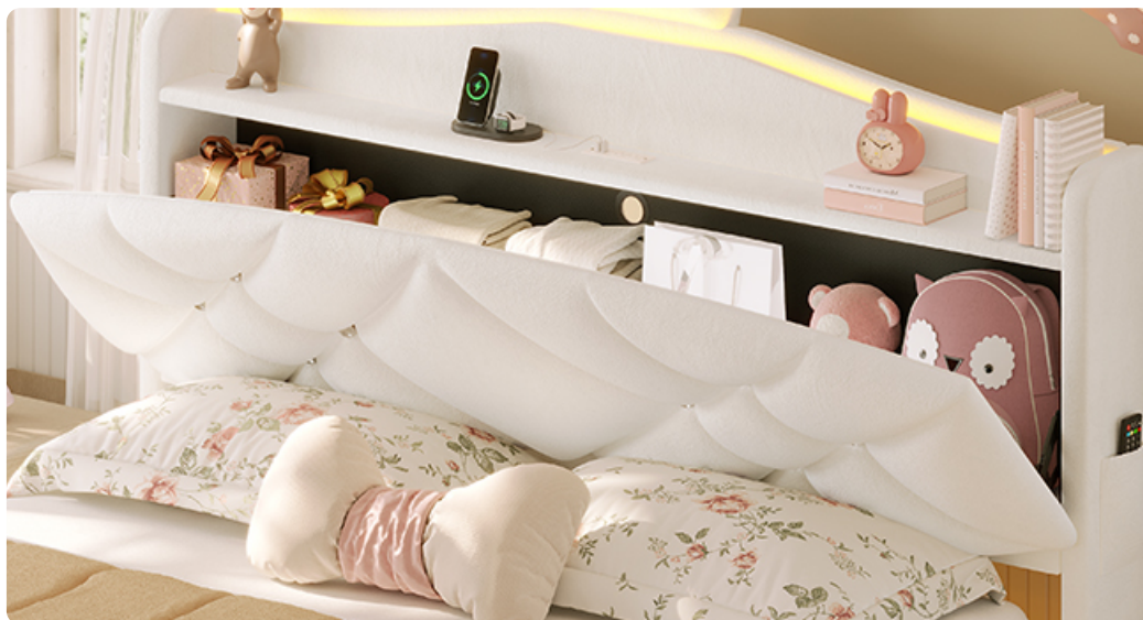
Image 5.3: View of the large storage headboard, showing the open shelf and side pockets.