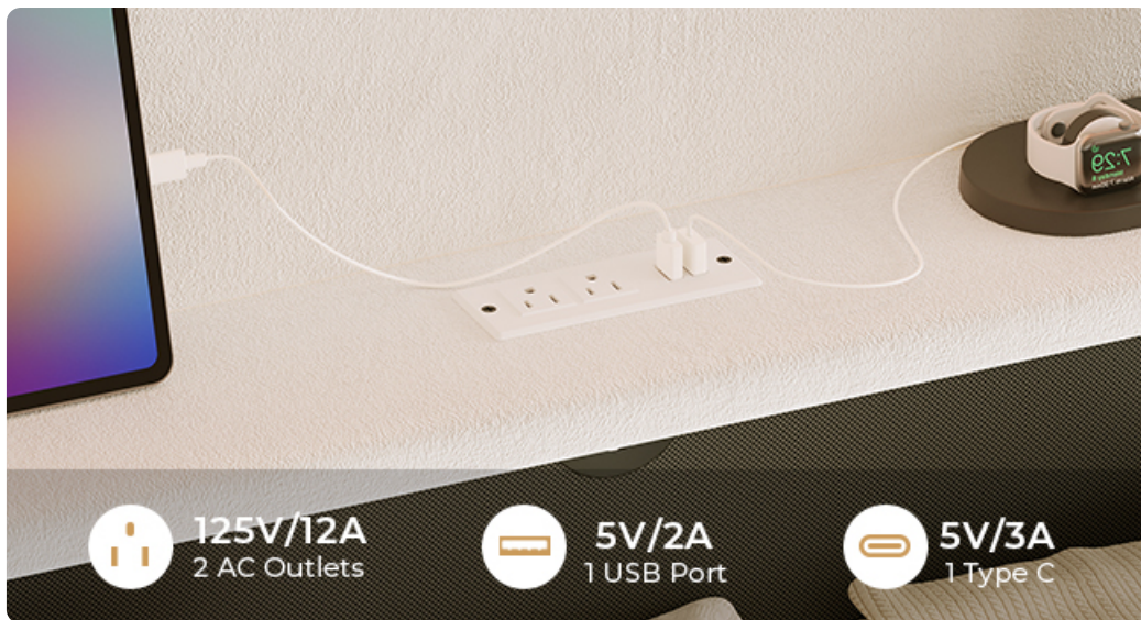
Image 5.2: Close-up of the built-in charging station with 2 AC outlets, 1 USB port, and 1 Type-C port.