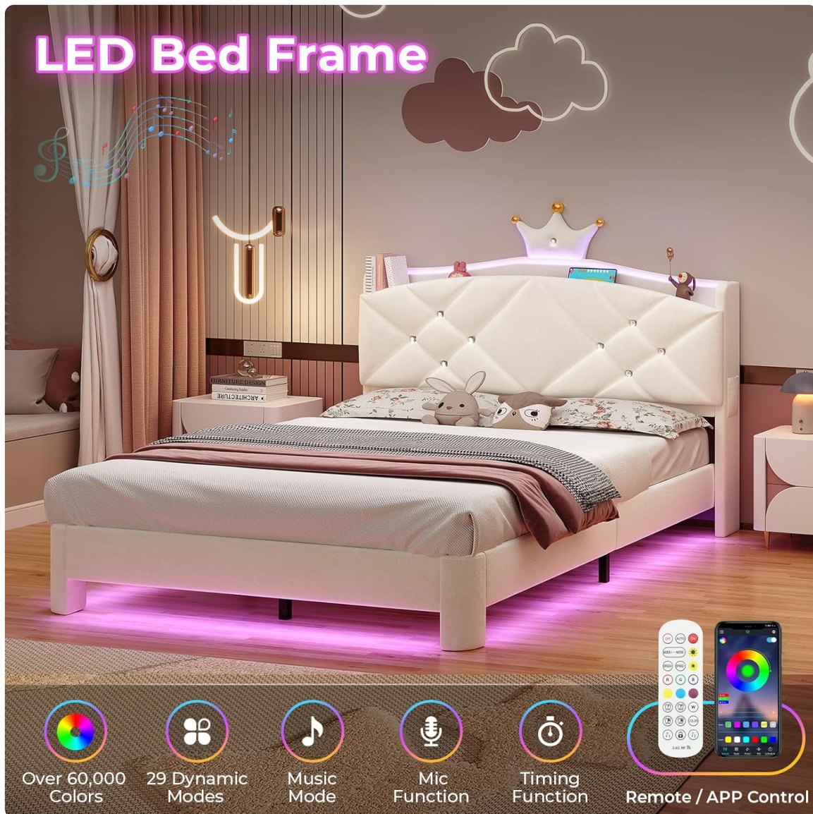
Image 5.1: Visual representation of LED light features including color options, dynamic modes, music mode, mic function, timing function, and control via remote or app.