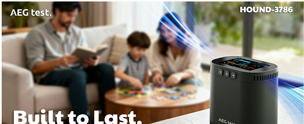
Image: Comparison of HOUND-3786's fast reading capability against other radon detection methods.

The AEGTEST HOUND-3786 Radon Detector is designed for fast and accurate detection of radon levels in your home or office. It provides real-time data with updates every 10 minutes, stable readings within 1 hour, and comprehensive long-term monitoring capabilities. Featuring a large 3.5-inch color display, intuitive controls, and multiple alert modes, this device helps safeguard your family's health by providing clear and actionable radon information.