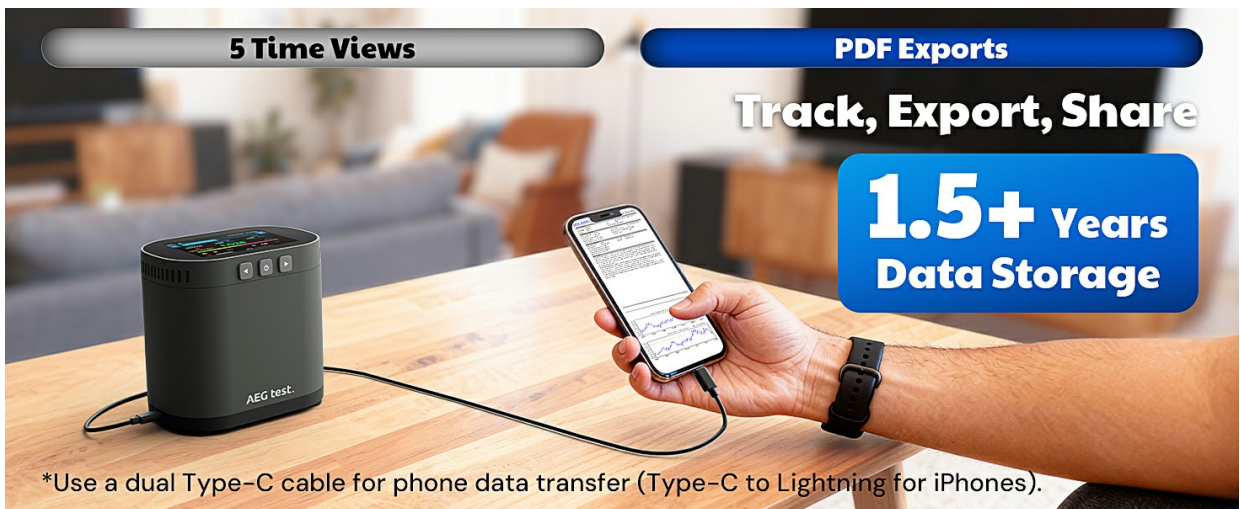
Image: The HOUND-3786 screen showing built-in data charts and historical data storage for over 1.5 years.

The device stores over 1.5 years of historical data, which can be viewed directly on the unit through built-in charts. For detailed analysis, you can easily export PDF reports to your phone or computer using the charging data cable. No additional app or lab services are required for data export.