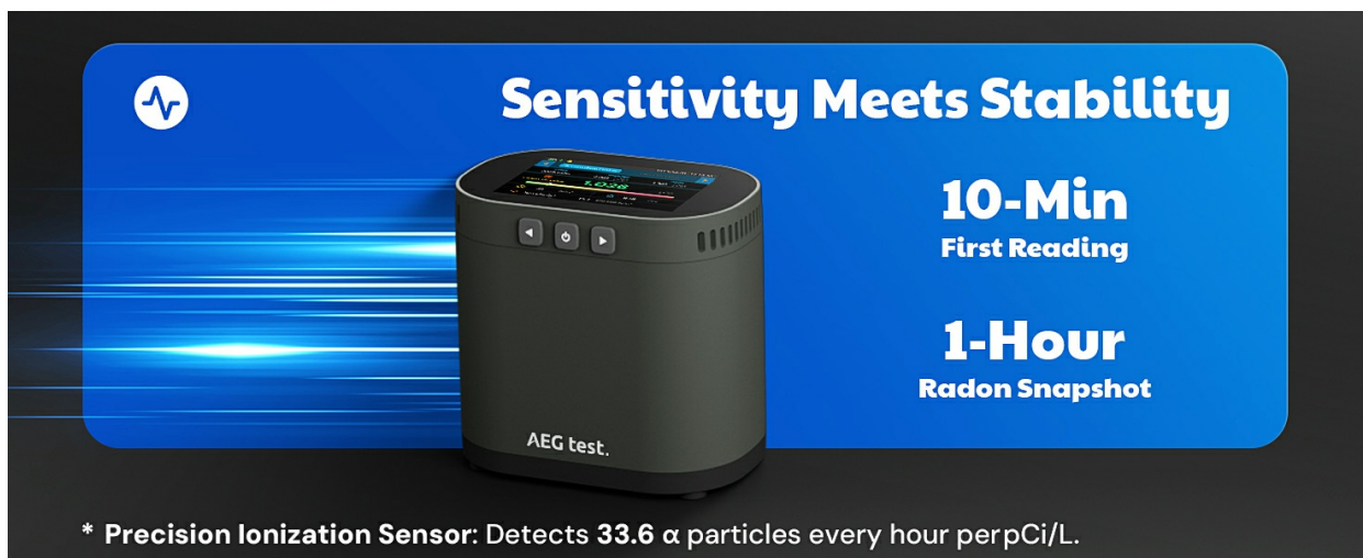
Image: The HOUND-3786 display showing the rapid 10-minute first reading and 1-hour radon snapshot.

The HOUND-3786 is designed for immediate use. Simply unbox the device and connect it to a power source using the provided USB-C cable. The device will power on automatically. The large 3.5-inch color LCD screen will display initial readings within 10 minutes, with stable data available within 1 hour.