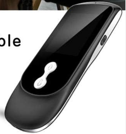
Image Description: The Smart Voice Translator Device is shown next to a graphic indicating Wi-Fi compatibility. Text states, "Online translation is possible by connecting Wi-Fi in the UK and abroad."

Online translation is possible by connecting Wi-Fi in the UK and abroad.