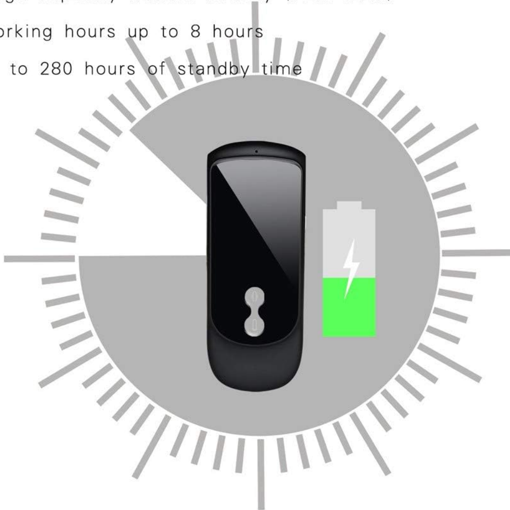
Image Description: A graphic depicting the long standby time of the translator device. It highlights a large capacity lithium battery (1500 mAh), working hours up to 8 hours, and up to 280 hours of standby time (note: product description states 114 hours standby, this image may be for a different variant or an older specification. Please refer to the product specifications in Section 3 for accurate standby time).