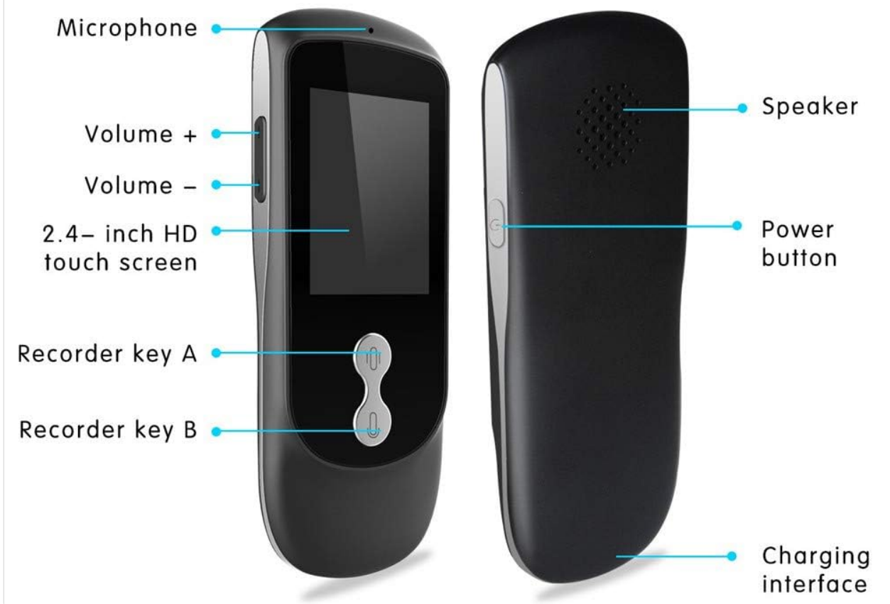
Image Description: A diagram illustrating the front and side views of the Smart Voice Translator Device. Key components are labeled with pointers: Microphone, Volume +, Volume -, 2.4-inch HD touch screen, Recorder key A, Recorder key B, Speaker, Power button, and Charging interface.