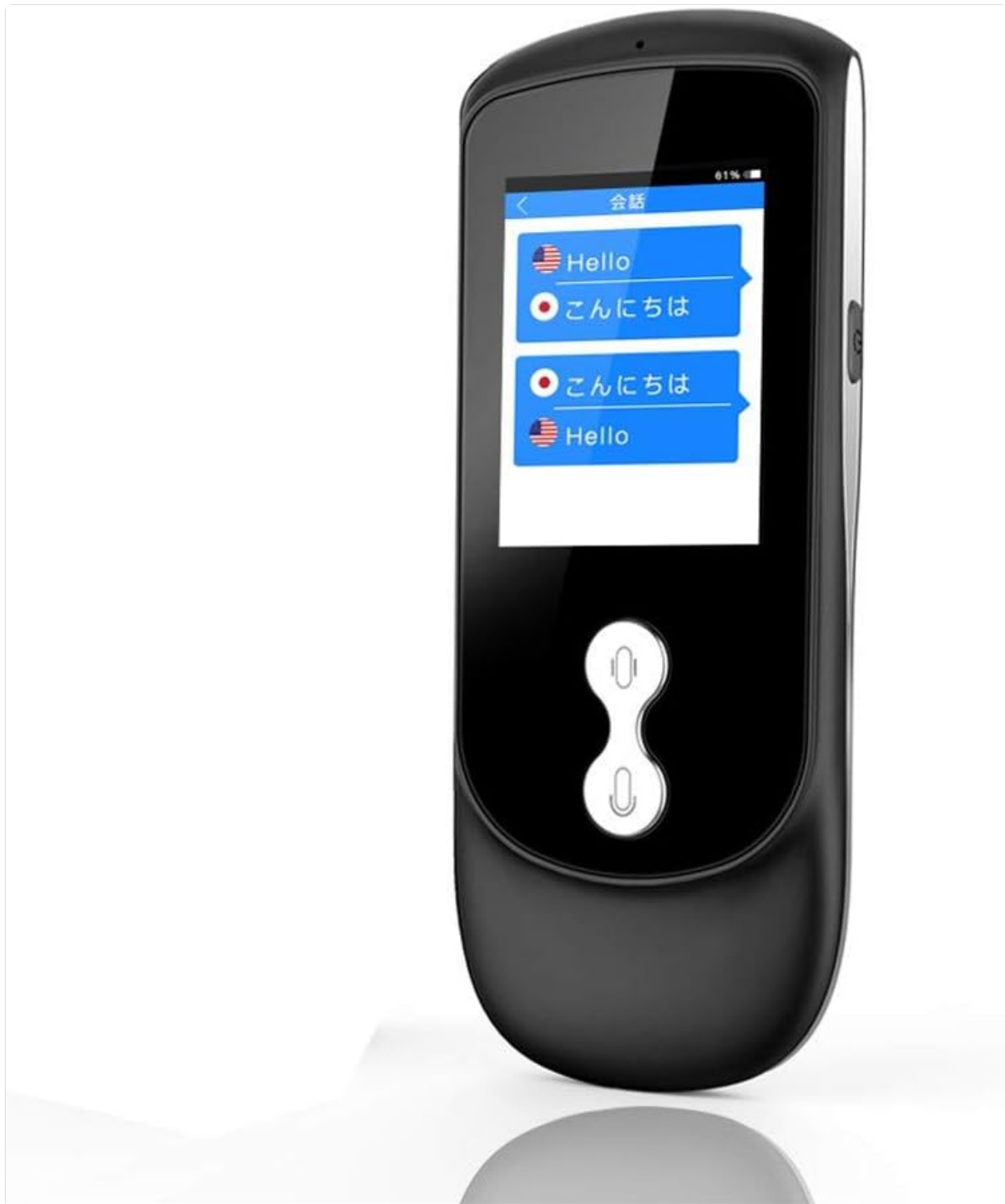
Image Description: The Smart Voice Translator Device screen shows a conversation in progress, translating between English ("Hello") and Japanese ("こんにちは"). The interface clearly indicates the source and target languages for each spoken phrase.