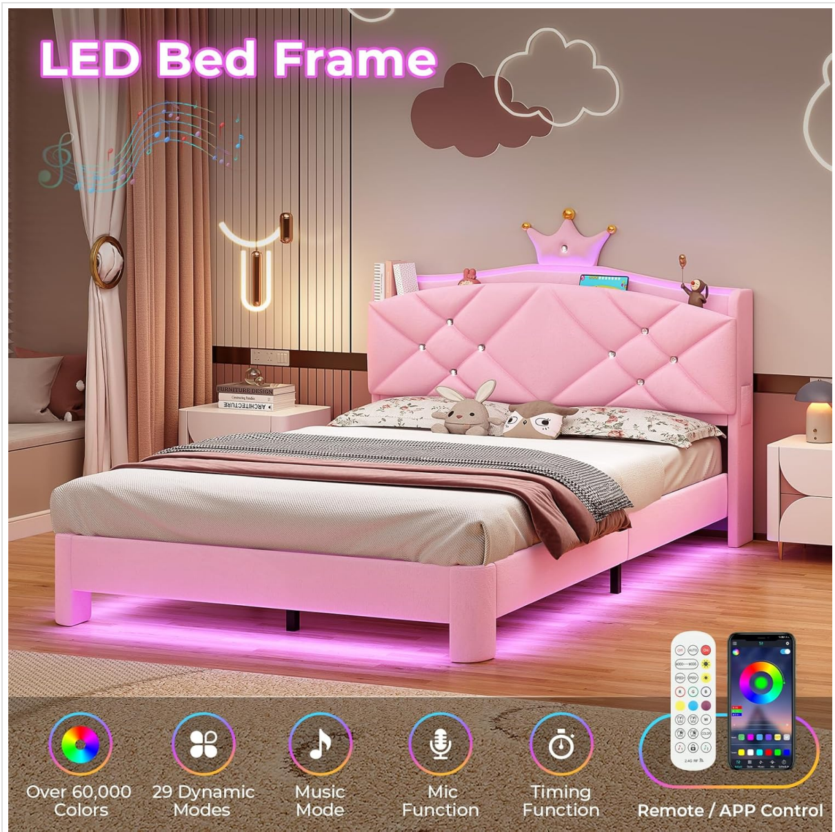
Image: The MSmask bed frame illuminated by its LED lights, with an overlay showing the remote control and smartphone app interface for light customization.