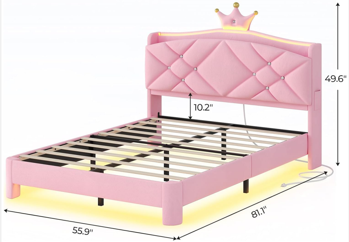
Image: A diagram illustrating the full dimensions of the MSmask bed frame, including length, width, and height, along with the 1000 lbs weight capacity.