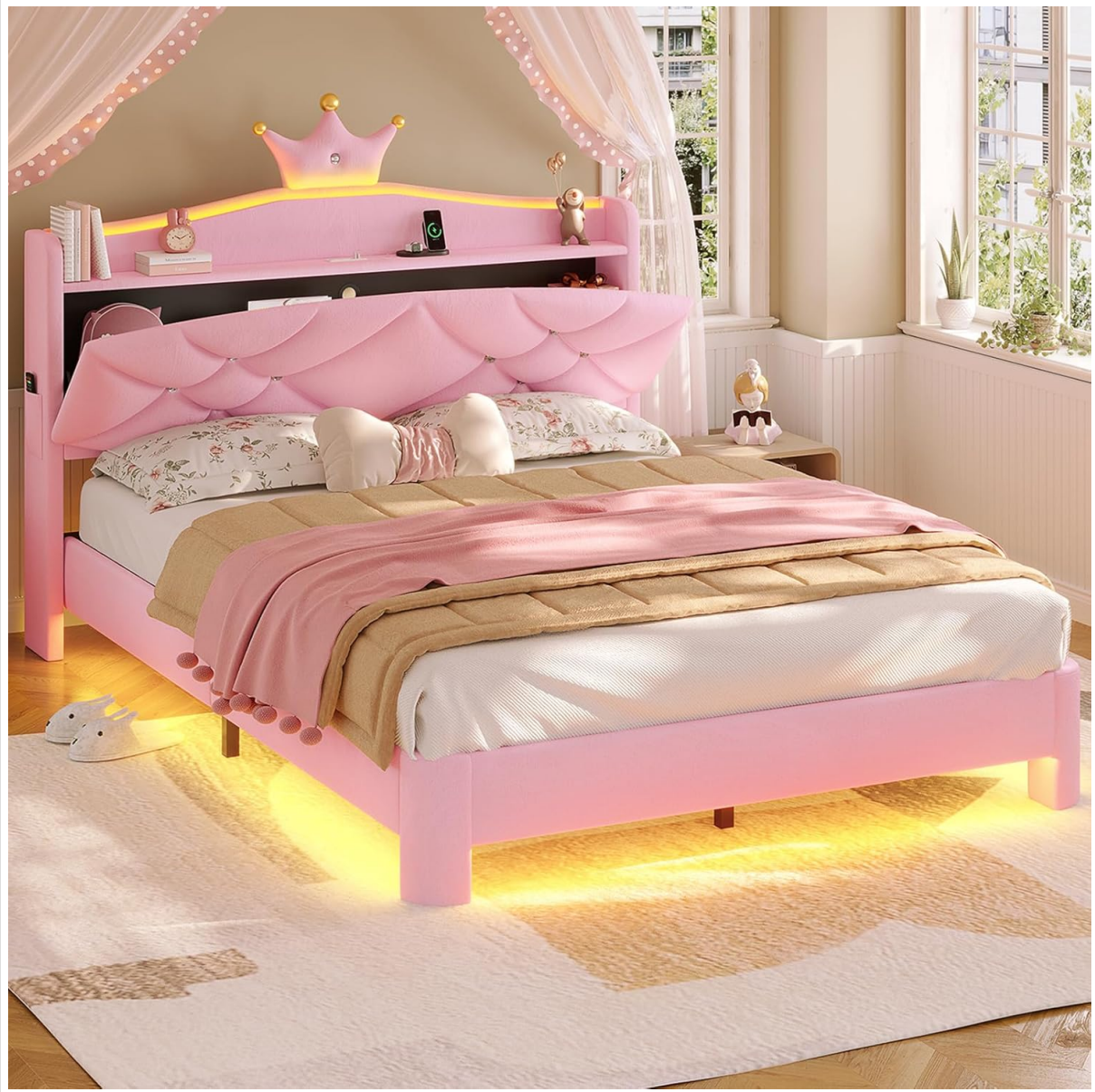
Image: The MSmask Full Princess Upholstered Bed Frame, showcasing its pink velvet upholstery, LED lighting, and headboard design.