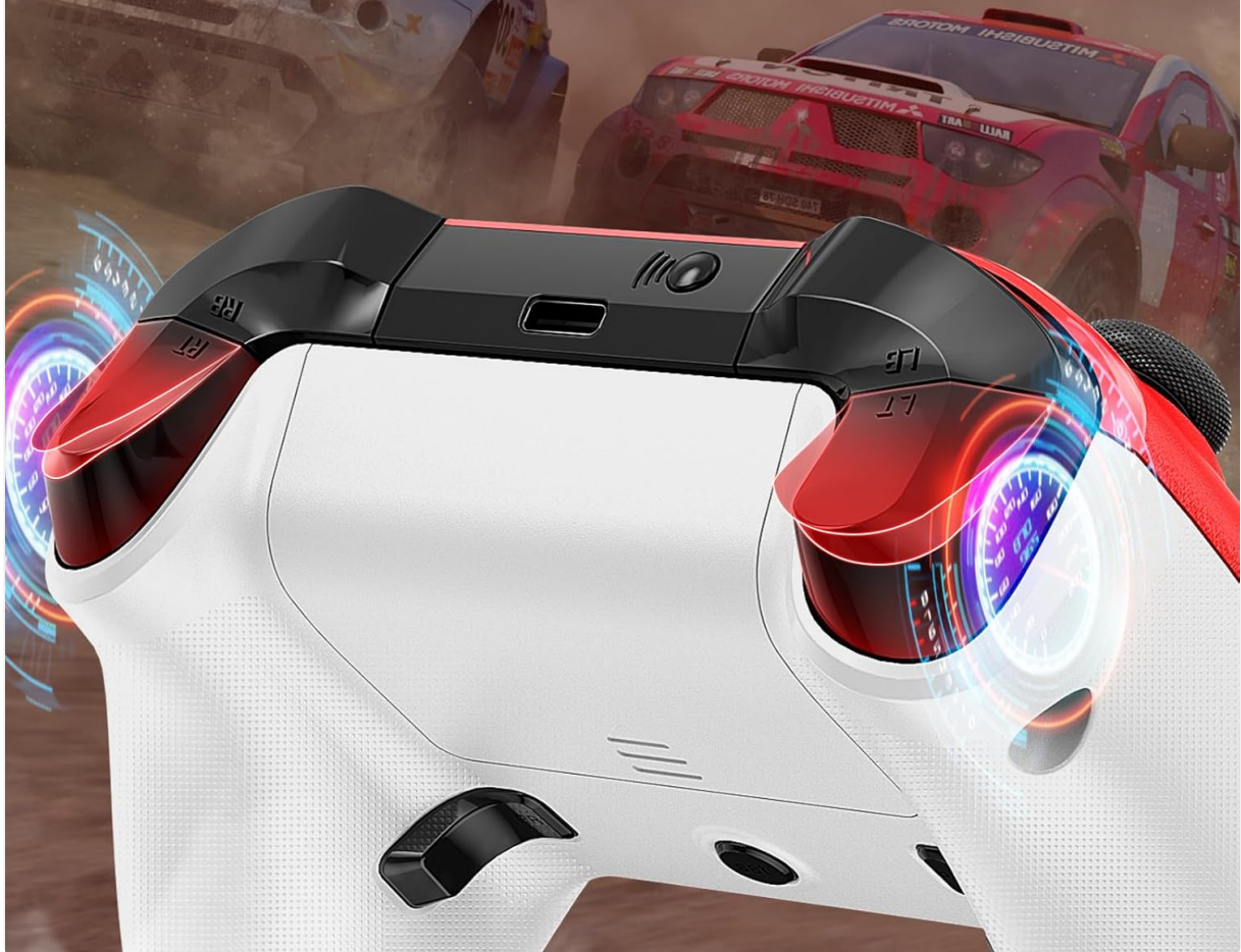
Figure 4.2: Linear Triggers with responsive feedback.

Responsive & Accurate, Hall Effect Linear Trigger with vibration function offers an immersive gaming experience