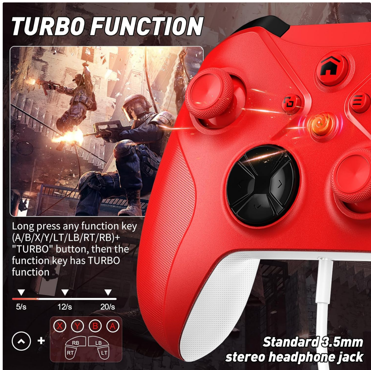
Figure 4.3: Activating the TURBO function.