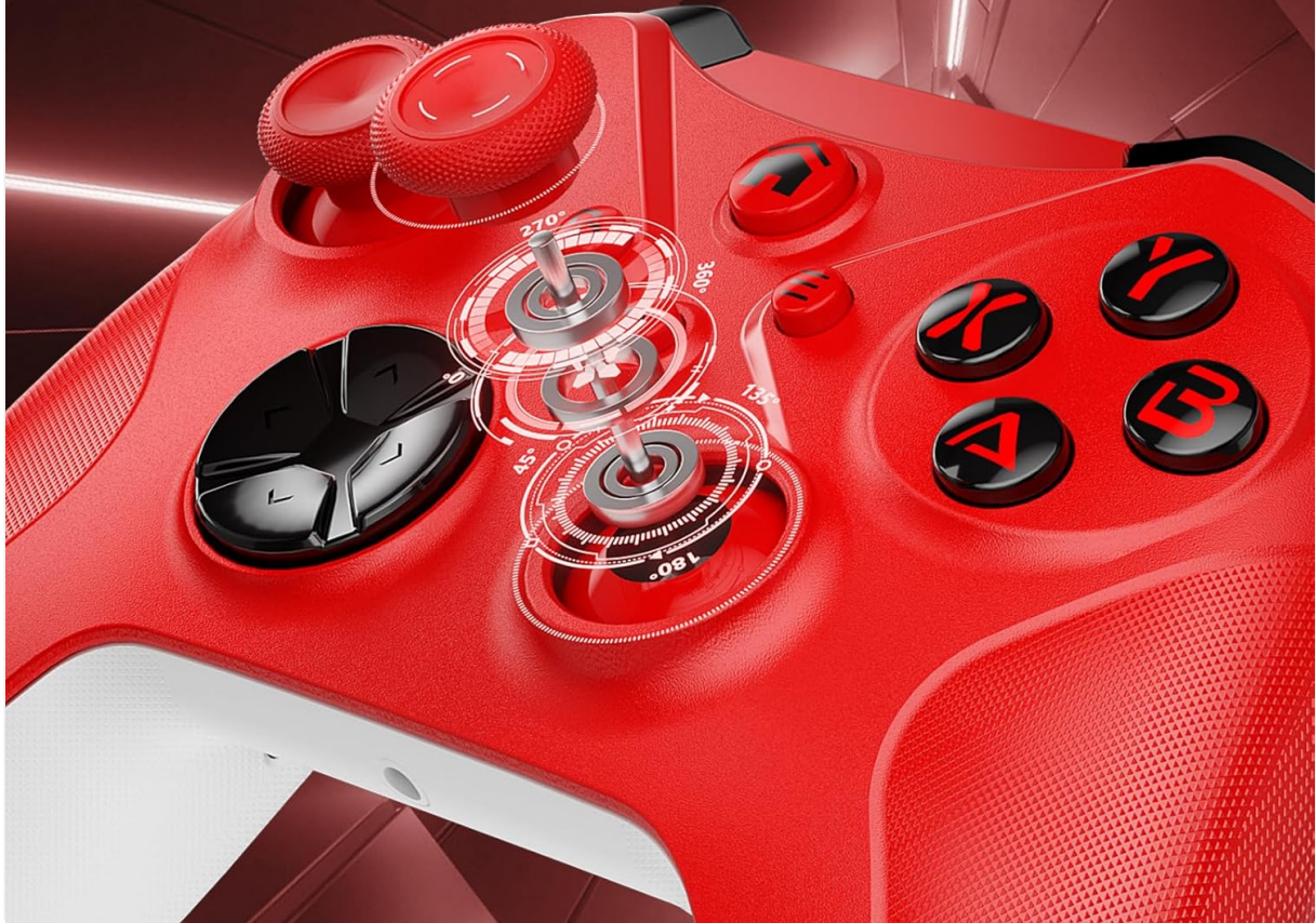
Figure 4.1: Hall Effect Joysticks for precise control.

Zero delay, 360° response without interval, the game is fast and accurate