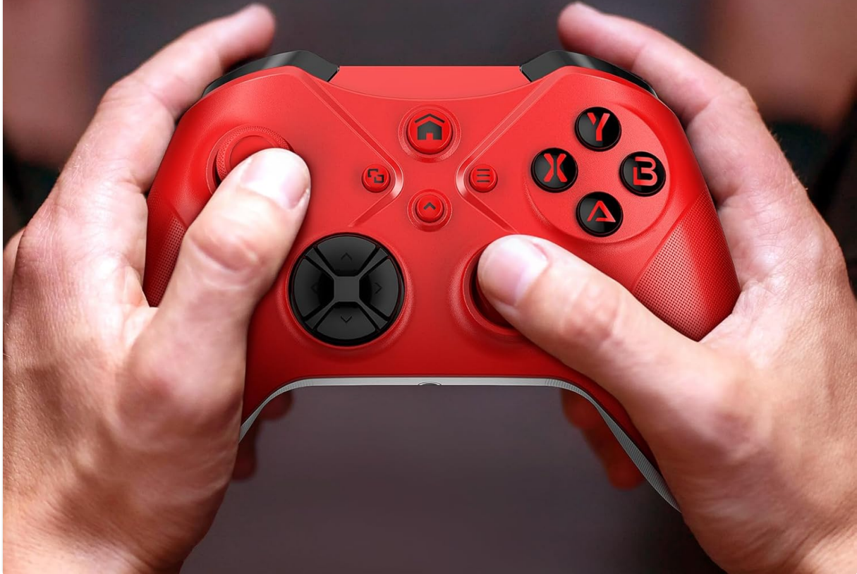
Figure 3.2: Controller compatible with multiple platforms.

Note: Connecting to Xbox may need update manually Please contact us to obtain the update zip or download the upgrade process from "Product guides and documents--- User Guide (PDF)"!!