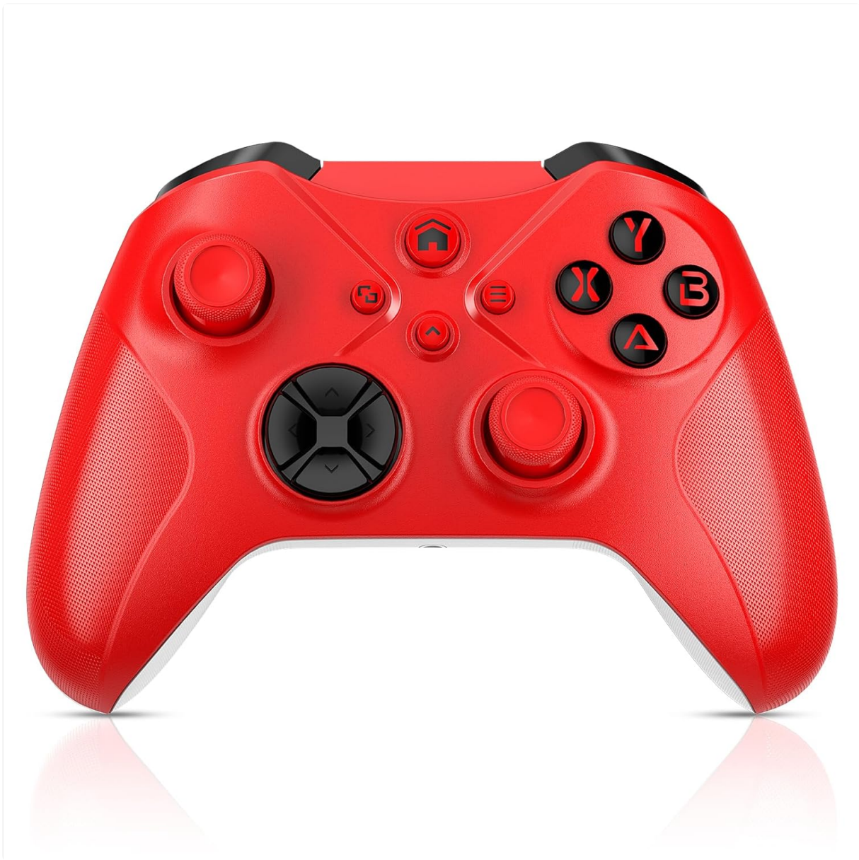
Figure 2.1: Front view of the Dinosoo Wireless Controller.