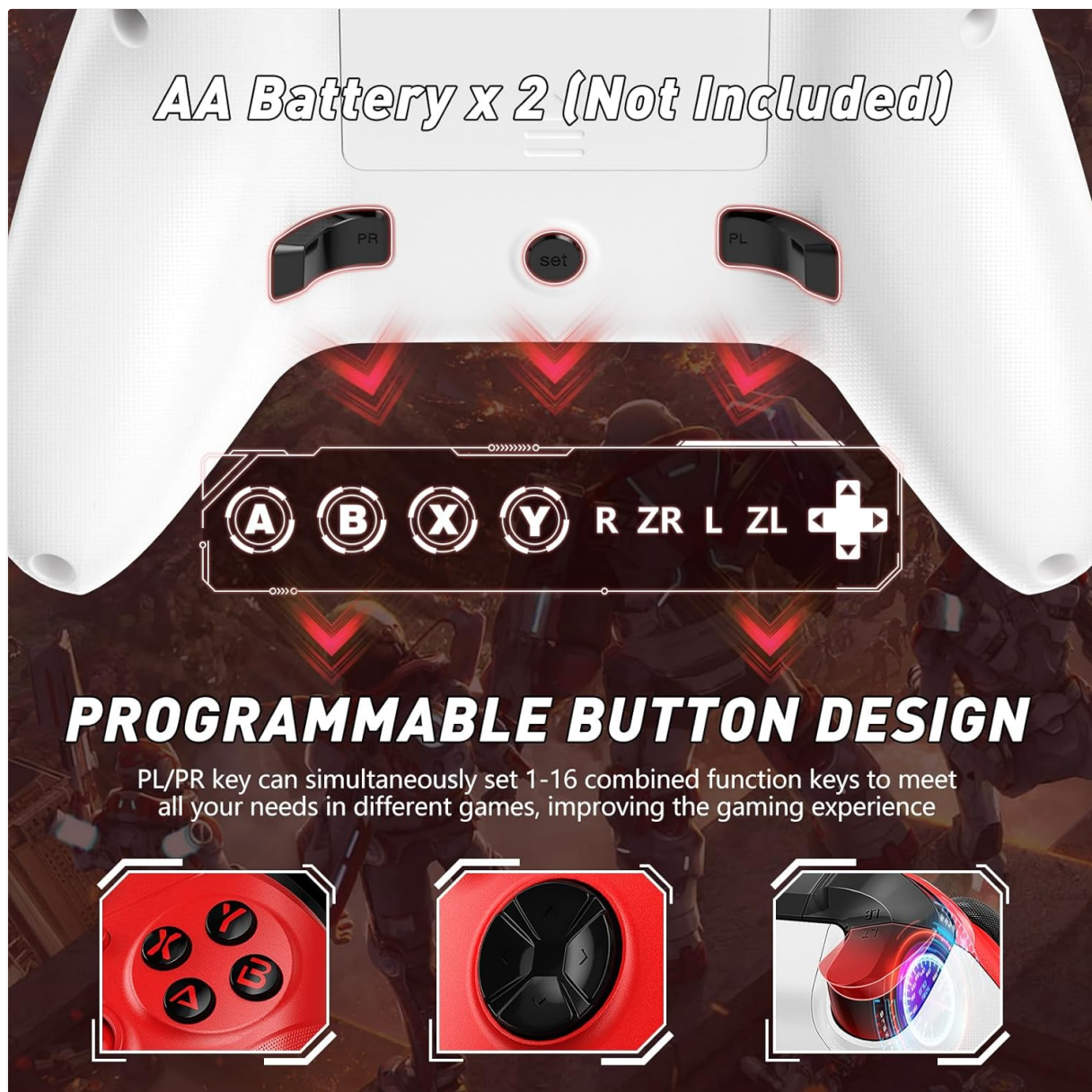
Figure 4.4: Programmable PL/PR buttons on the back of the controller.