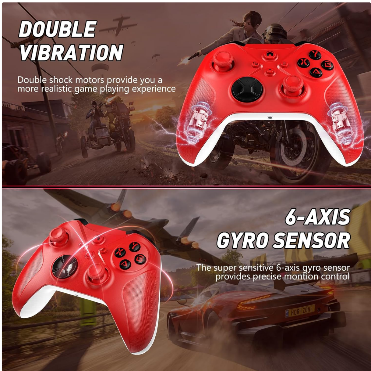
Figure 4.5: Dual vibration motors and 6-axis gyro sensor for enhanced gameplay.