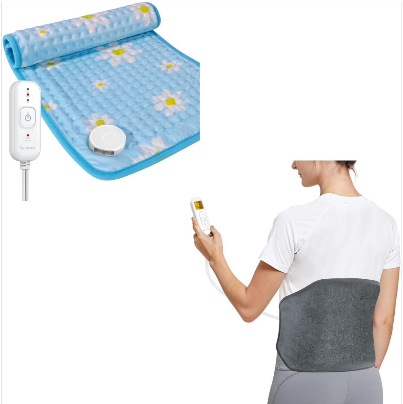
Image: The Comfytemp heating pad unrolled, showing the pad itself and the connected controller. This illustrates the main components of the product.