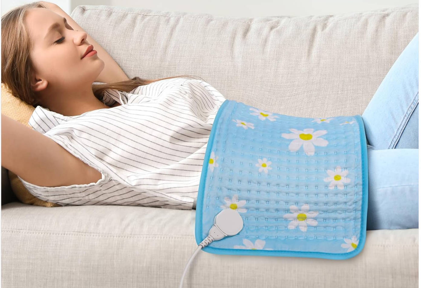
Image: A woman relaxing on a couch with the heating pad placed on her abdomen, demonstrating its use for menstrual discomfort relief.

Comfortable heat therapy to relieve menstrual discomfort