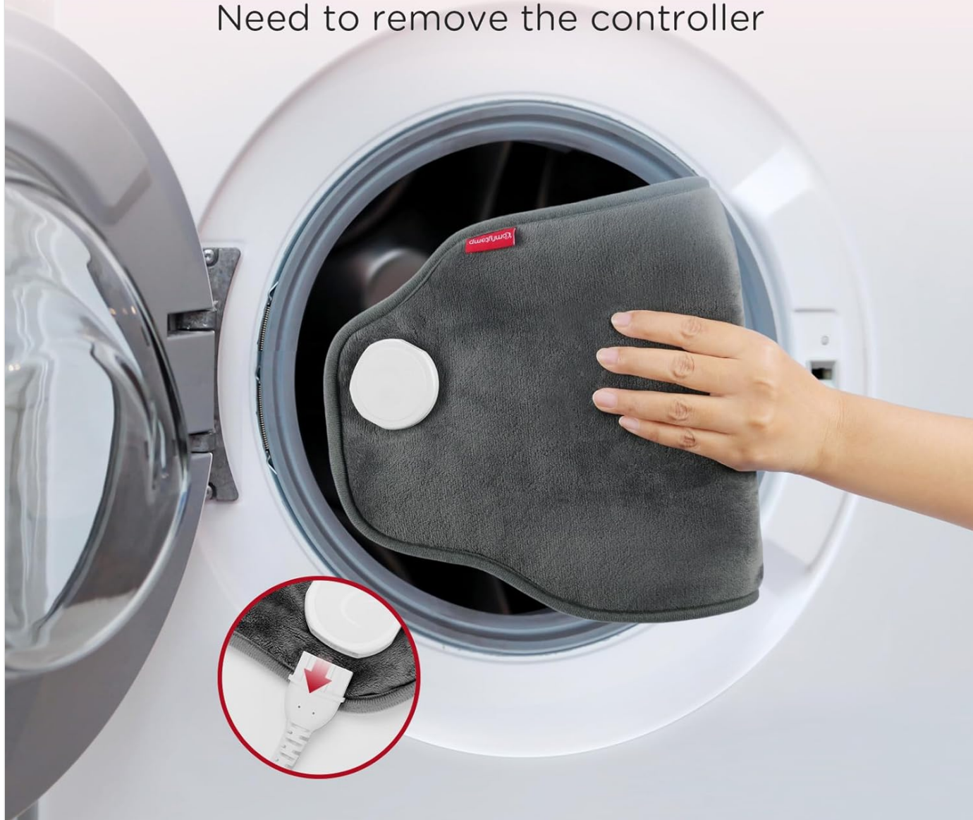
Image: A hand demonstrating the removal of the controller from the heating pad, emphasizing the crucial step before machine washing the pad.