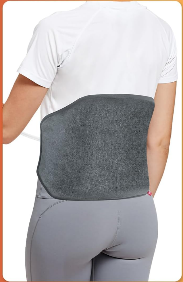
Image: A woman demonstrating how the adjustable waist band is used to secure the heating pad around the lower back, highlighting its wearable design.