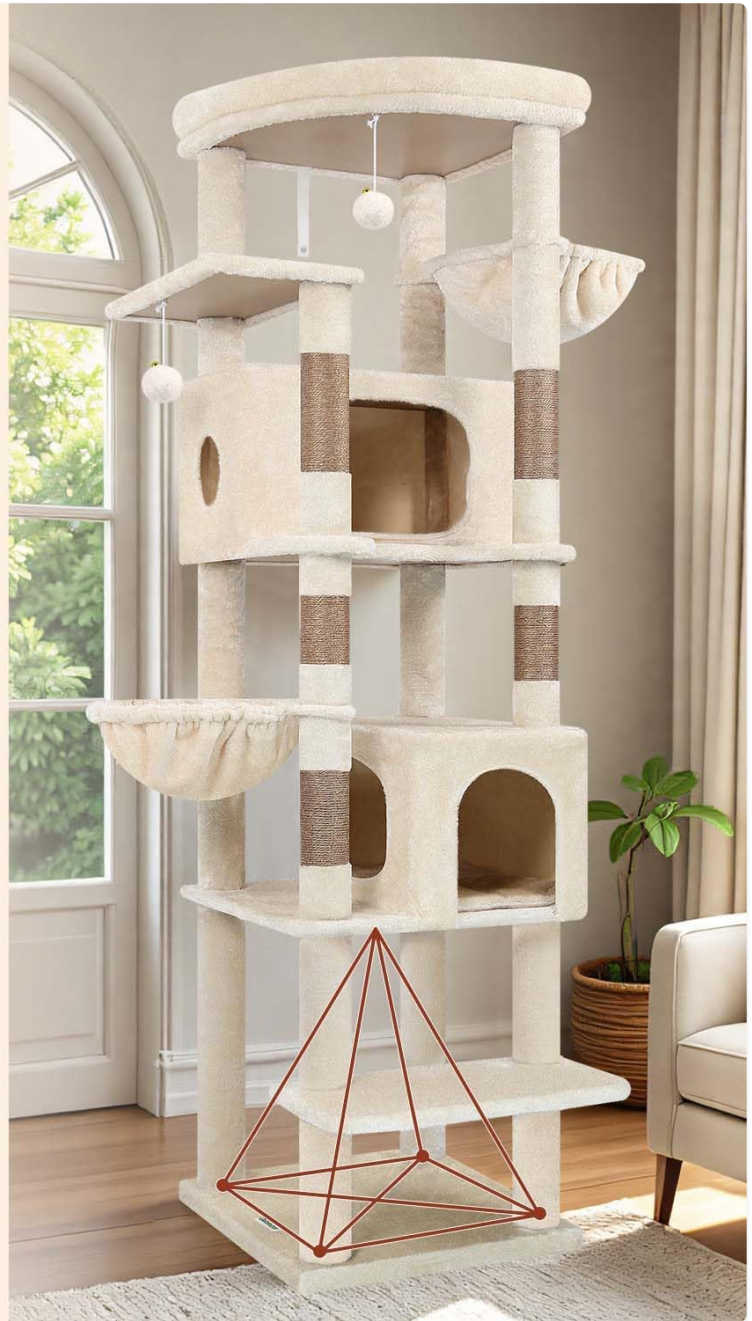
Figure 7: Illustration of the reinforced base and the anti-tip strap mechanism, emphasizing the importance of stability for cat safety.