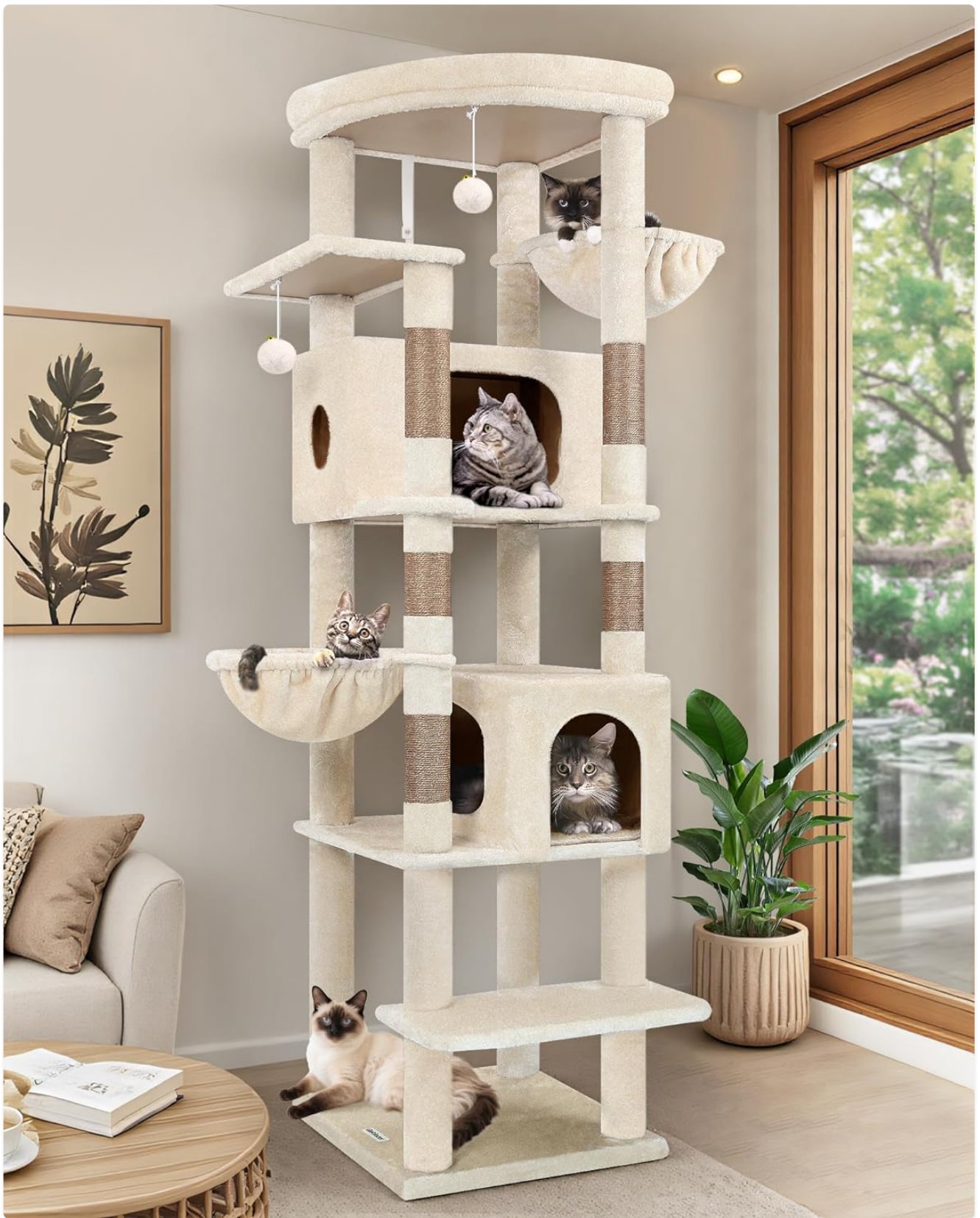
Figure 1: The Globlazer Extra Large Cat Tree Tower S74, a multi-level structure designed for large cats.