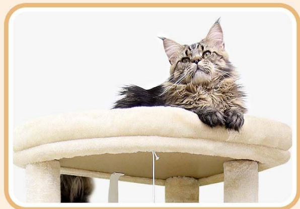
Figure 5: The enlarged top perch, providing a comfortable and secure elevated resting spot for cats.

Extra-large platform allows cats to stretch freely, cushioned edges for added safety and coziness.