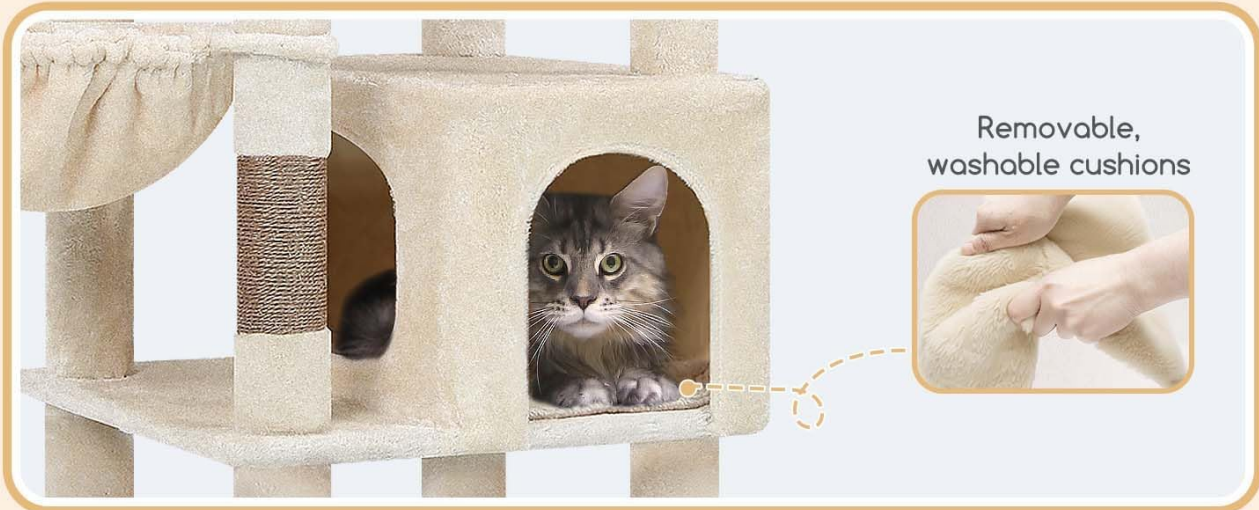
Figure 4: Close-up view of the two spacious cat condos, highlighting their wide openings and removable, washable cushions for comfort and ventilation.