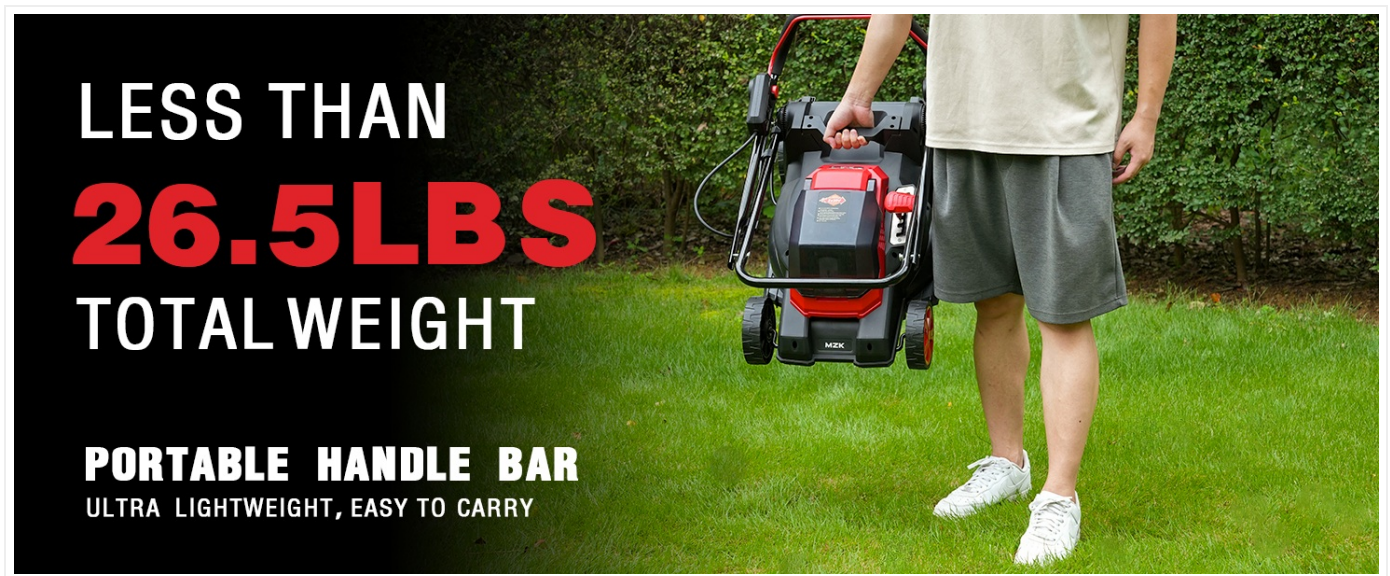
Figure 4: Easy start mechanism for the cordless mower.