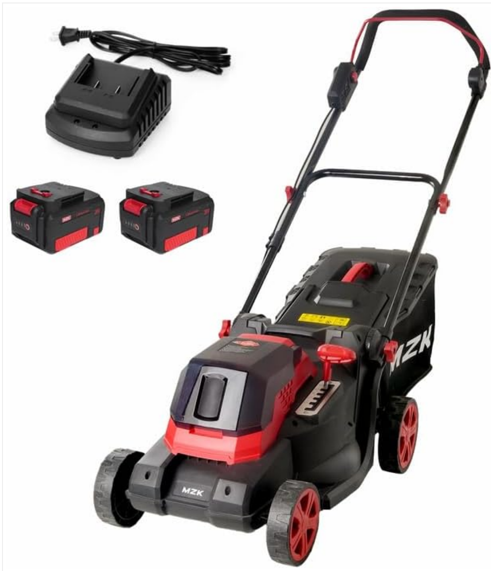
Figure 1: MZK 40V 16" Cordless Electric Push Lawn Mower with included batteries and charger.