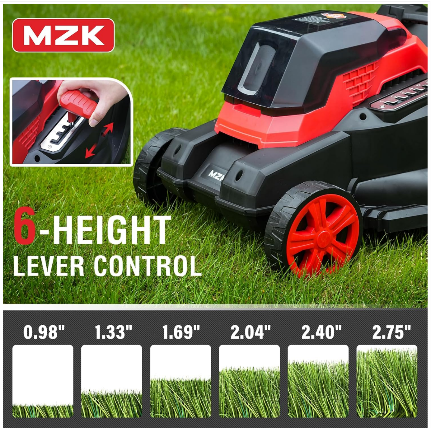
Figure 3: Adjusting the cutting height using the lever.