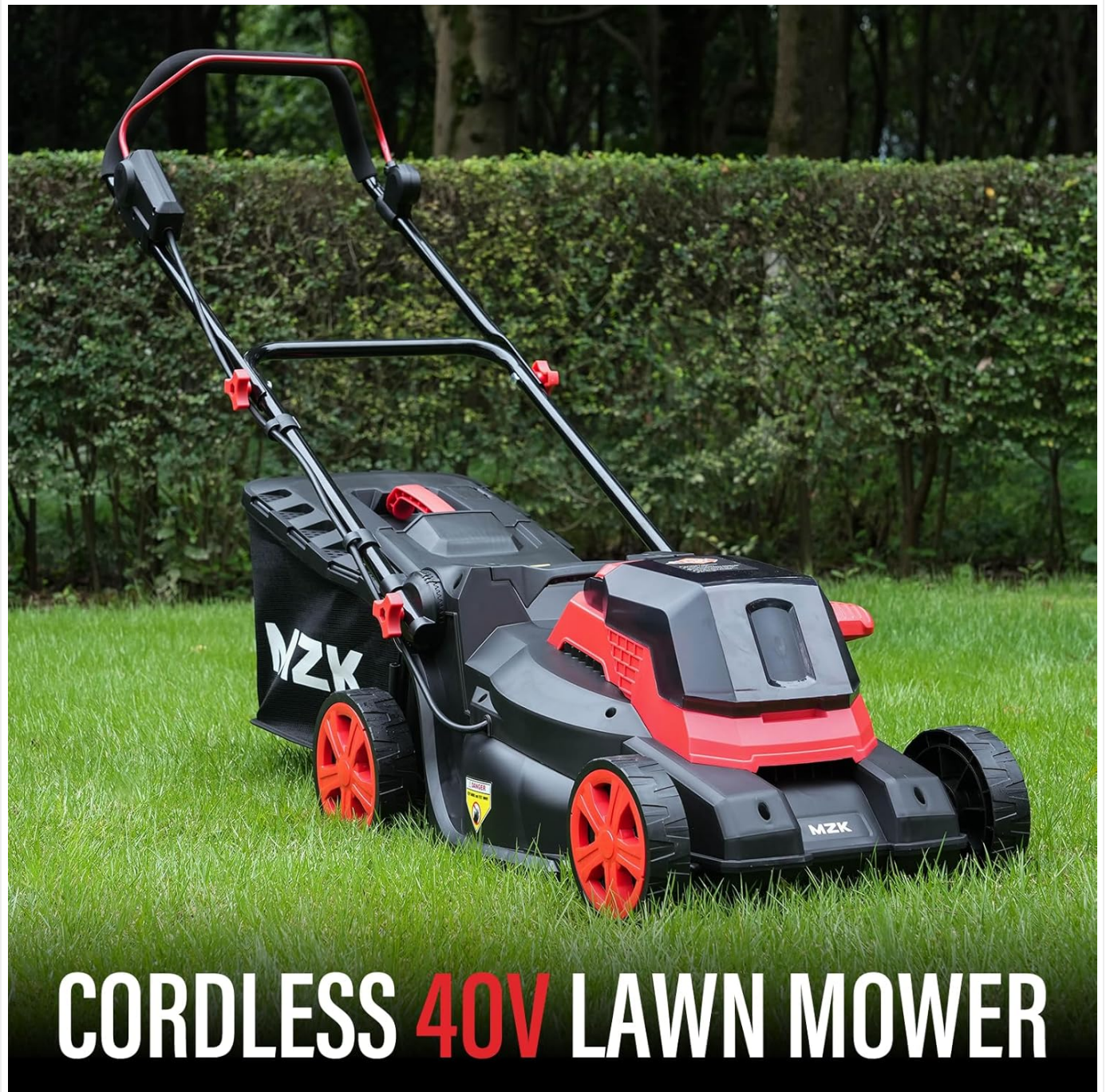
Figure 2: Overview of the MZK Cordless Lawn Mower.