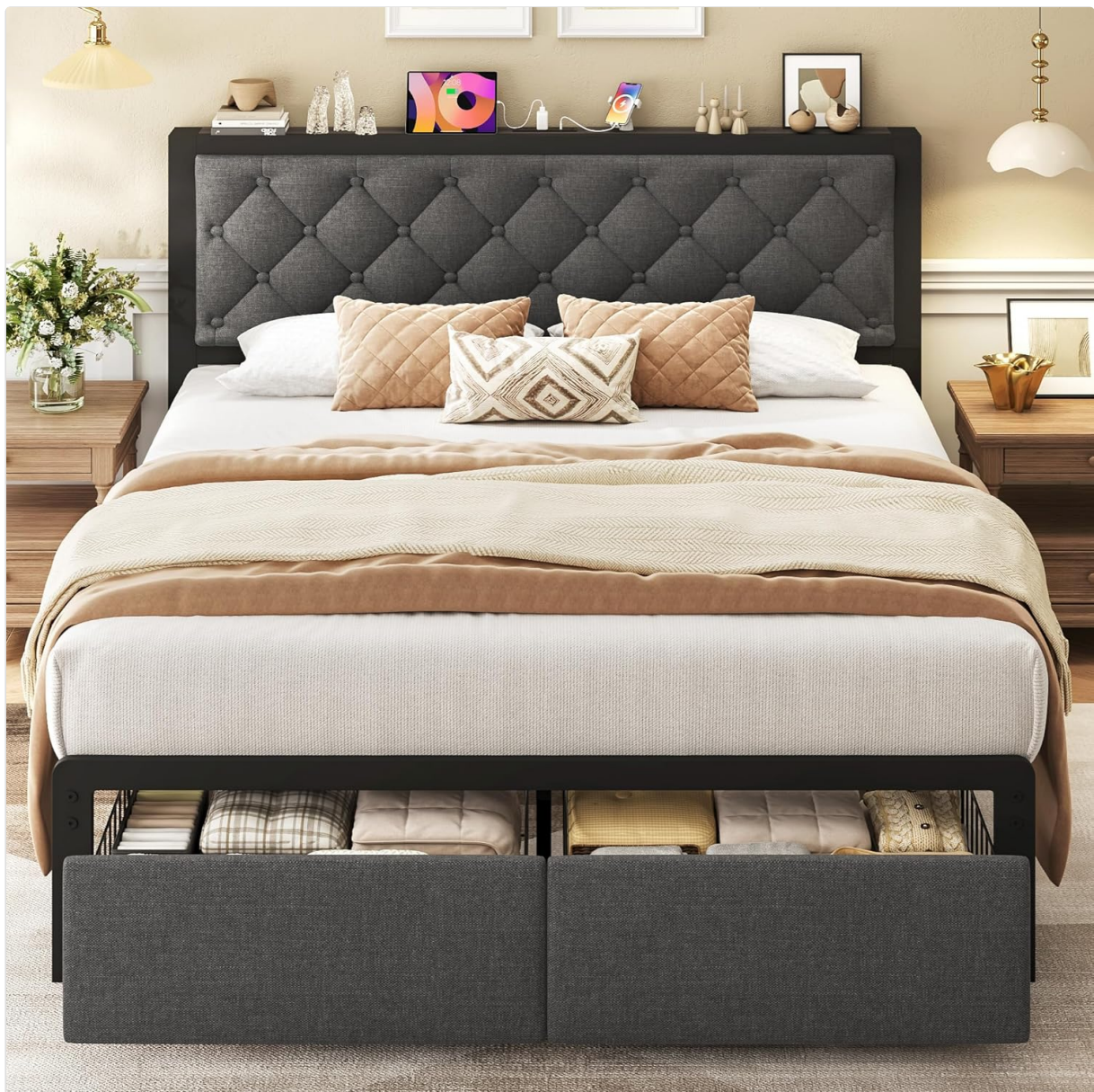
Figure 4.1: Bed frame with storage drawers open.