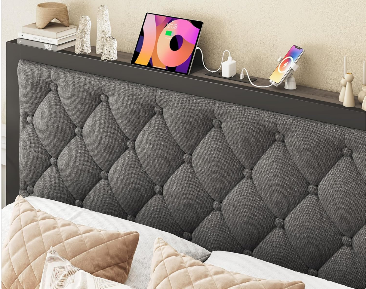
Figure 4.3: Headboard shelf with integrated charging station.