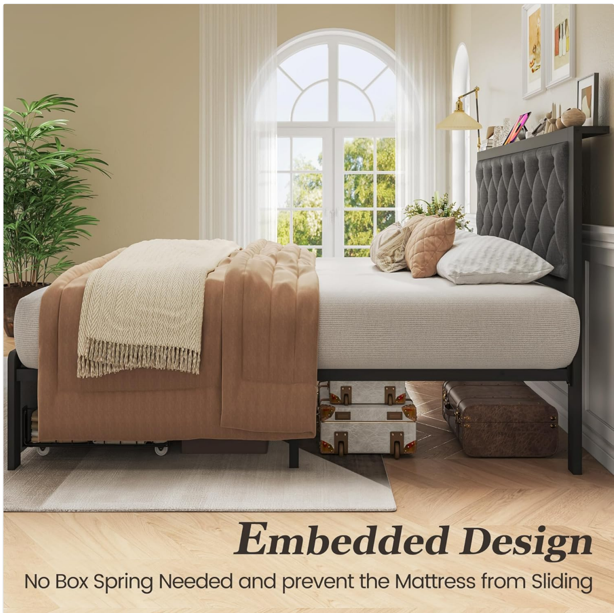
Figure 4.4: Under-bed storage space.