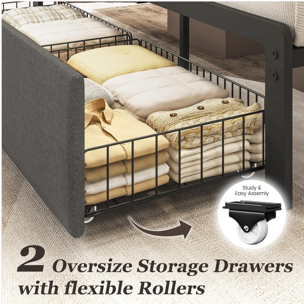
Figure 4.2: Detail of storage drawer with flexible rollers.