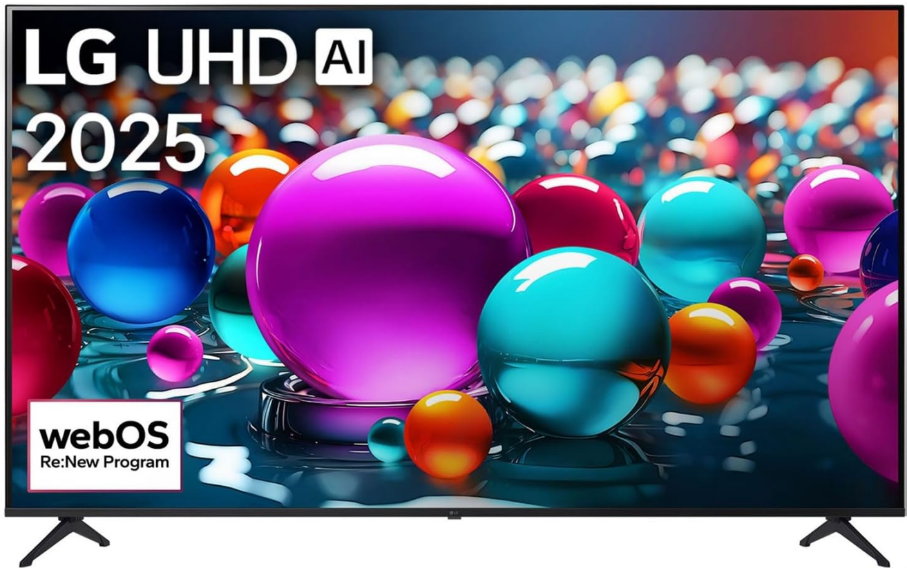
Front view of the LG 43 Inch UHD 4K Smart TV.