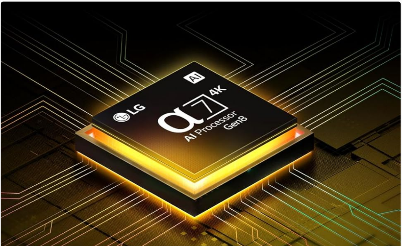
A visual representation of the LG α7 AI Processor Gen8, highlighting its role in enhancing 4K visuals.