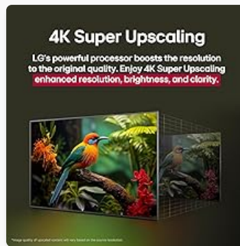
Image demonstrating the effect of 4K Super Upscaling, showing improved resolution, brightness, and clarity.