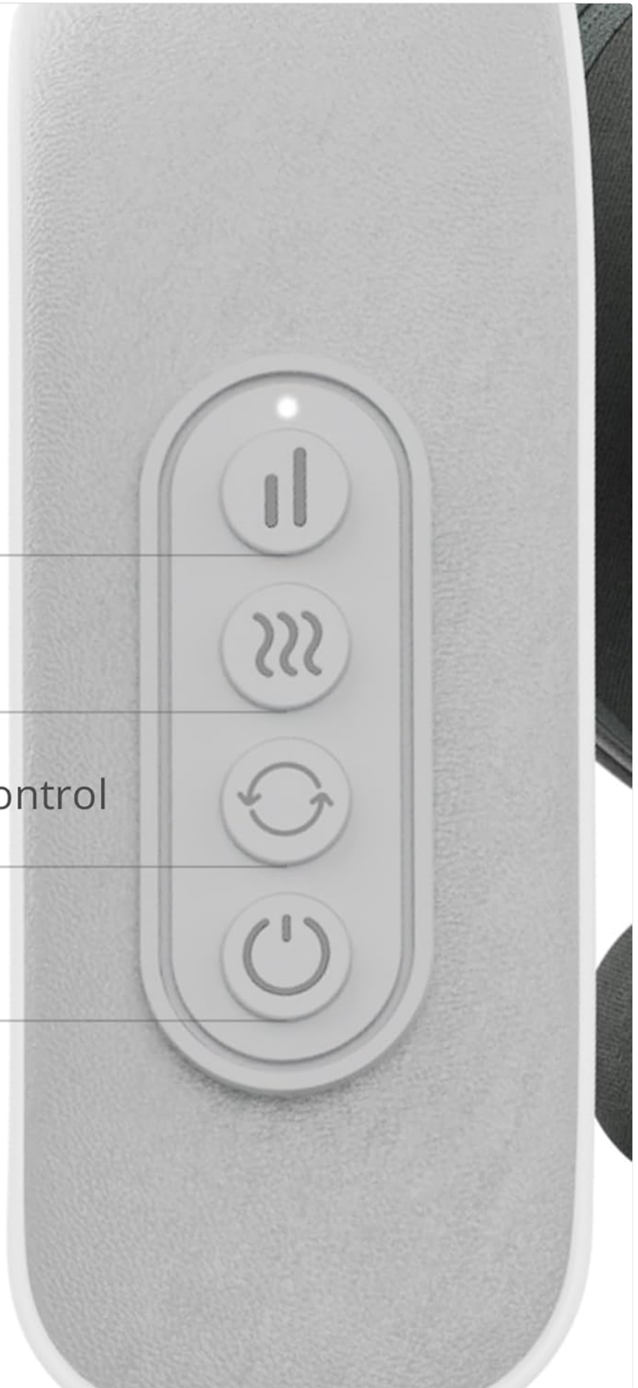
Image: A detailed view of the control panel on the ibreo massager, showing buttons for intensity, heating, massage mode, and power.