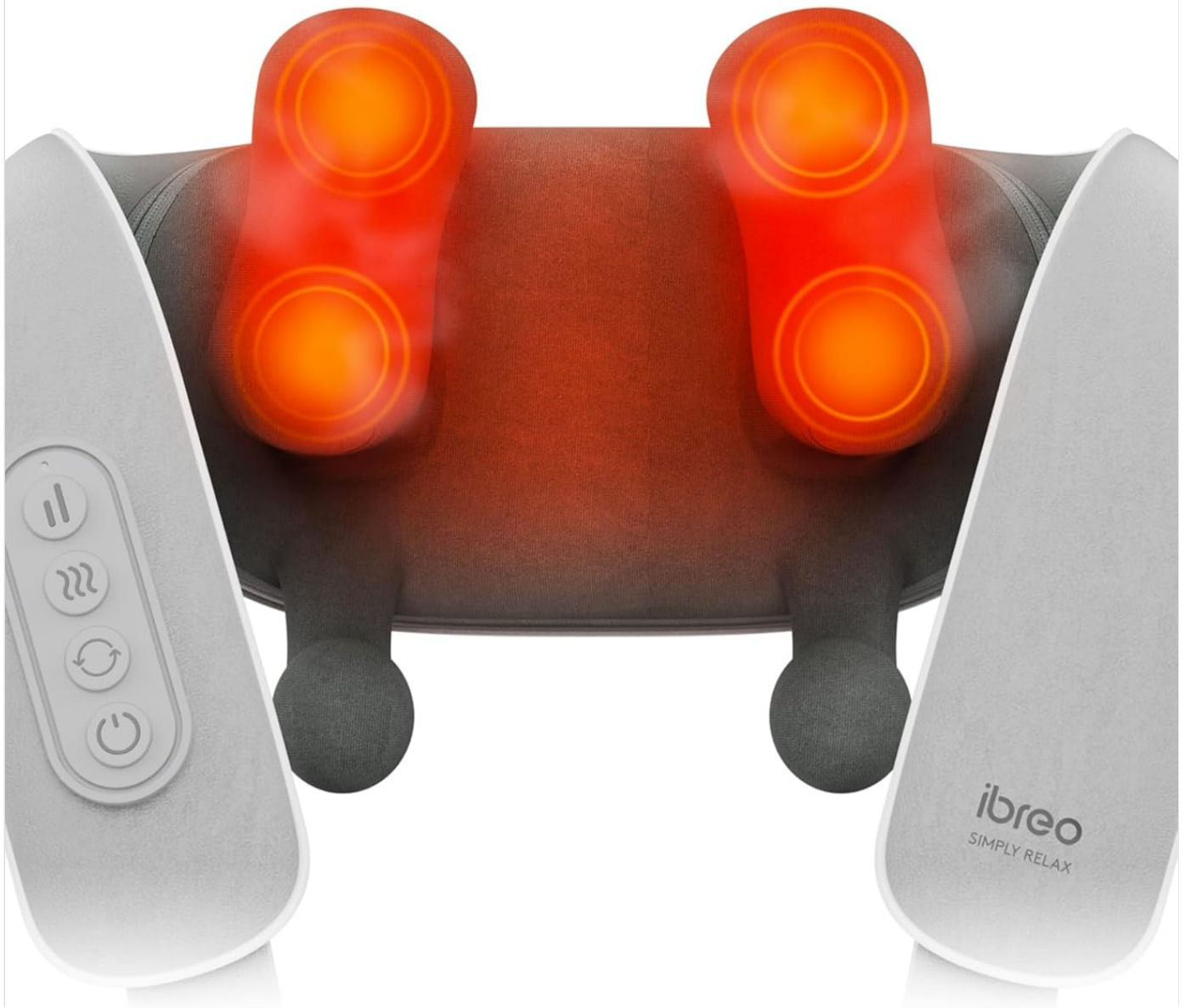
Image: A close-up view of the ibreo massager's heating elements, indicating low (104°F) and high (113°F) temperature settings.