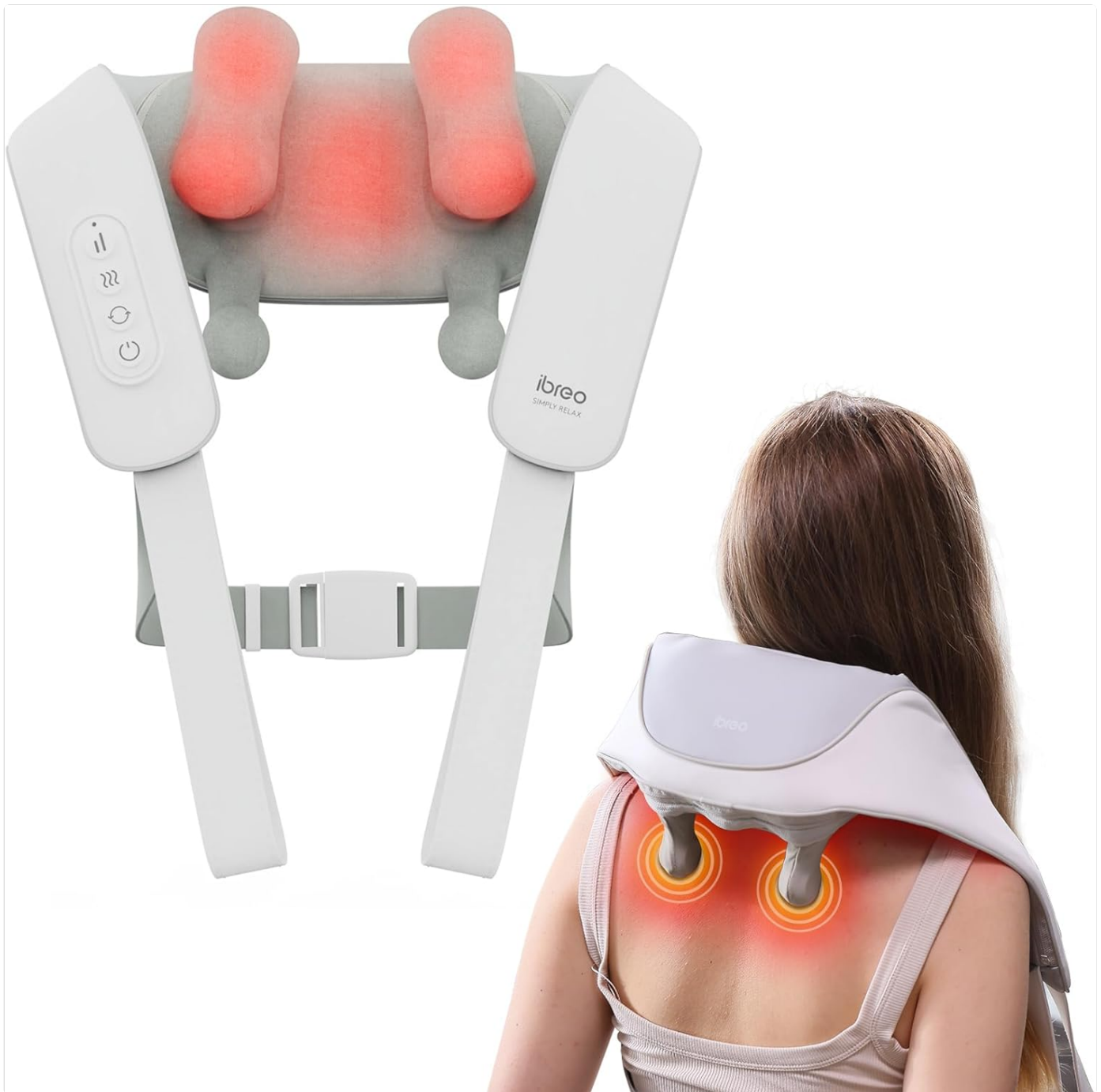
Image: The ibreo Cordless Shiatsu Neck and Back Massager shown both as a standalone product and being worn by a user for neck and shoulder massage.