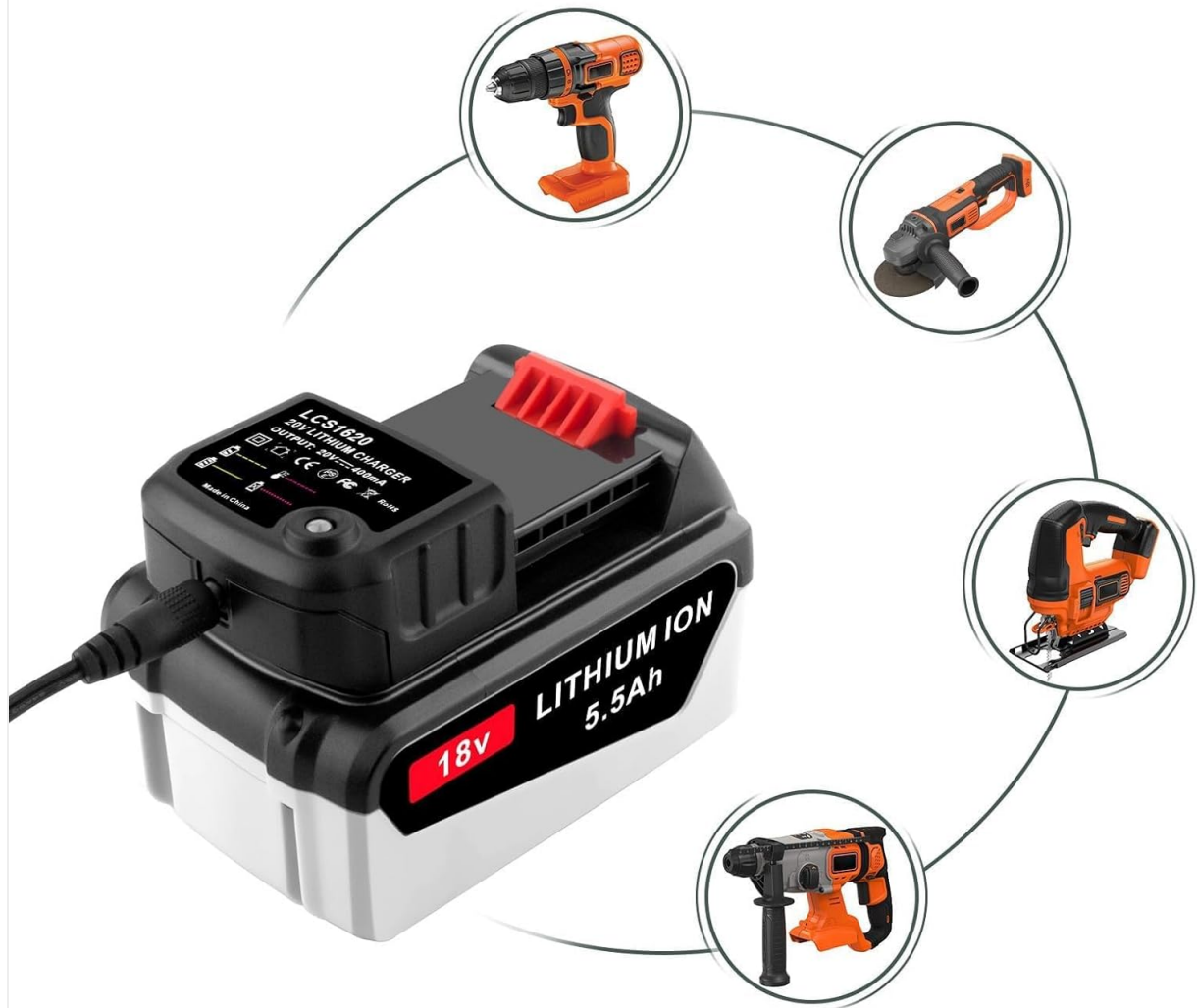
Image 3.3: An illustration demonstrating the wide compatibility of the battery with various Black & Decker 18V and 20V cordless power tools, including drills, grinders, jigsaws, and impact drivers.

Fit for All B & D 18V/20V Tools GKC1825L20-QW, GPC1820L20-QW, STC1820-QW, BCD900B-XJ, BL188KB-QW, LDX120SB, LDX220SB, LDX220SBFC, LGC120, LHT2220, etc.