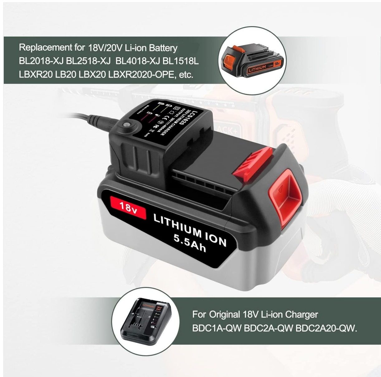
Image 3.1: The 18V 5.5Ah Lithium Ion battery connected to a compatible charger, demonstrating the charging process.