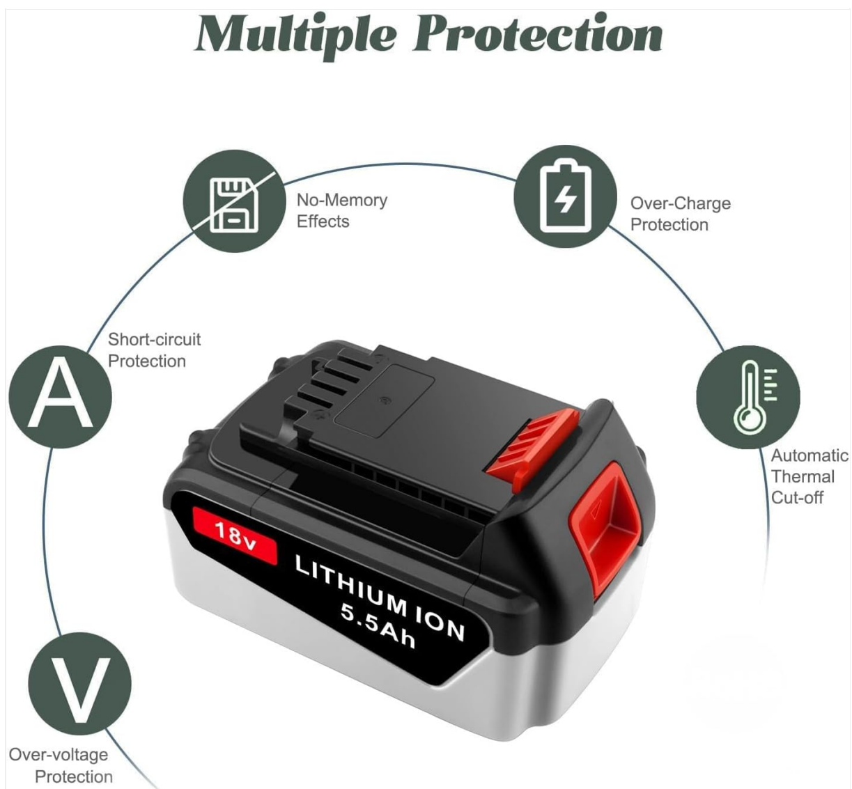
Image 2.1: Diagram illustrating the multiple protection features of the battery, including no-memory effects, over-charge protection, short-circuit protection, automatic thermal cut-off, and over-voltage protection.