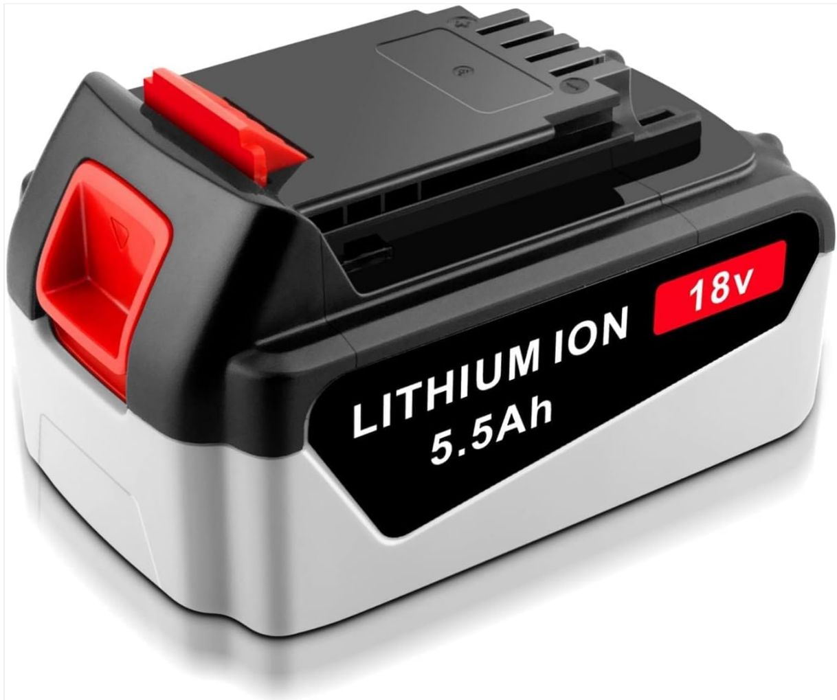
Image 1.1: The Generic 18V 5500mAh Li-ion Battery, featuring a black and grey casing with red accents, clearly labeled "LITHIUM ION 5.5Ah 18v".

This manual provides essential information for the safe and effective use of your Generic 18V 5500mAh Li-ion Battery. This high-capacity battery is designed to be compatible with a wide range of Black & Decker 18V and 20V cordless power tools, offering reliable and consistent power output.