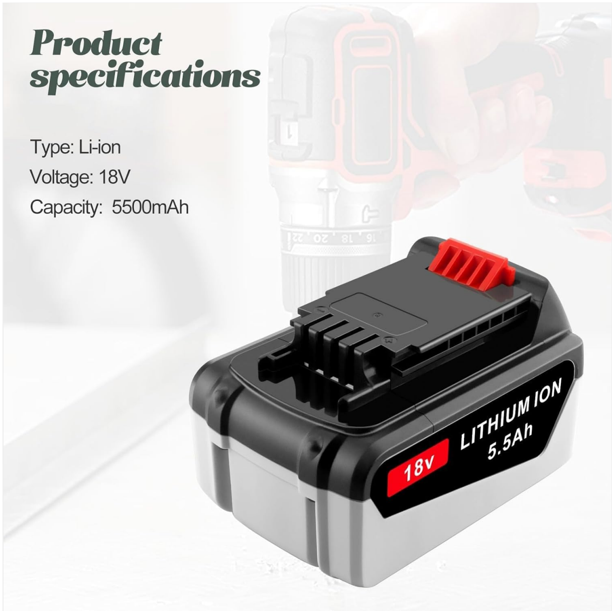
Image 7.1: Visual representation of the battery's key specifications: Type, Voltage, and Capacity.