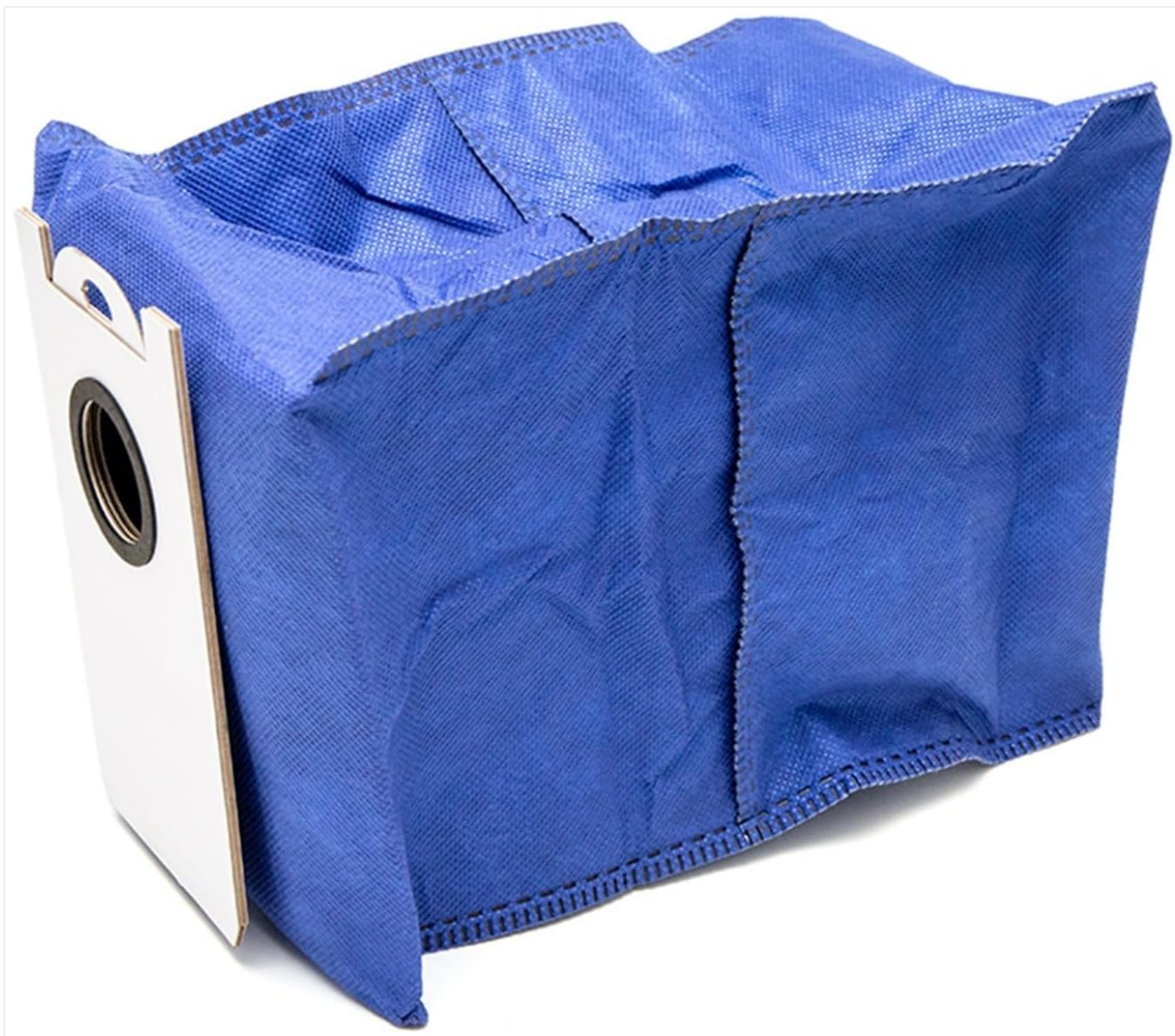
Image: Side view of a UCVJXDEM dust bag, showing the stitched seams and the durable fabric material.