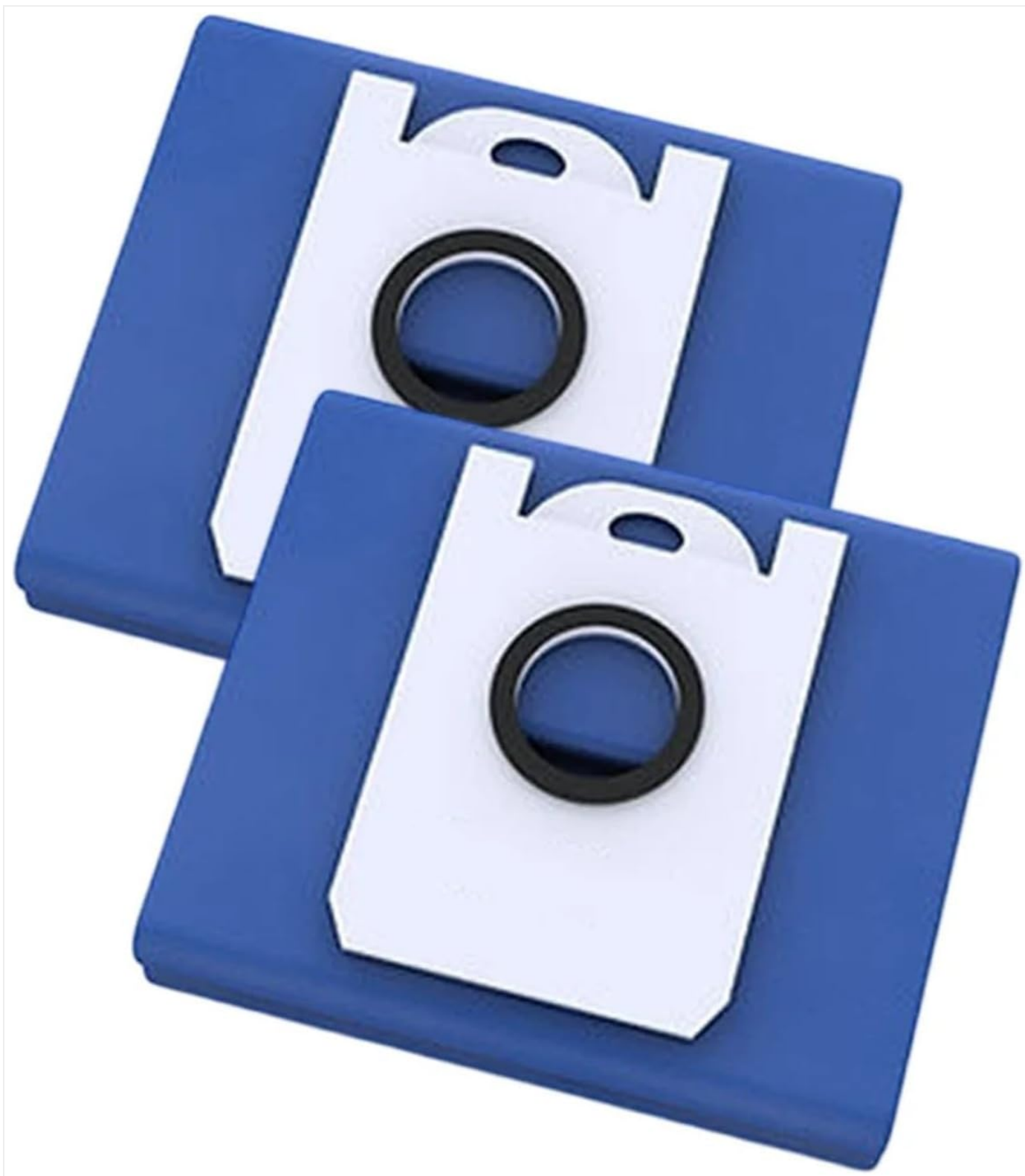
Image: Two UCVJXDEM replacement dust bags, showing their blue fabric and white cardboard collar with a black rubber seal.