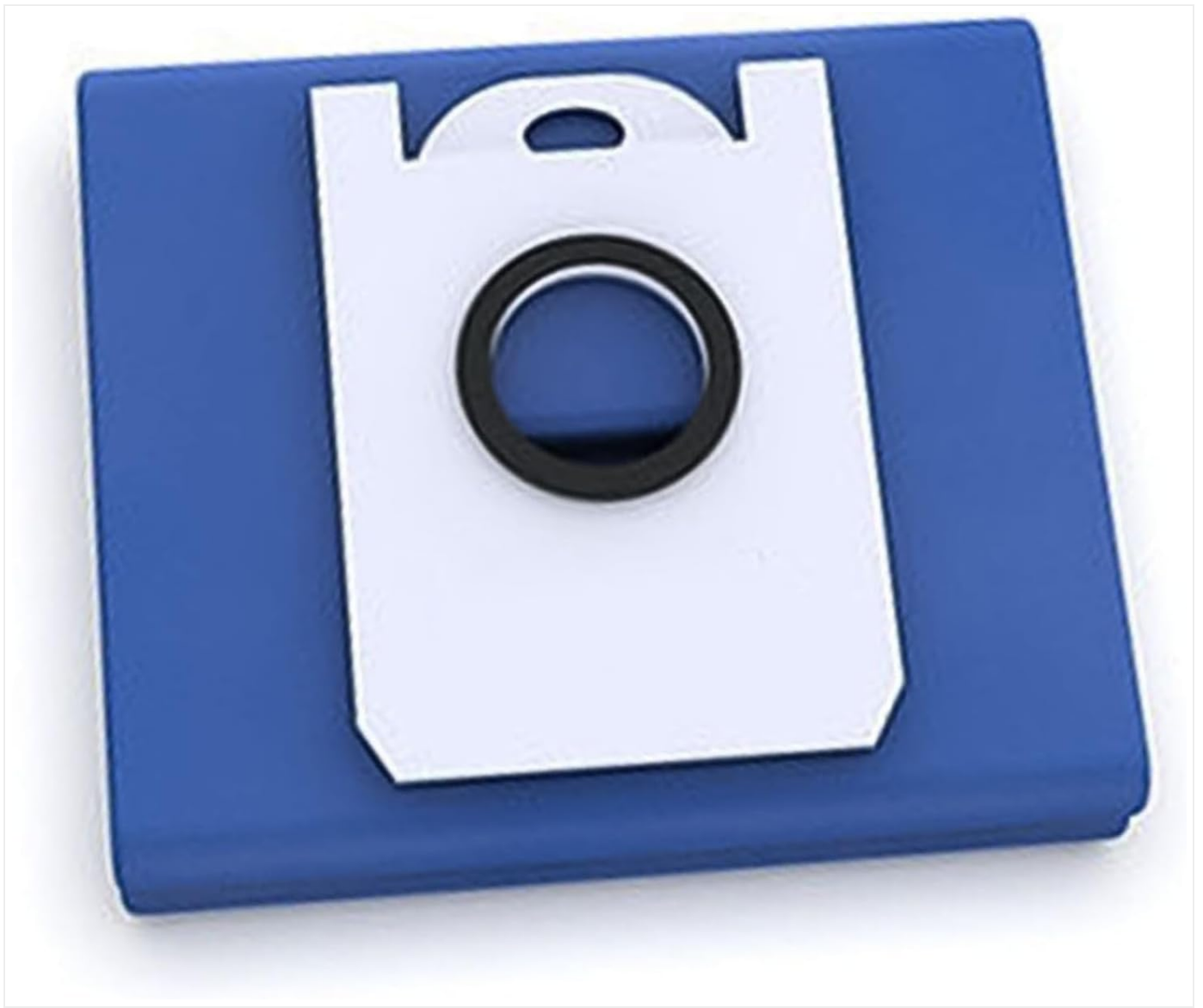
Image: A single UCVJXDEM replacement dust bag, highlighting its compact, folded design and the circular opening for vacuum connection.