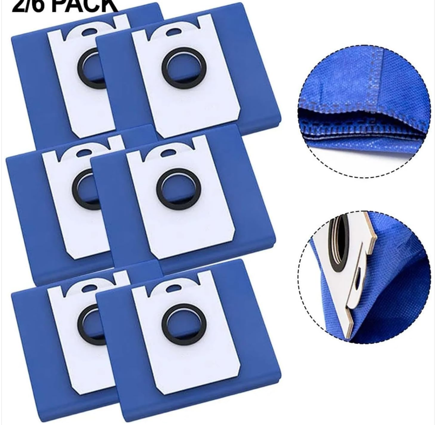
Image: Multiple UCVJXDEM dust bags arranged to show the available 2-pack and 6-pack options, with a close-up of the bag's material and sealing mechanism.