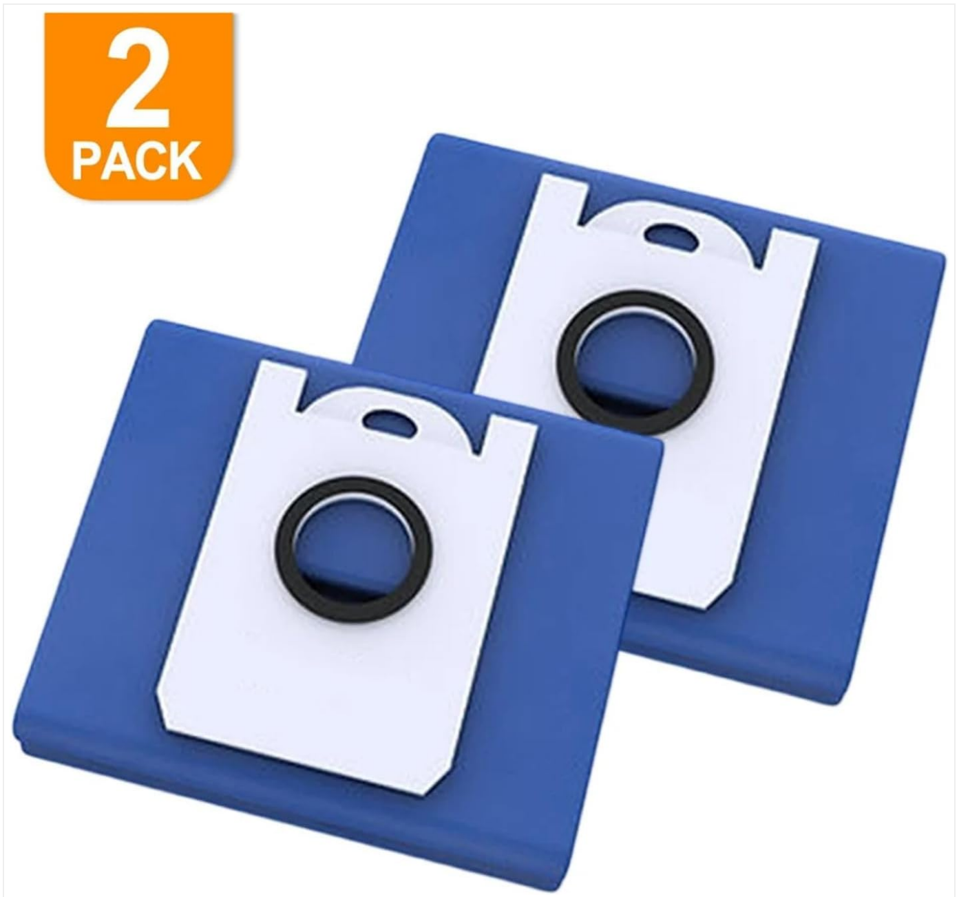
Image: Two UCVJXDEM dust bags, clearly labeled as a "2 PACK", illustrating the product quantity.