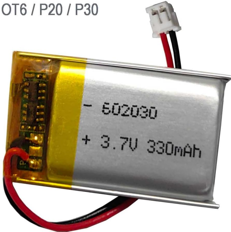
Image 1.1: Front view of the AOLIKES 602030 330mAh rechargeable battery, showing the model number, voltage, capacity, and attached red and black wires with a white connector.

The battery replacement for Bousnic Dog Training Collar Remote Models for RS2 / RS8 / VS2 / RS1 / OT2 / OT3 / OT6 / P20 / P30