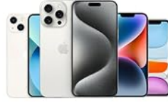
iPhone 12/13/14/15/16 Series