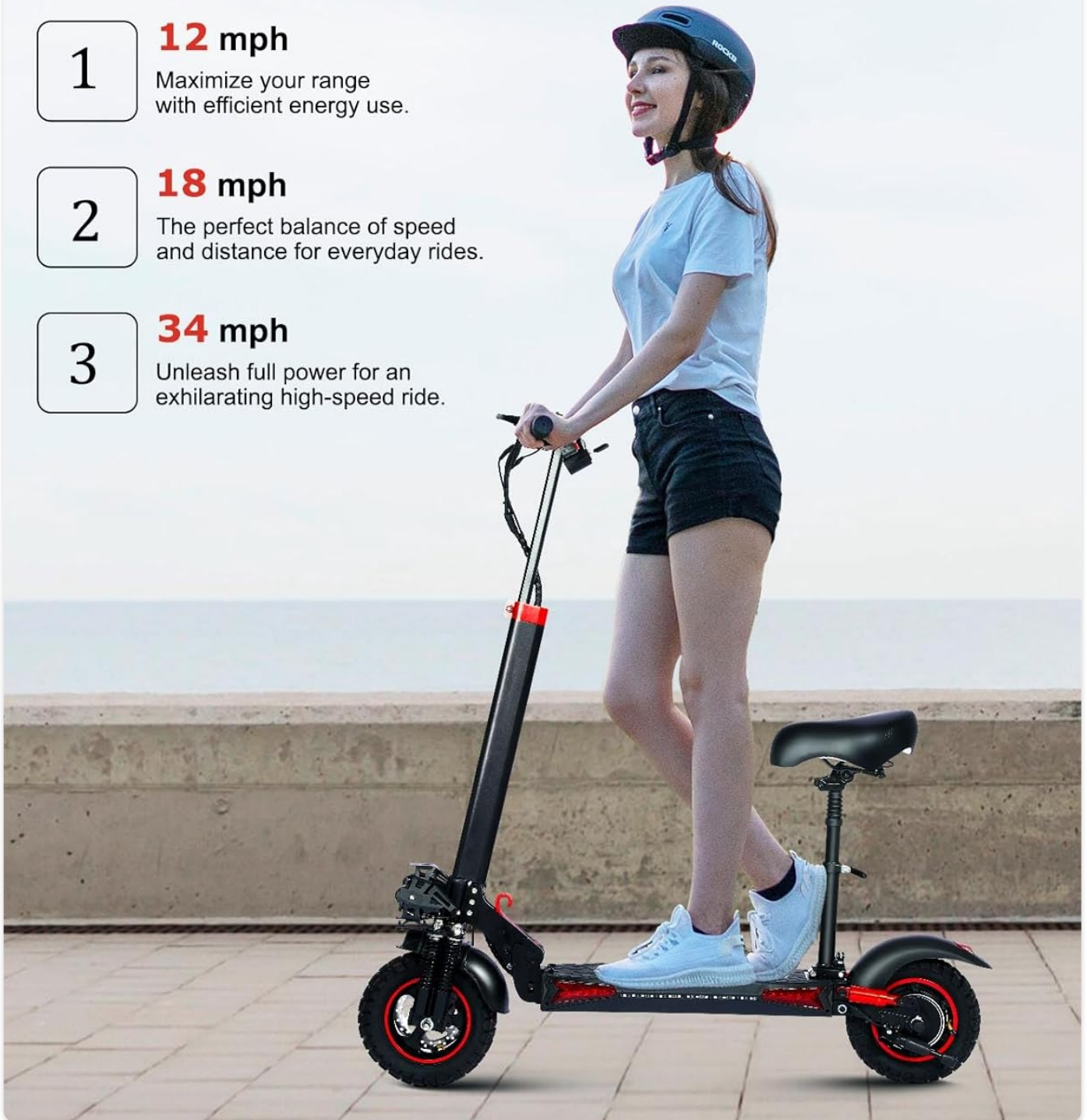
Figure 8.1: The 11-inch off-road tires and full suspension system provide a smooth ride over various terrains.

Unleash full power for an exhilarating high-speed ride.