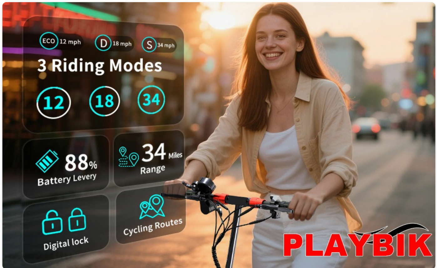
Figure 4.1: The scooter is equipped with a high-capacity 48V 18Ah lithium battery, offering a range of 28-38 miles and featuring a smart BMS for safety and longevity.