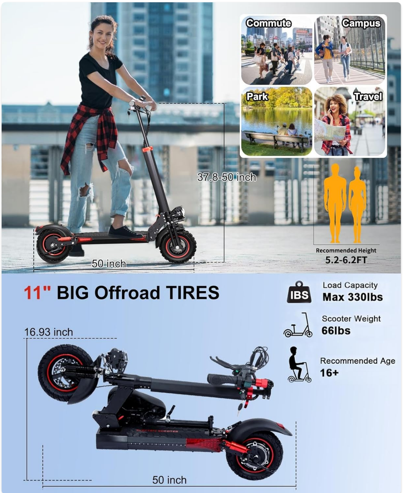
Figure 7.2: Detailed dimensions and specifications for the PLAYBIK J11MAX, highlighting its compact folded size and robust load capacity.