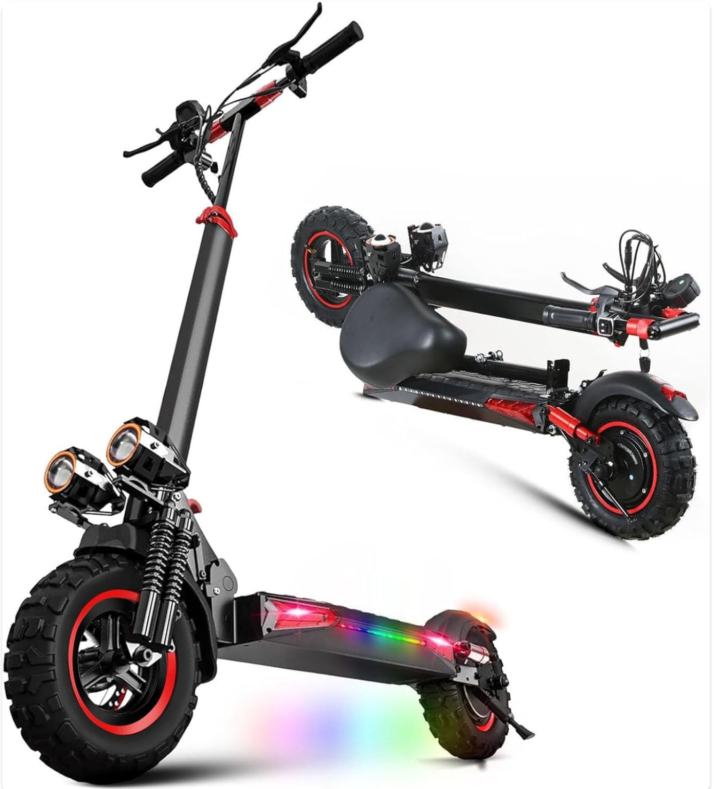
Figure 3.1: The PLAYBIK J11MAX Electric Scooter, showcasing its assembled and folded configurations for easy transport and storage.