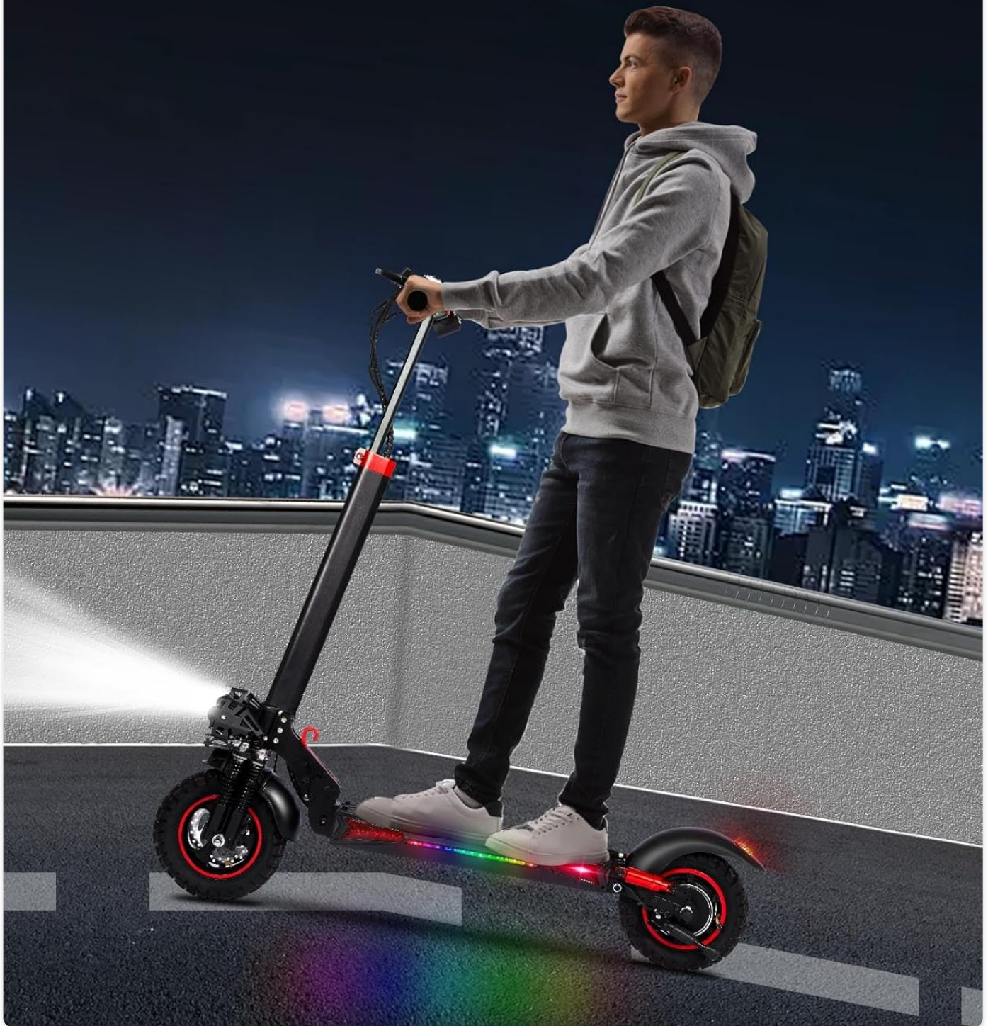
Figure 6.2: The comprehensive lighting system ensures visibility and safety during nighttime rides.