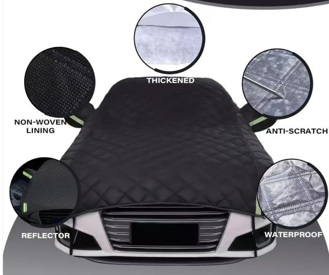
Image: Exploded view diagram illustrating the various protective layers and features of the car cover.