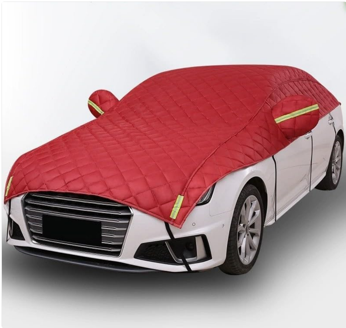
Image: Side view of the car cover installed, showing the mirror pockets and overall fit.