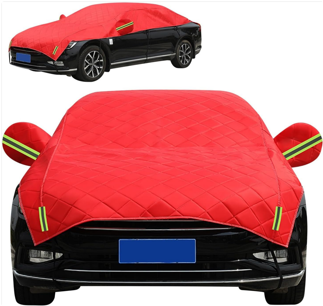
Image: The Car Hail Protector cover installed on a vehicle, showcasing its fit and design.