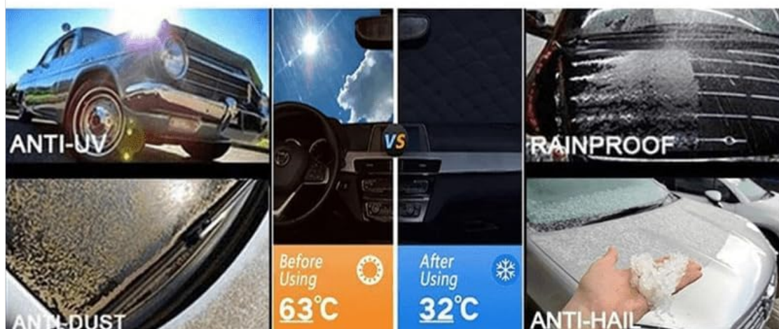
Image: Illustrates the multi-faceted protection offered by the car cover against various environmental elements.

Help you no longer have to wake up early to wash your car