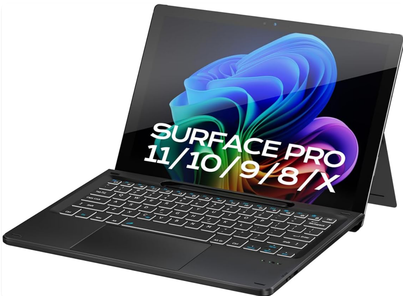
Image: The Doohoeek Surface Pro Keyboard seamlessly attached to a Surface Pro tablet, showcasing its sleek design and perfect fit.

Thank you for choosing the Doohoeek Surface Pro 11/10/9/8/X 13 Inch Bluetooth Keyboard. This ultra-slim keyboard is designed to enhance your productivity and user experience with its integrated touchpad, pen slot, and lighting keys. It offers seamless compatibility with Surface Pro 11, 10, 9, 8, and X models, and is optimized for Windows 11 gestures. Please read this manual carefully to ensure proper setup and operation of your new keyboard.