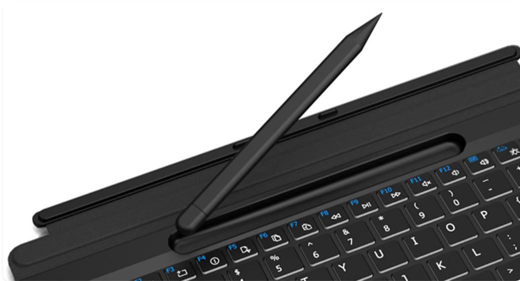
Image: A close-up view of the integrated pen slot located on the keyboard, designed for secure and convenient storage of a stylus.

The keyboard includes an integrated slot for conveniently storing your Surface Pen or compatible stylus. This keeps your pen secure and easily accessible.