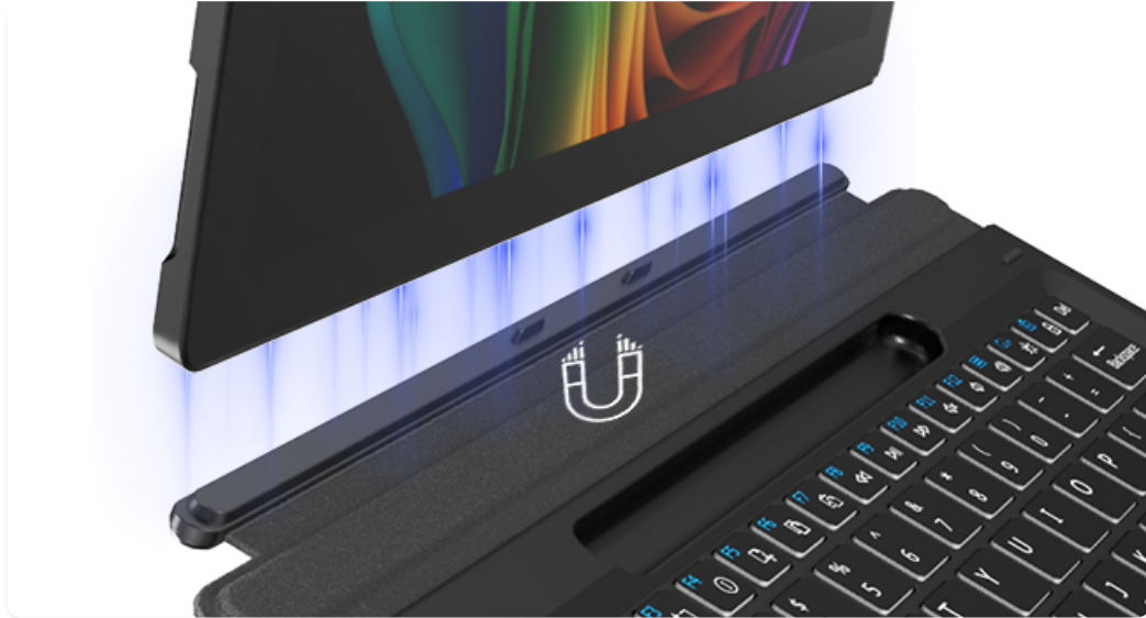
Image: A detailed view illustrating the strong magnetic connection between the keyboard and the Surface Pro tablet, ensuring a stable and secure attachment.

The keyboard features smart magnetic alignment for easy attachment to your Surface Pro. Simply align the top edge of the keyboard with the bottom edge of your Surface Pro until it snaps into place. This provides a secure connection for typing and protects your screen when closed.