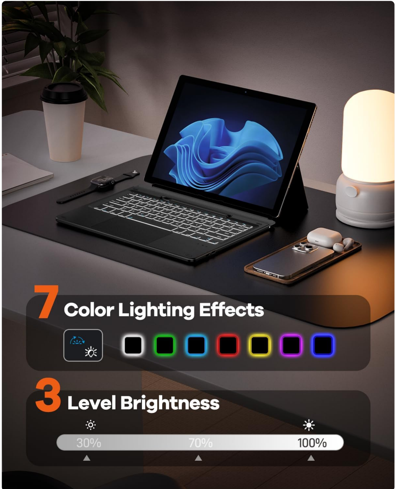
Image: The keyboard illuminated with various backlight colors, demonstrating the 7 color lighting effects and 3 levels of brightness for enhanced visibility in low-light conditions.