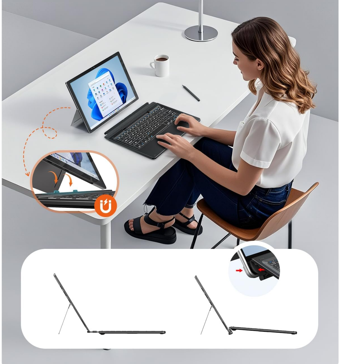
Image: A visual explanation of the keyboard's Ergo Lift design, demonstrating how it creates a comfortable typing angle when connected to the Surface Pro.