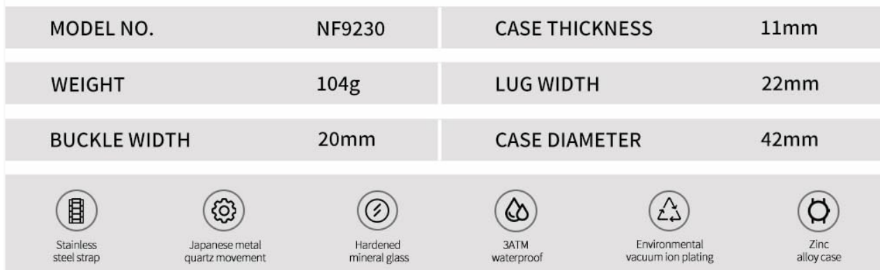
Image: Detailed diagram illustrating the dimensions and key features of the NAVIFORCE NF9230 watch.