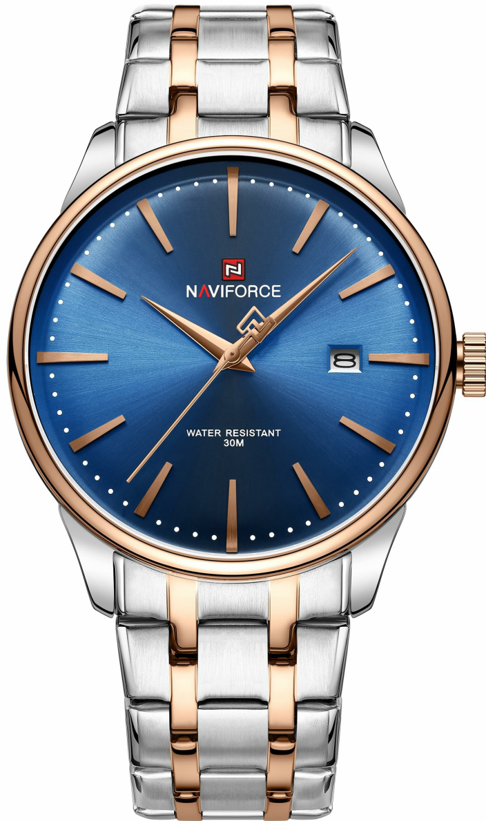
Image: The NAVIFORCE NF9230 watch featuring a blue dial, rose gold accents, and a two-tone stainless steel bracelet.