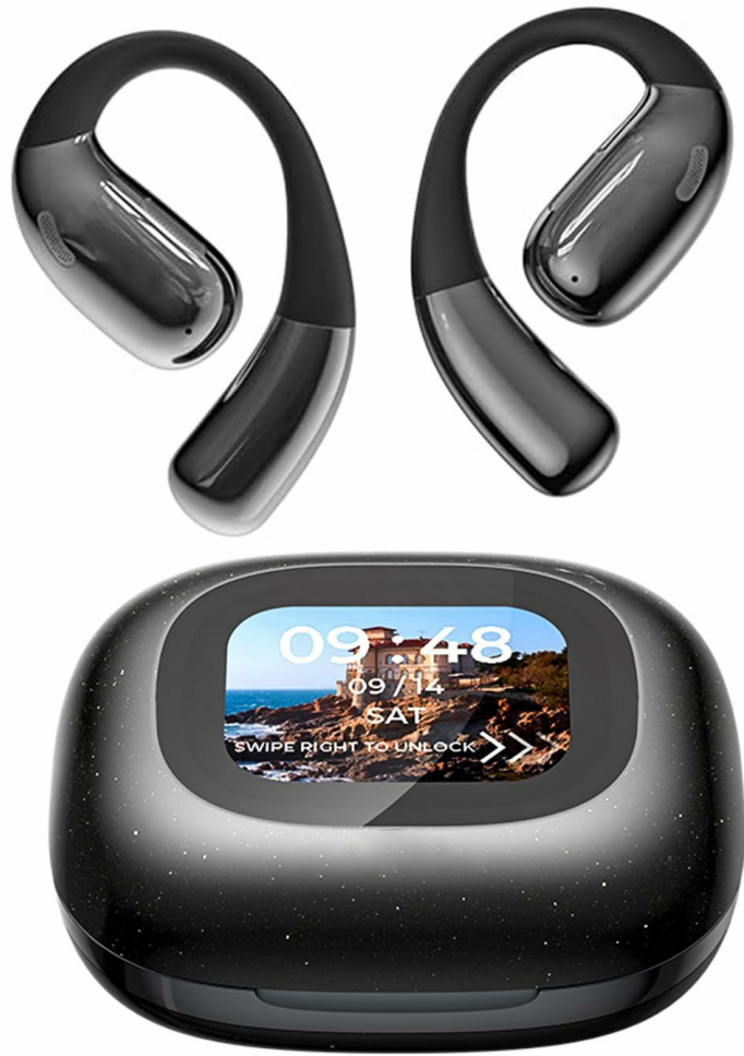
Figure 1: Doublepow AI Translation Earphones A39 and Charging Case.