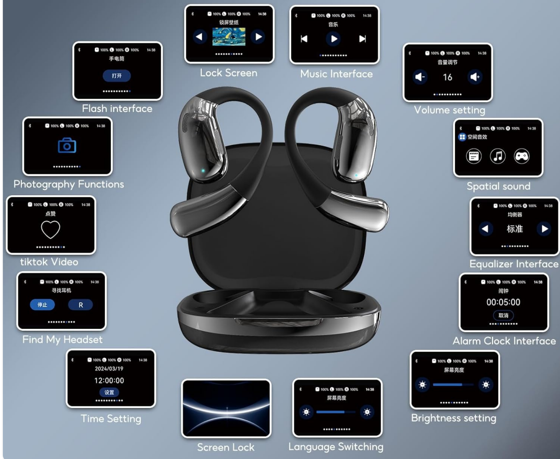
Figure 6: LED full-color touch screen with multiple practical functions.

LCD full-color touch screen, answering incoming calls, Music playback and many headphone features