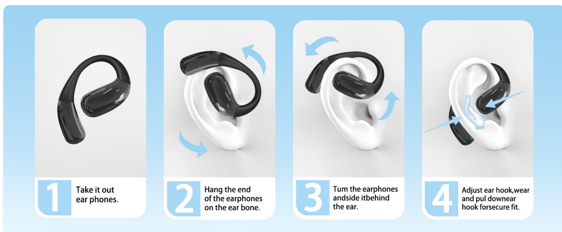
Figure 3: Proper wearing technique for the open-ear earphones.

The A39 earphones feature an ergonomic open-ear hook design for comfortable and secure fit. Place the earbud over your ear, ensuring the speaker is positioned correctly for optimal sound. This design reduces discomfort from prolonged wear and allows for environmental awareness.