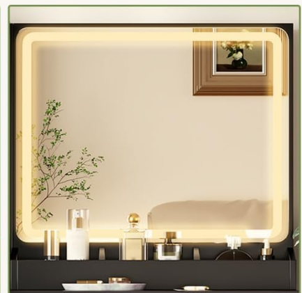
Warm yellow light