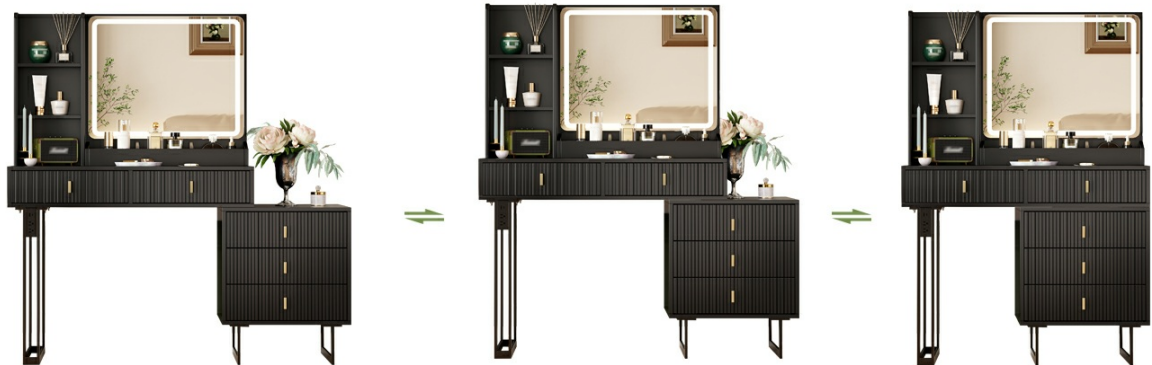
Figure 7: The smooth 3-section slide rails ensure quiet and full extension of drawers for convenient access.