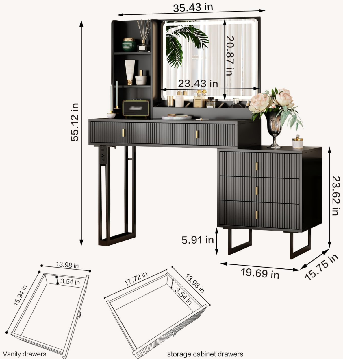
Figure 8: Comprehensive dimensions of the leejdn Large Vanity Desk and its components.