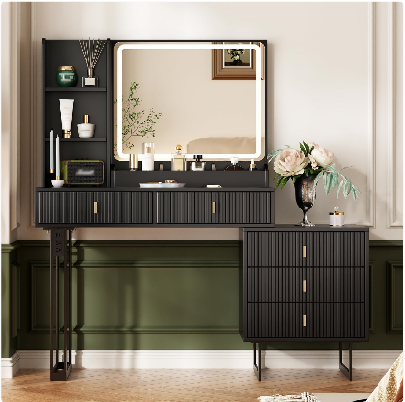
Figure 1: leejdn Large Vanity Desk, showcasing its sleek design and integrated features.