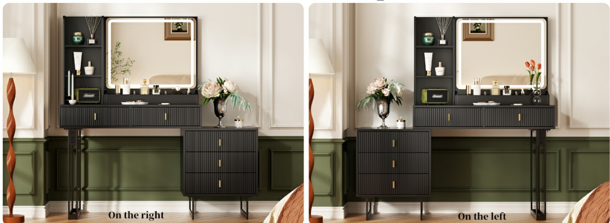
Figure 3: Visual representation of the two primary installation options: cabinet on the right or cabinet on the left.