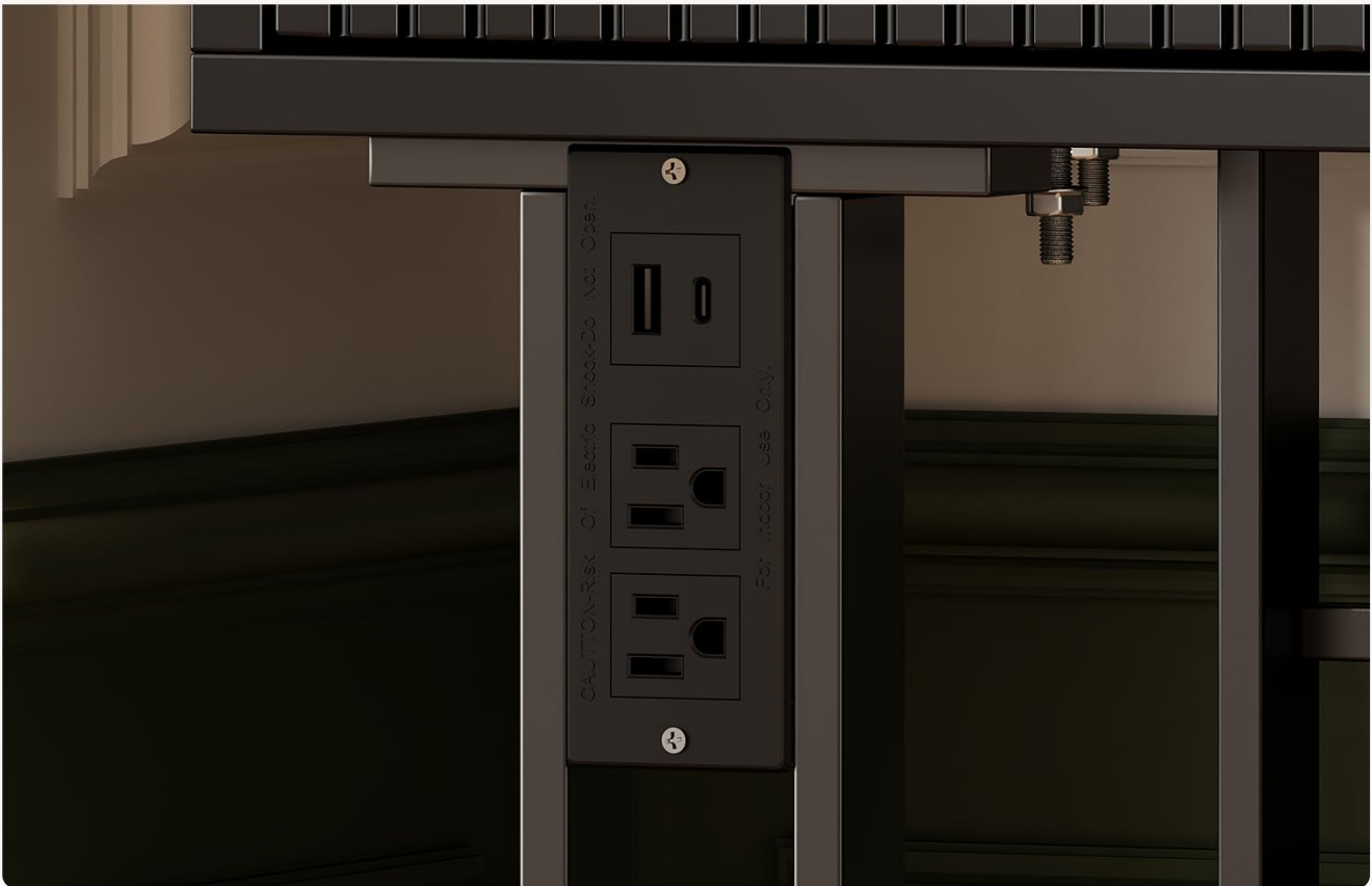
Figure 5: The integrated charging station provides convenient access to power for various devices.