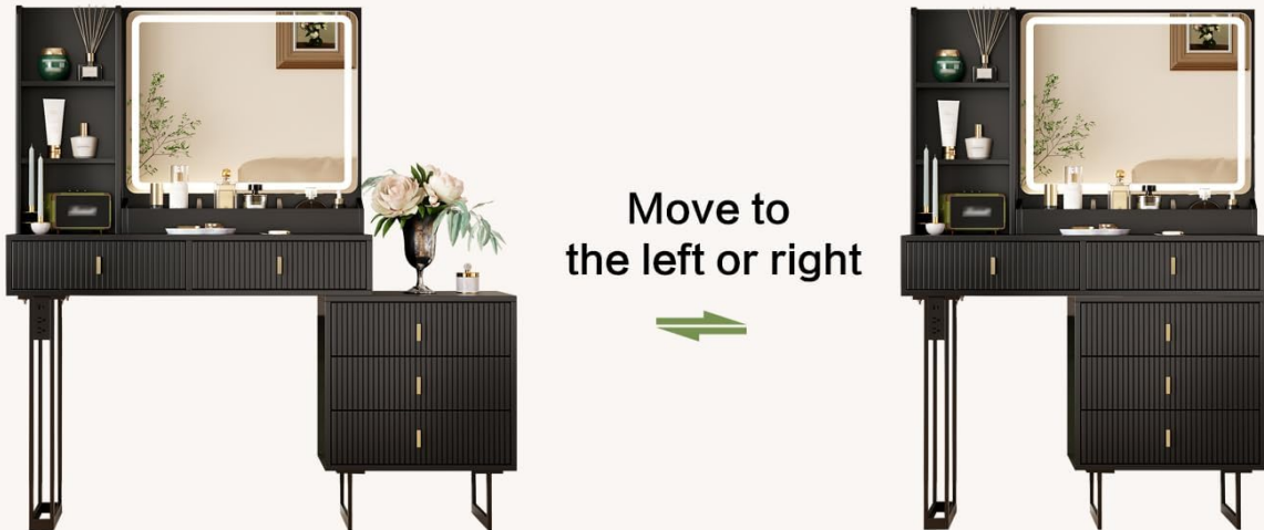
Figure 2: The vanity desk's modular design allows the three-drawer cabinet to be moved to the left or right, adapting to various room layouts.