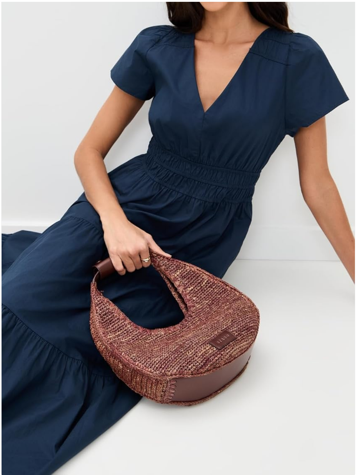
Figure 5: Detailed view of the dress's bodice, highlighting the V-neckline and the design of the puff sleeves.