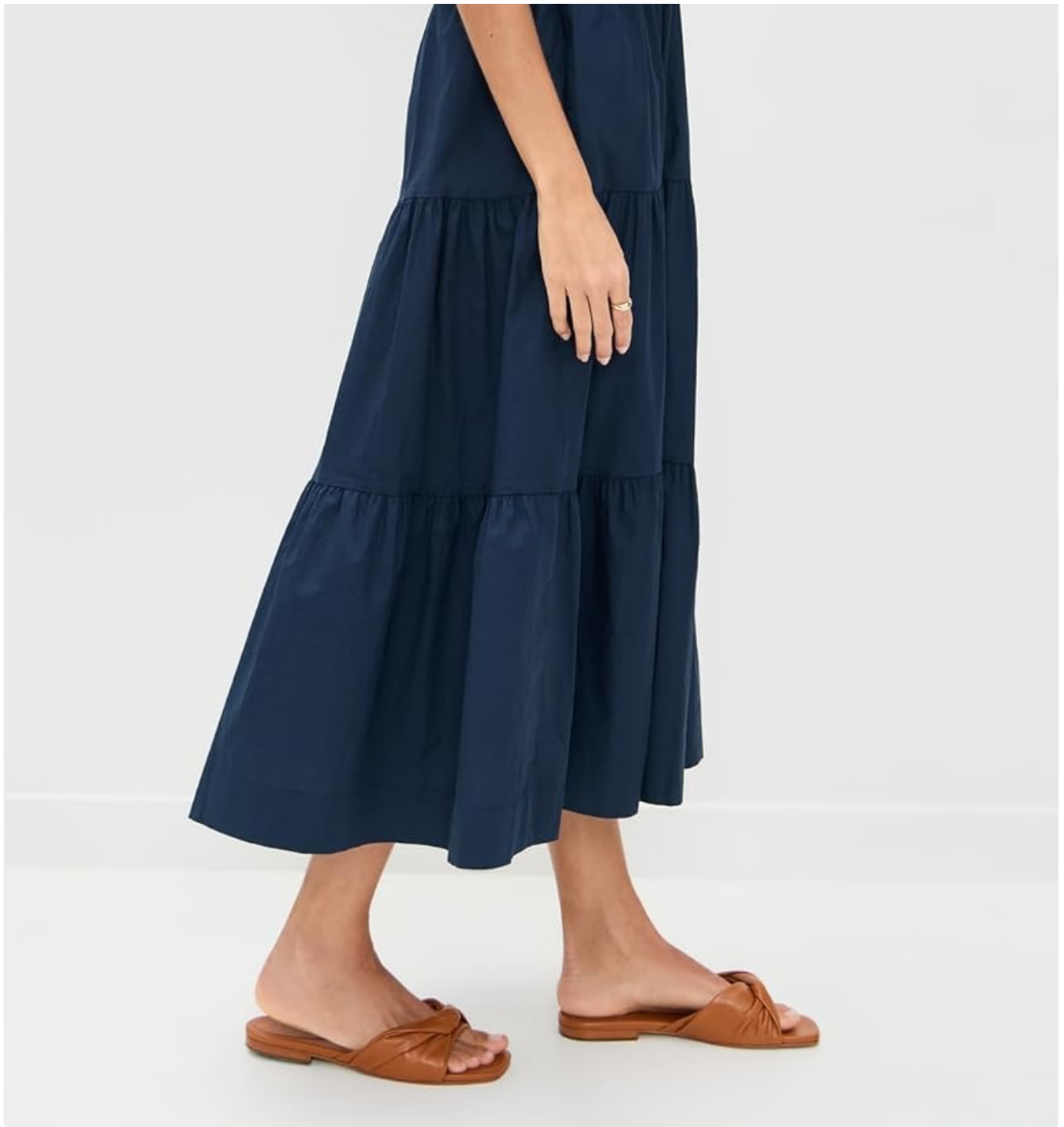
Figure 4: Side profile view of the dress, illustrating the flow of the tiered skirt and the puff sleeves.