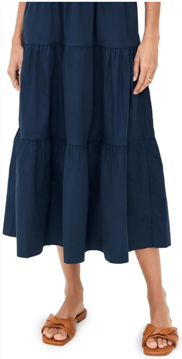
Figure 1: Front view of the Marea Annabelle Dress in navy blue, showcasing the V-neckline, puff sleeves, shirred elastic waist, and tiered skirt.