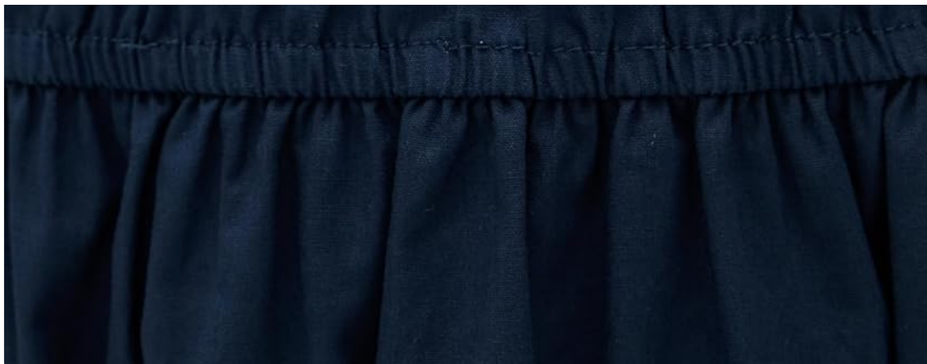
Figure 6: Close-up detail of the shirred elastic waist, illustrating the fabric texture and stitching.