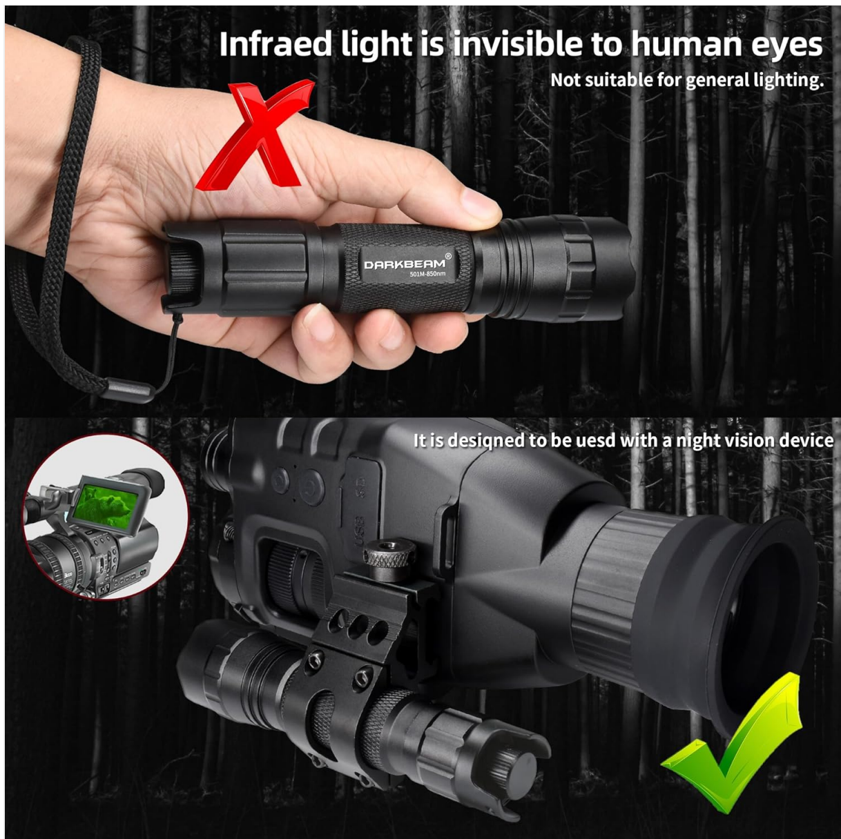
Image 5: Demonstration of the flashlight's long-range illumination capability, showing how it can light up objects at a distance when used with night vision.