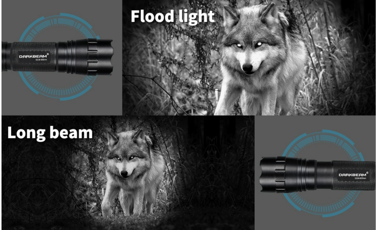
Image 2: Illustration showing that infrared light is not visible to the human eye and requires a night vision device for detection.