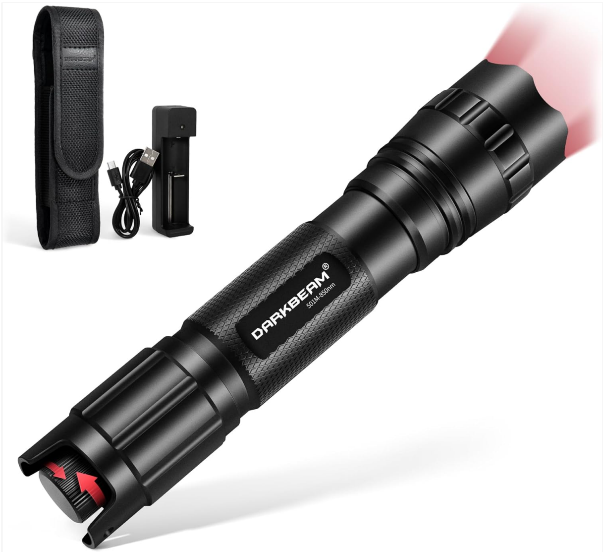
Image 1: The DARKBEAM 501M-850nm IR Flashlight and its included accessories, including the flashlight body, battery, charger, cable, AAA battery holder, lanyard, and holster.