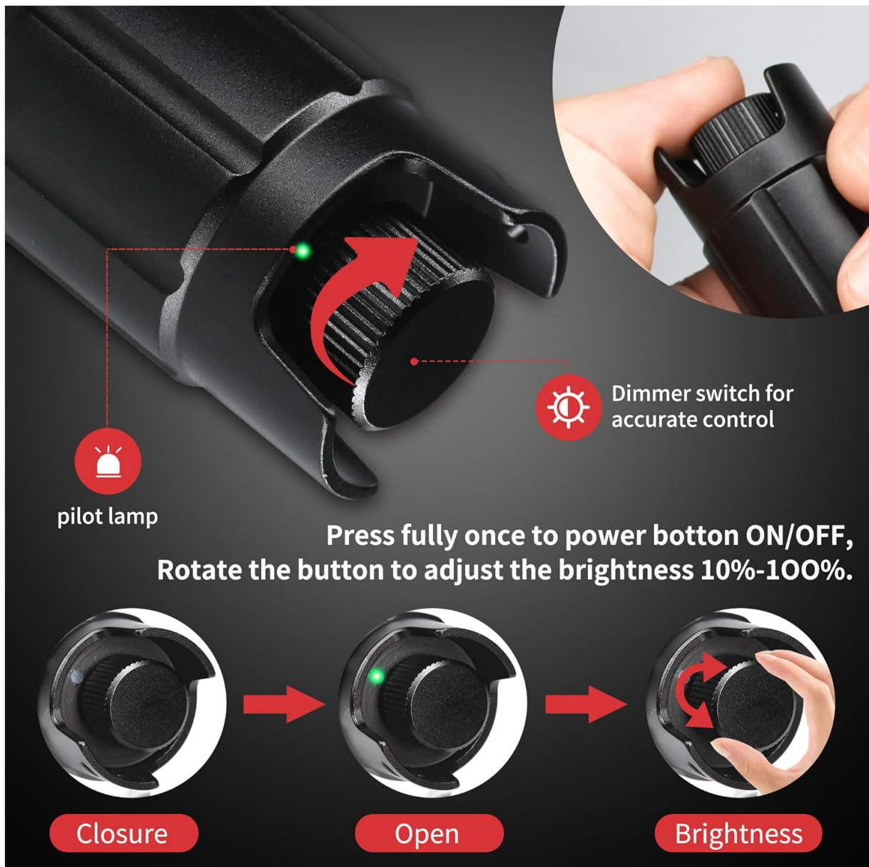
Image 3: Diagram illustrating the rotary dimmer switch for stepless brightness adjustment and the pilot lamp indicating battery status.