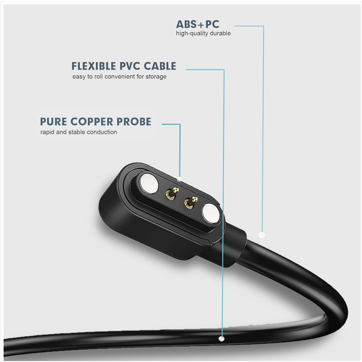
Image 5.4: This diagram specifically points out the flexible PVC cable, designed for easy storage, and the pure copper probe, ensuring rapid and stable charging.