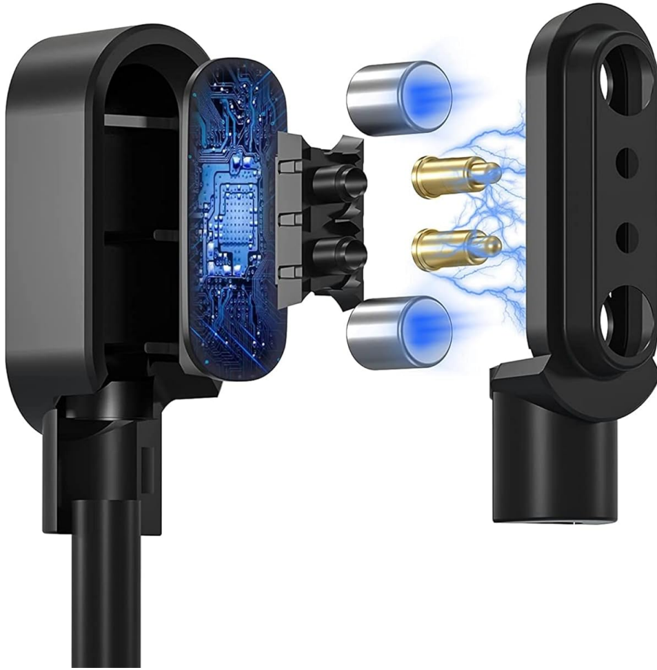
Image 5.1: An illustration demonstrating the strong magnetic connection and internal components that enable efficient charging for smartwatches.