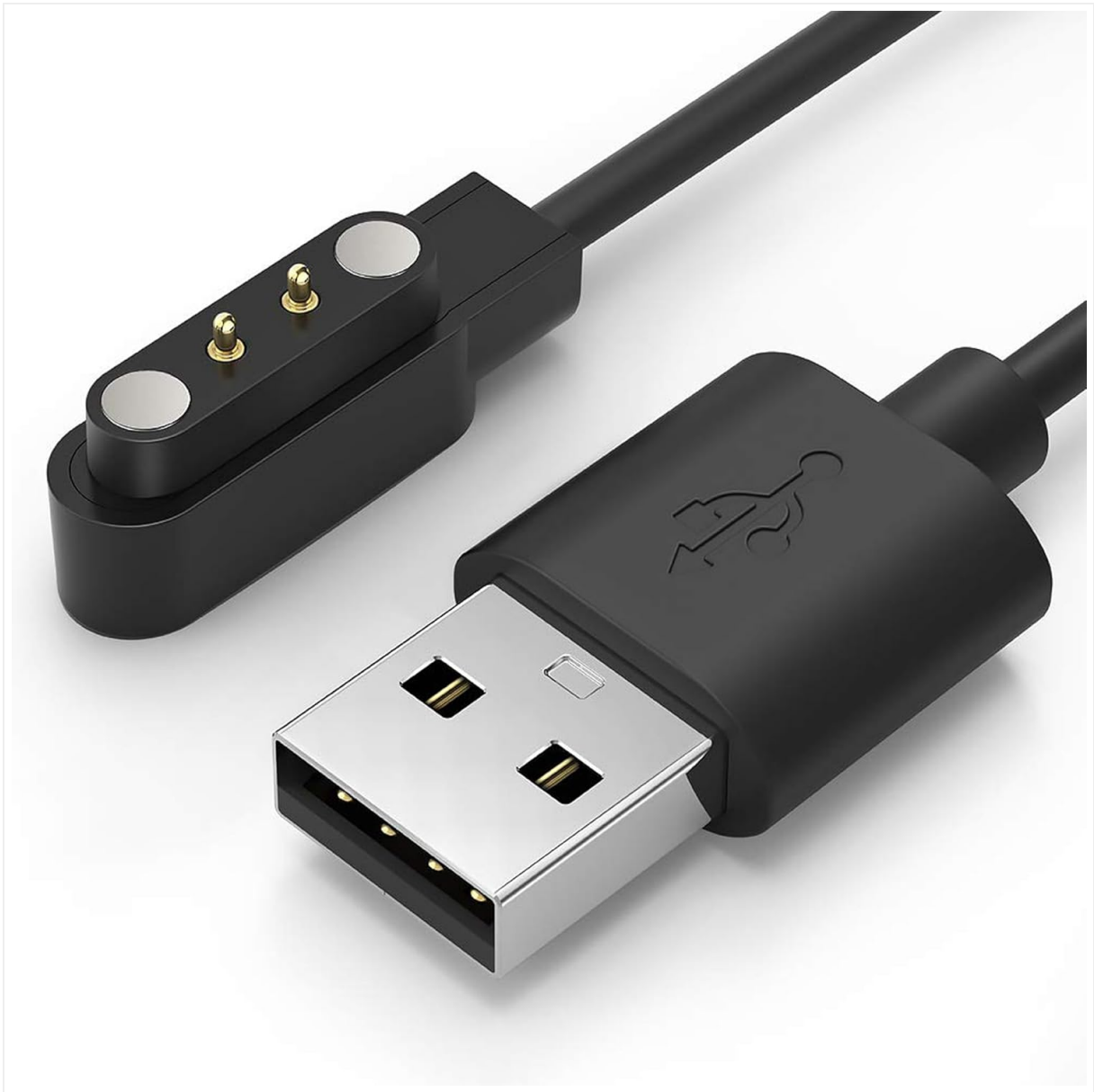
Image 3.1: A close-up view of the magnetic charging pins and the USB-A connector, highlighting the contact points.

Your browser does not support the video tag.