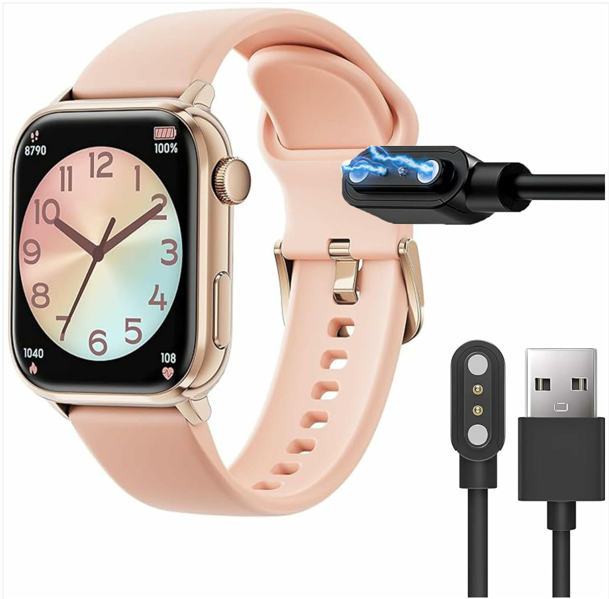
Image 1.1: The Lamshaw Magnetic Charging Cable, featuring a USB-A connector and a magnetic 2-pin charging head.