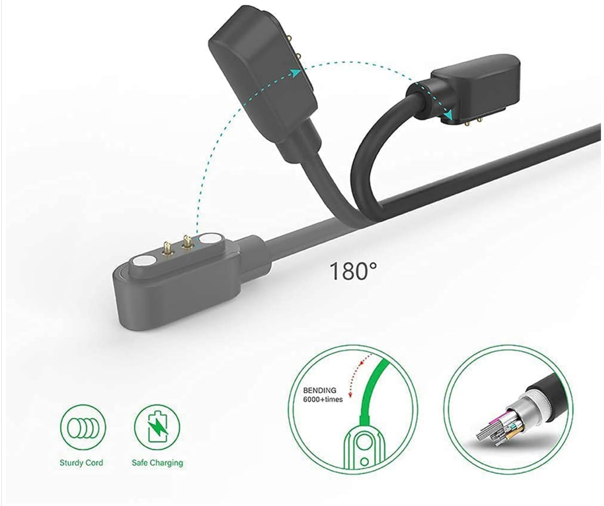
Image 5.2: This diagram illustrates the reinforced design of the cable, highlighting its 180-degree bending capability for increased durability and resistance to wear.