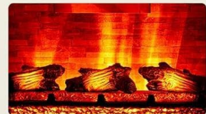
Image: The 33-inch electric fireplace displaying its 3D log embers, temperature range, 7 flame colors, and timer function, along with its remote control.