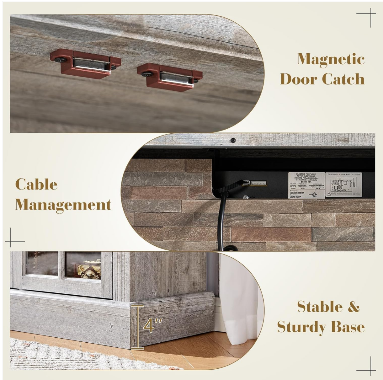
Image: Detailed view of the TV stand's features, including magnetic door catches for secure closure, a cable management opening behind the fireplace, and the sturdy base design.