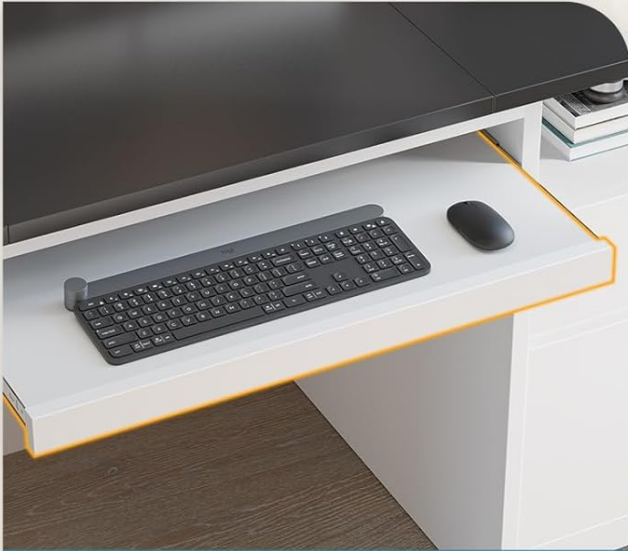
Flexible Keyboard Tray