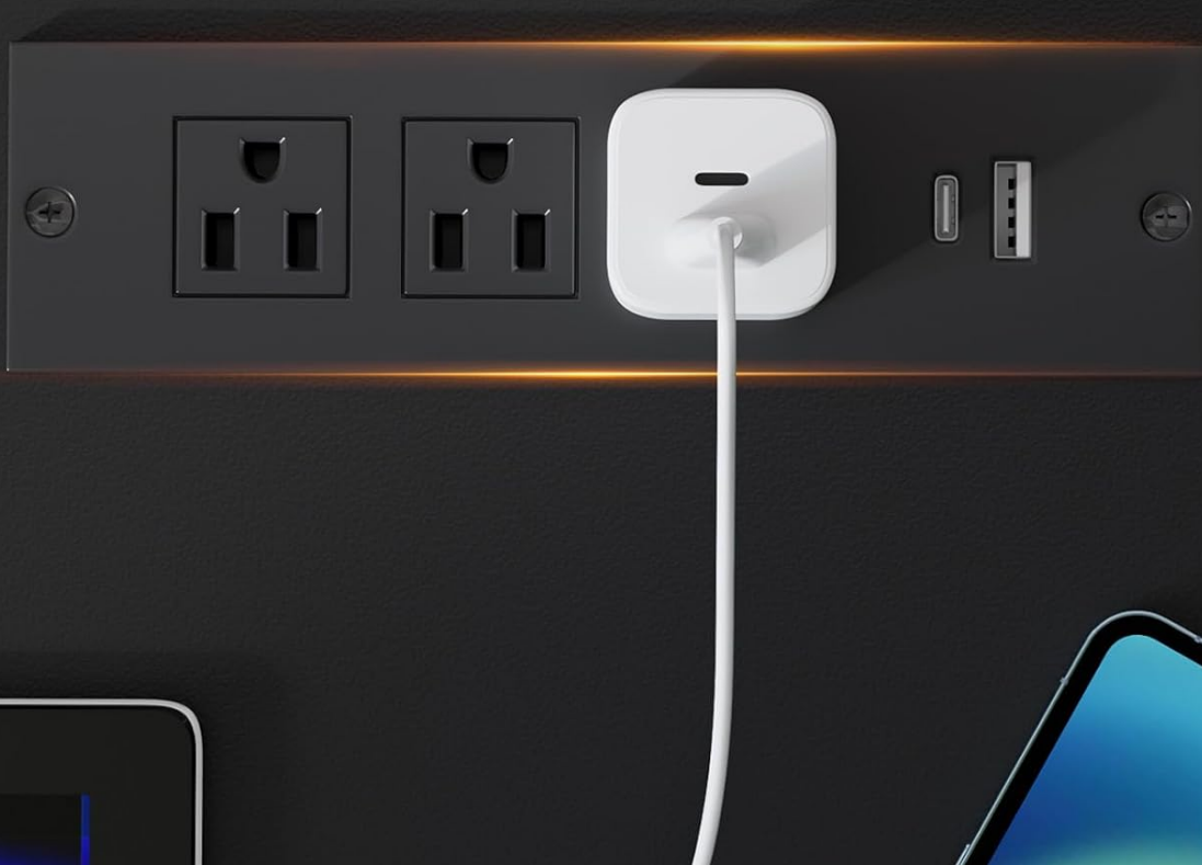
Image: Detail of the integrated charging station for electronic devices.