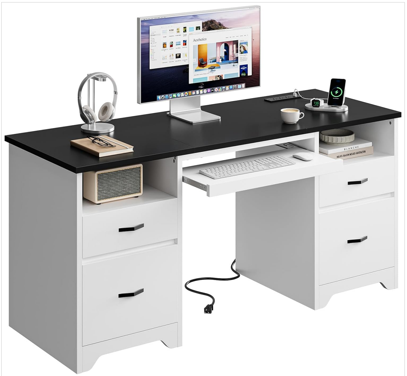
Image: Front view of the assembled Bestier 59-inch Computer Desk in white with a black desktop, featuring a monitor, headphones, and other office accessories.