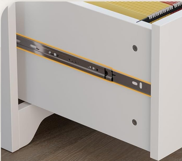
Smooth Drawer Hinges