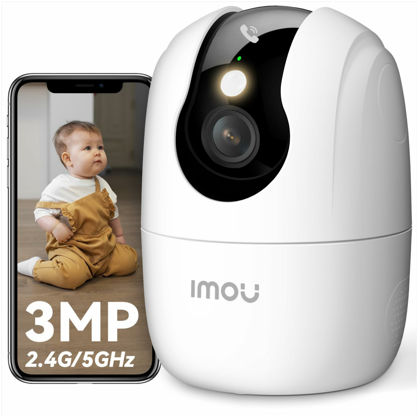
Figure 3.1: Imou Ranger 2C Pro 2K Camera Front View

(3MP) resolution, dual-band Wi-Fi 6 connectivity, and a 360° panoramic view.