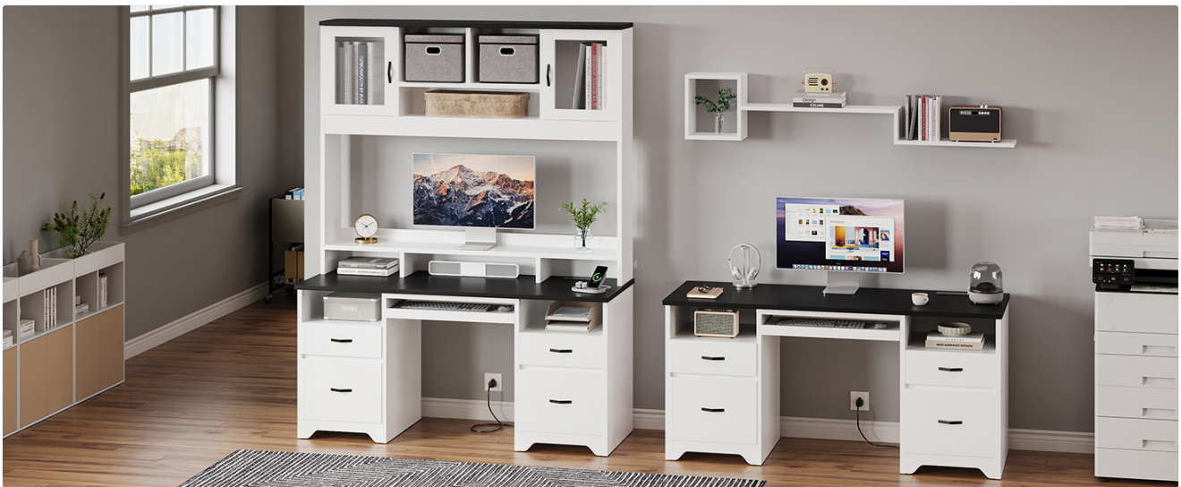
Figure 5.2: Integrated charging station with AC and USB ports.