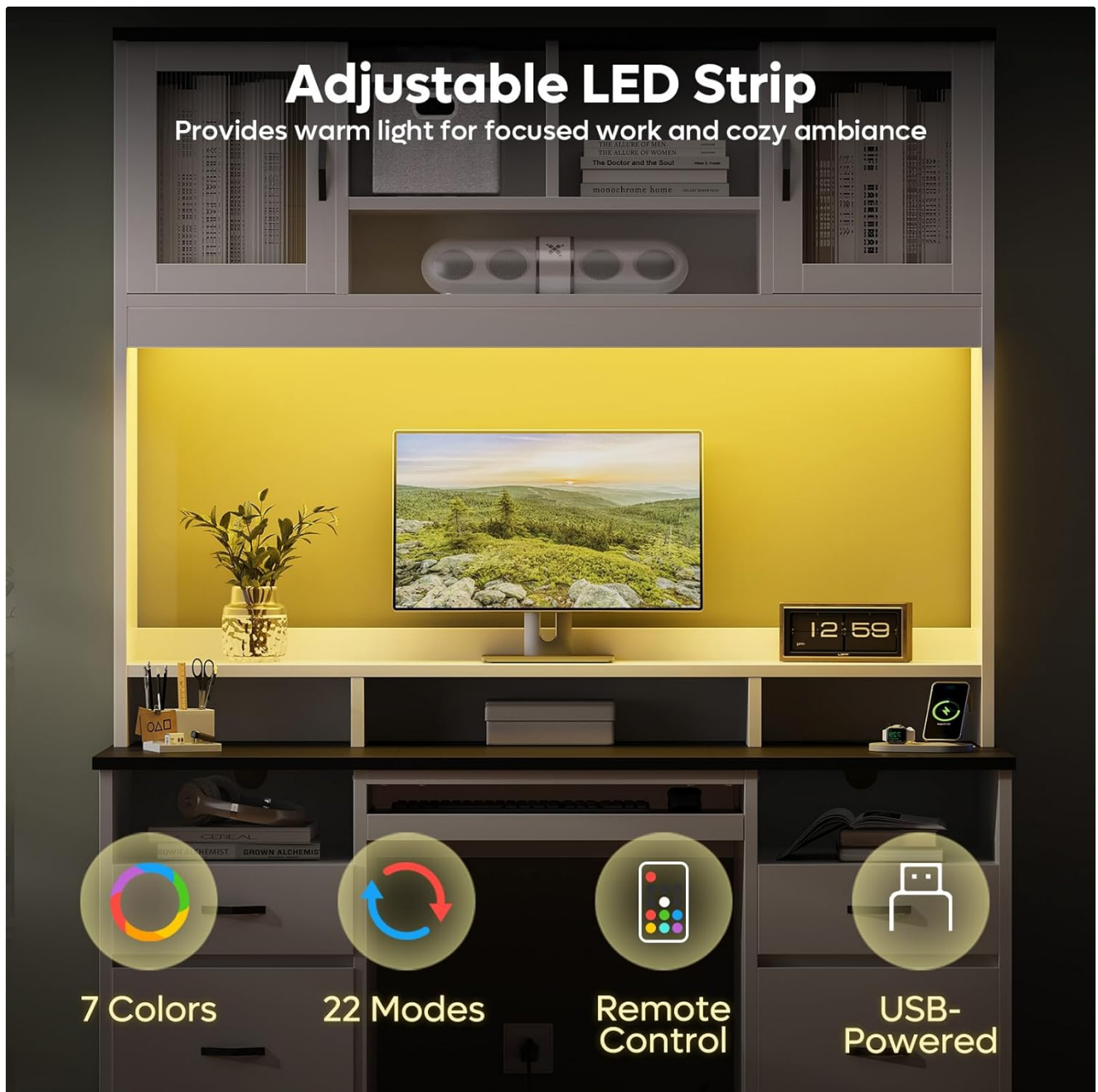
Figure 5.1: Adjustable LED lighting system features.