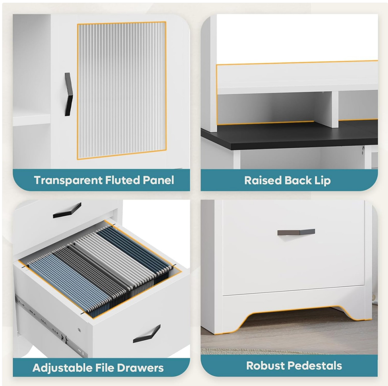
Figure 5.4: Key design features including fluted panels and adjustable file drawers.