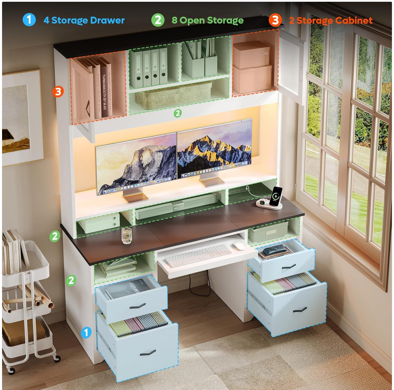
Figure 5.3: Overview of storage compartments and drawers.