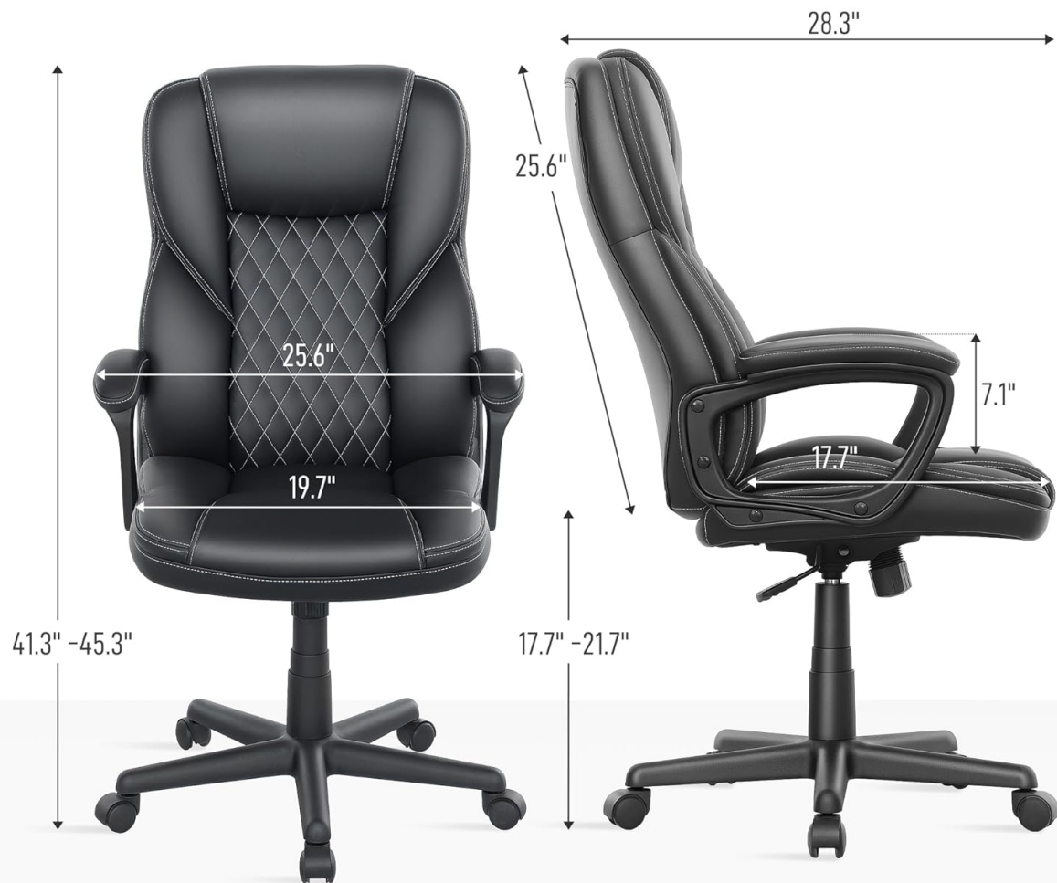
Figure 6: Detailed dimensions of the office chair.