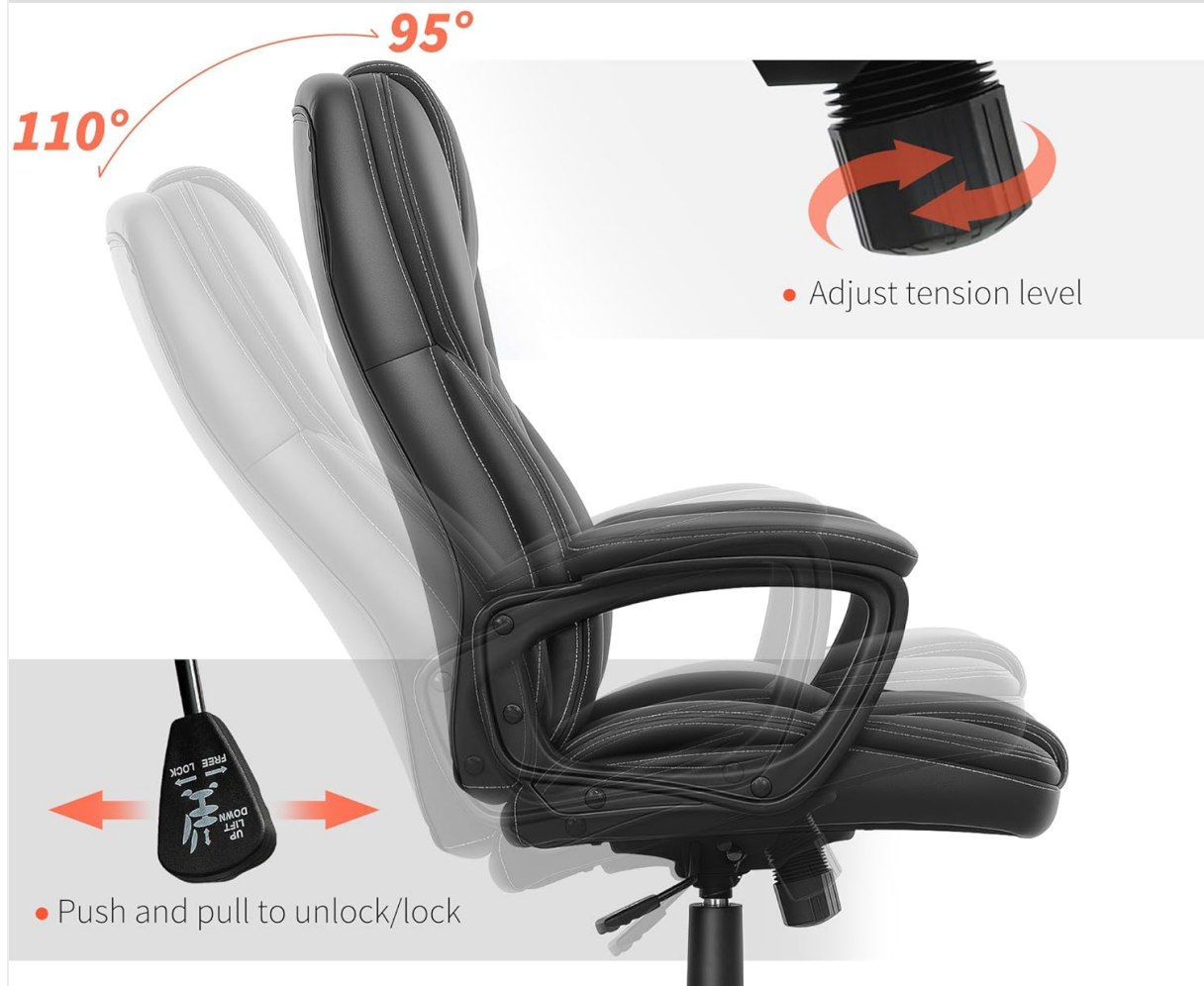
Figure 5: Tilt function lever and tension adjustment knob.

Slightly rocking back and forth for complete relaxing