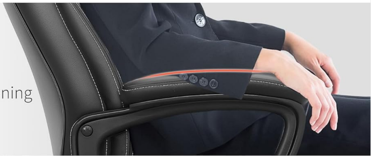
Figure 2: Cushioned seat and padded armrests for comfort.