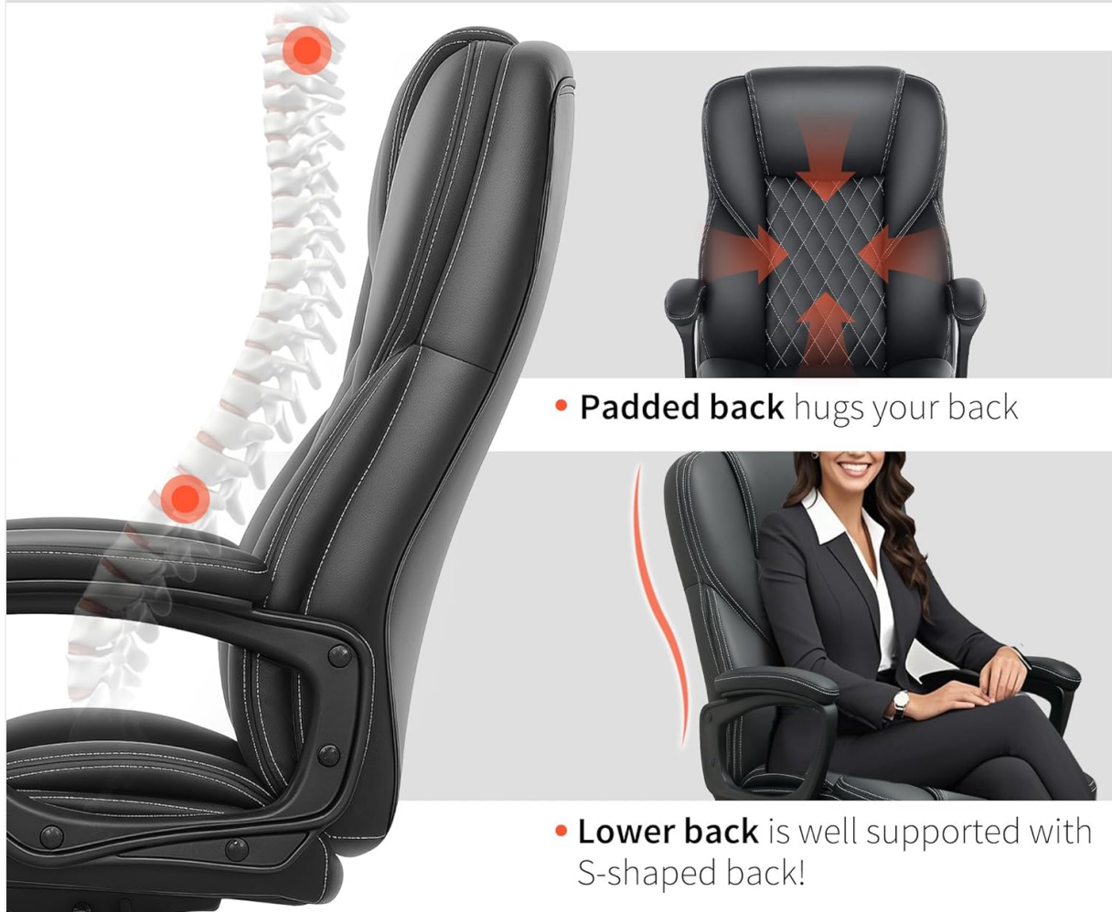
Figure 1: Ergonomic lumbar and upper back support for improved posture.

Padded highback provides great lumbar support