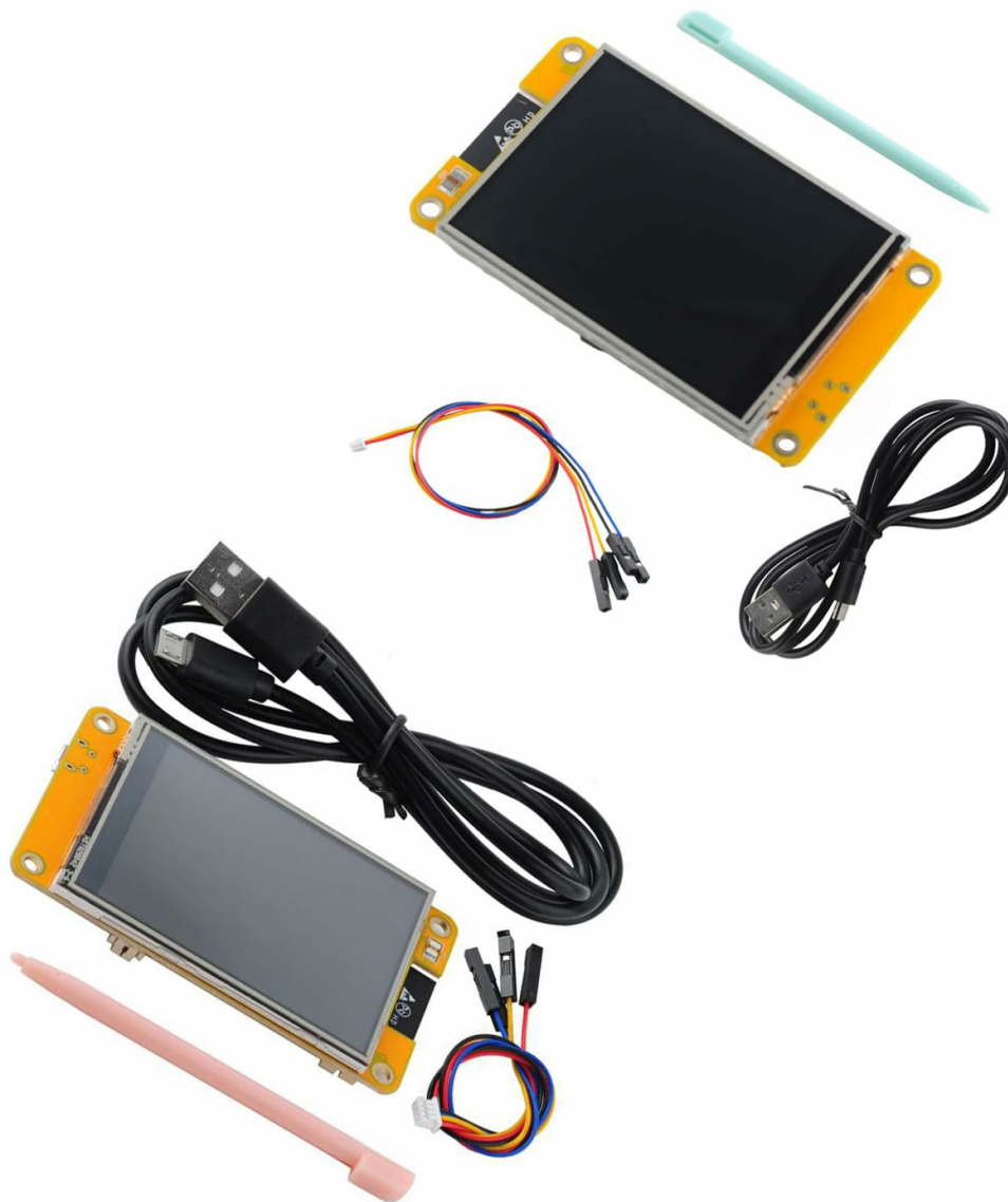
Image 4.1: Component layout and pin identification for the ESP32-2432S028R module.