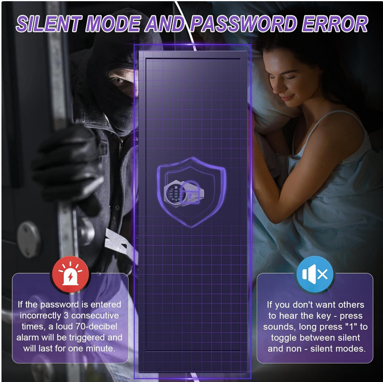
Image: Illustrates the silent mode feature and the password error alarm system.

Your browser does not support the video tag.