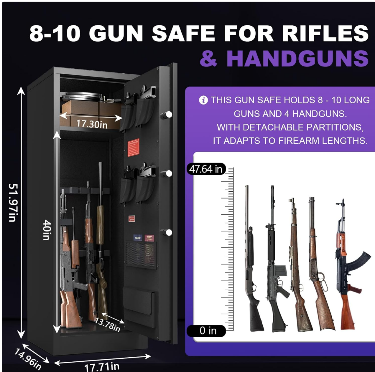
Image: Shows the interior of the safe with rifles and handguns, highlighting dimensions and capacity.