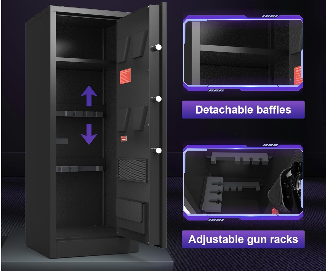
Image: Details the removable shelf and adjustable gun racks for customizable storage.