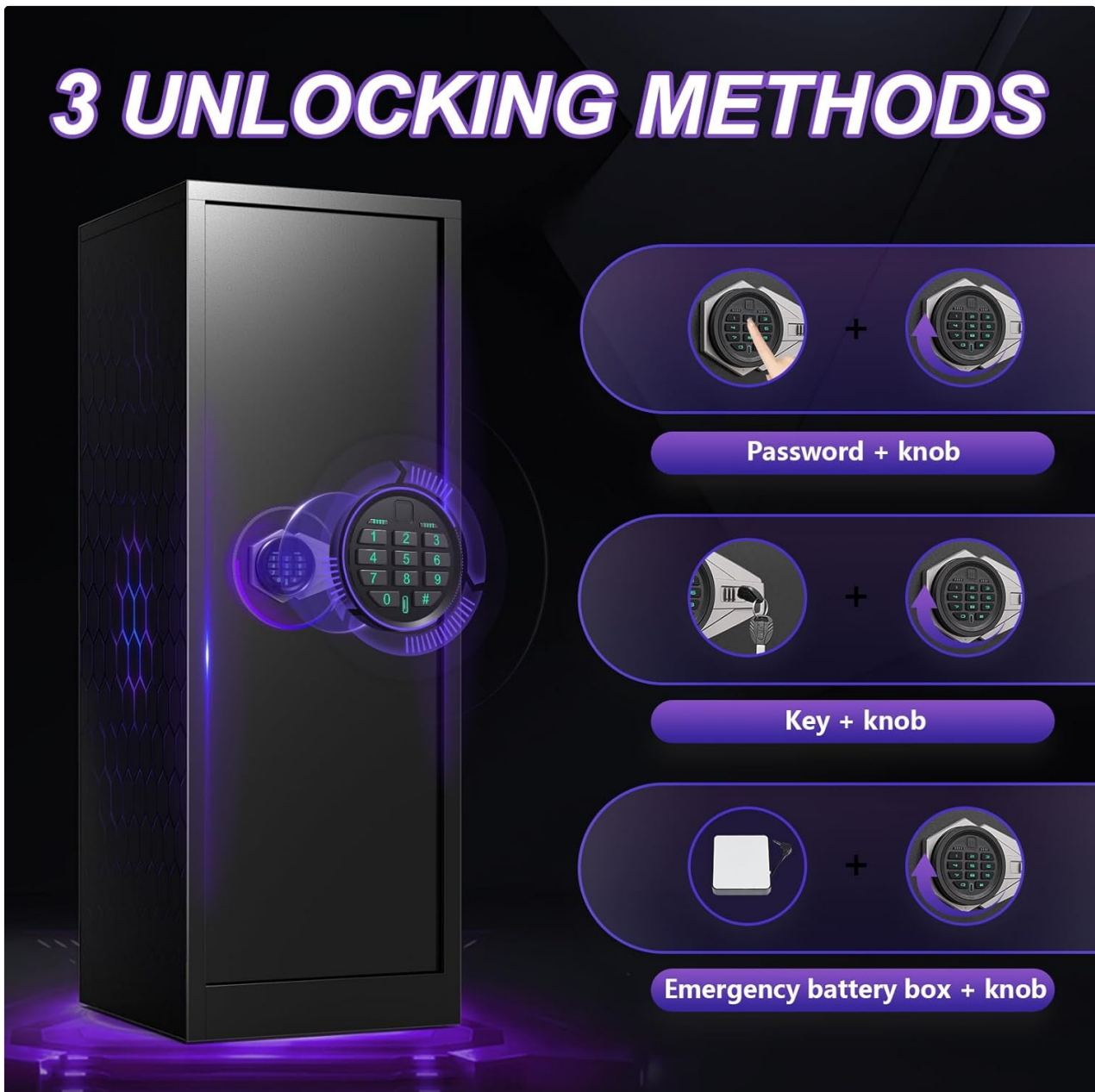
Image: Visual representation of the three unlocking methods: passcode, key, and emergency battery box with knob.