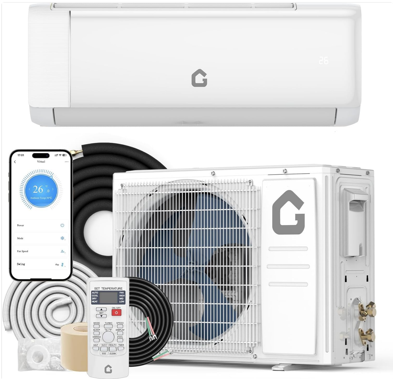
Image: The MilleLoom indoor unit and outdoor condenser unit, along with the remote control and WiFi app interface.