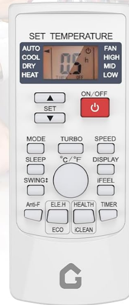
Image: Illustration of the remote control for the MilleLoom Mini Split AC, highlighting various functions like Cooling, Heating, Dry, Fan Only, Sleep, ECO, Self-Cleaning, and Timer.