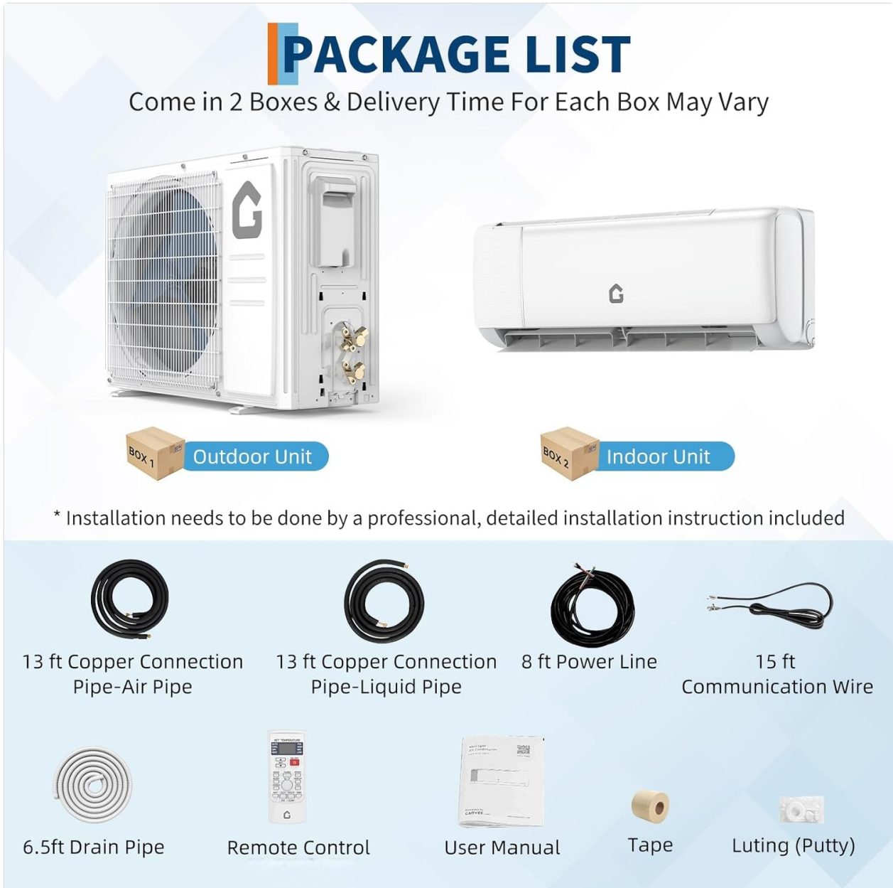
Image: Components included in the MilleLoom Mini Split Air Conditioner package. Shows the indoor unit, outdoor unit, copper pipes, drain hose, communication wires, remote control, and user manual.

Note: Shut-off valve housing and side protection grille are not included. The system ships in two separate packages, which may arrive at different times.