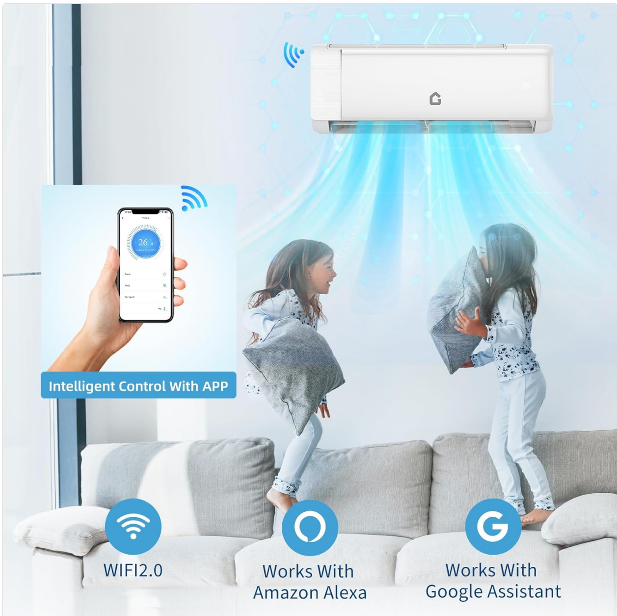
Image: A smartphone displaying the MilleLoom Mini Split AC control app, with icons indicating WiFi 2.0, Amazon Alexa compatibility, and Google Assistant compatibility.