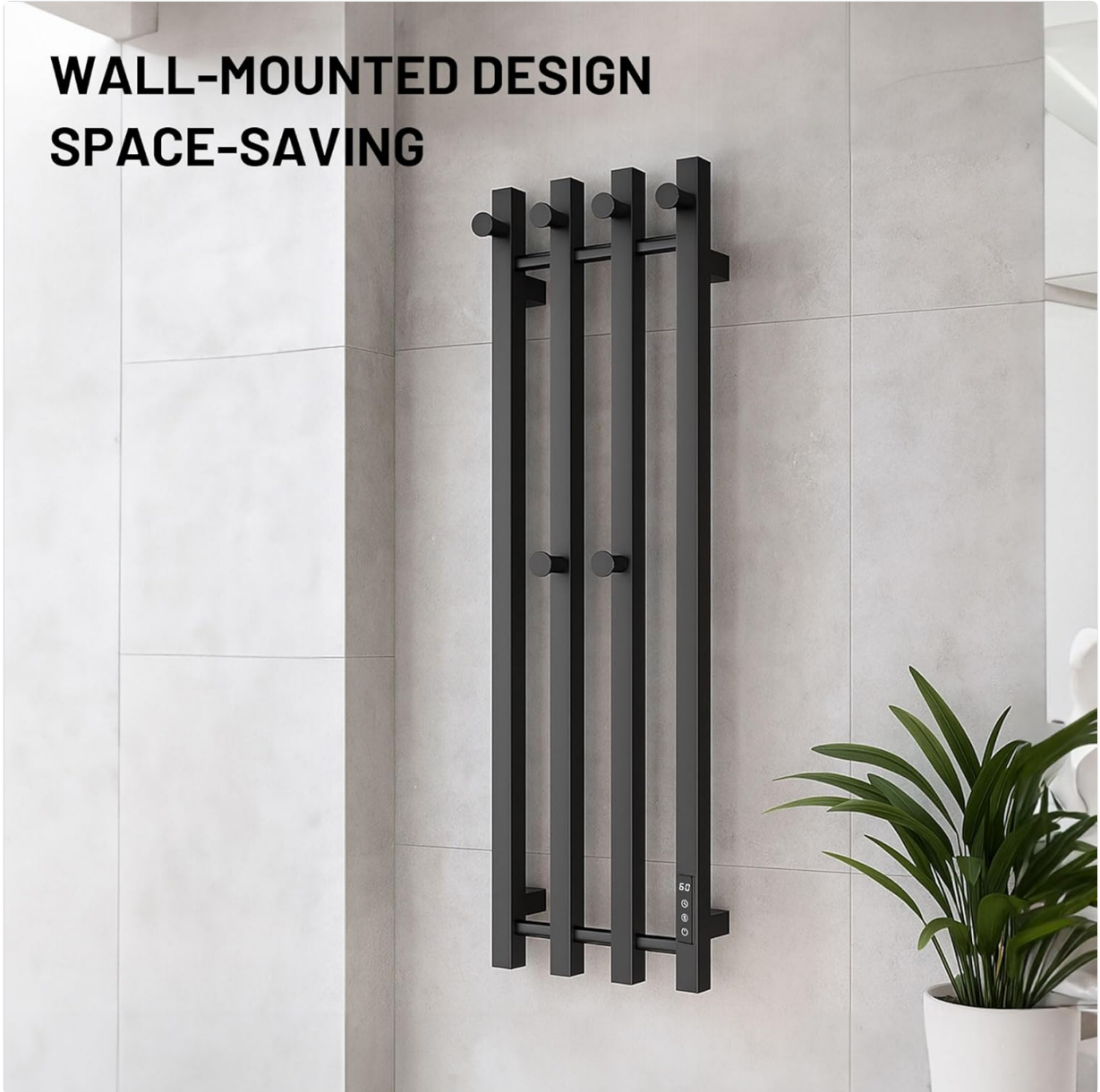
Image: The Poloma Paraheater towel warmer installed on a bathroom wall, showcasing its vertical, space-saving design. A towel is draped over the top bars.