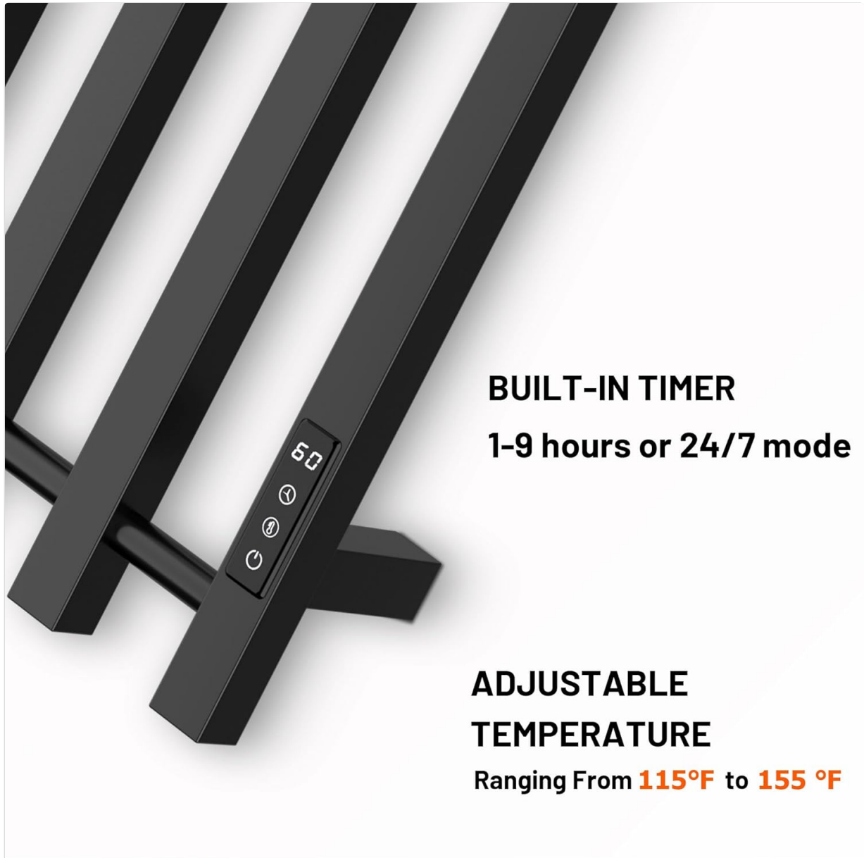
Image: Detail of the control panel on the towel warmer, displaying "60" on the LED screen and icons for timer, temperature adjustment, and power. The image also highlights the adjustable temperature range of 115°F to 155°F and timer options from 1-9 hours or 24/7 mode.