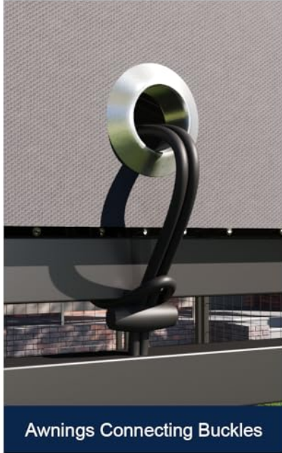
Awnings Connecting Buckles