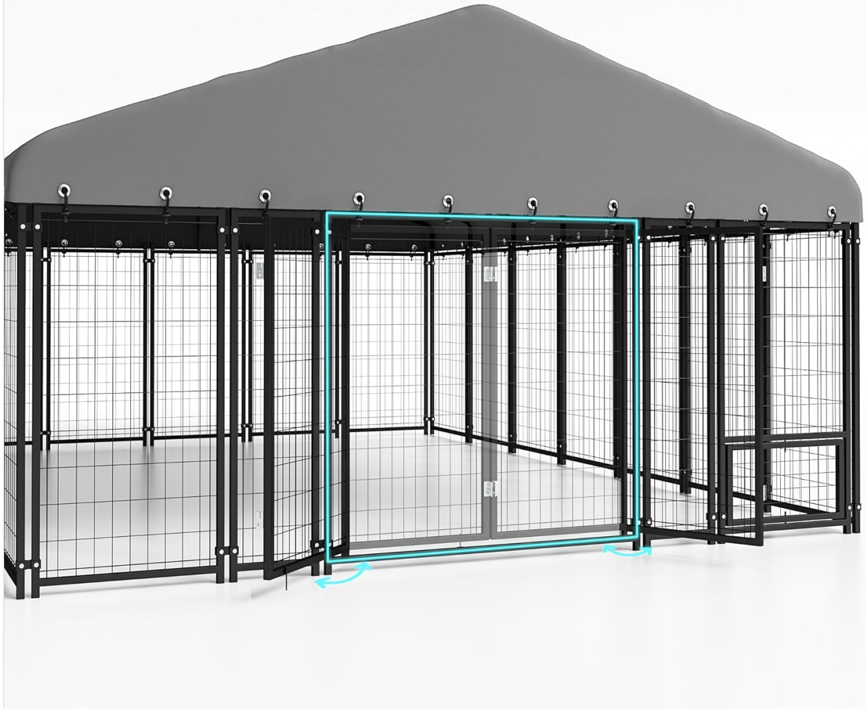
Image: Illustration highlighting the wider double doors for easy access.