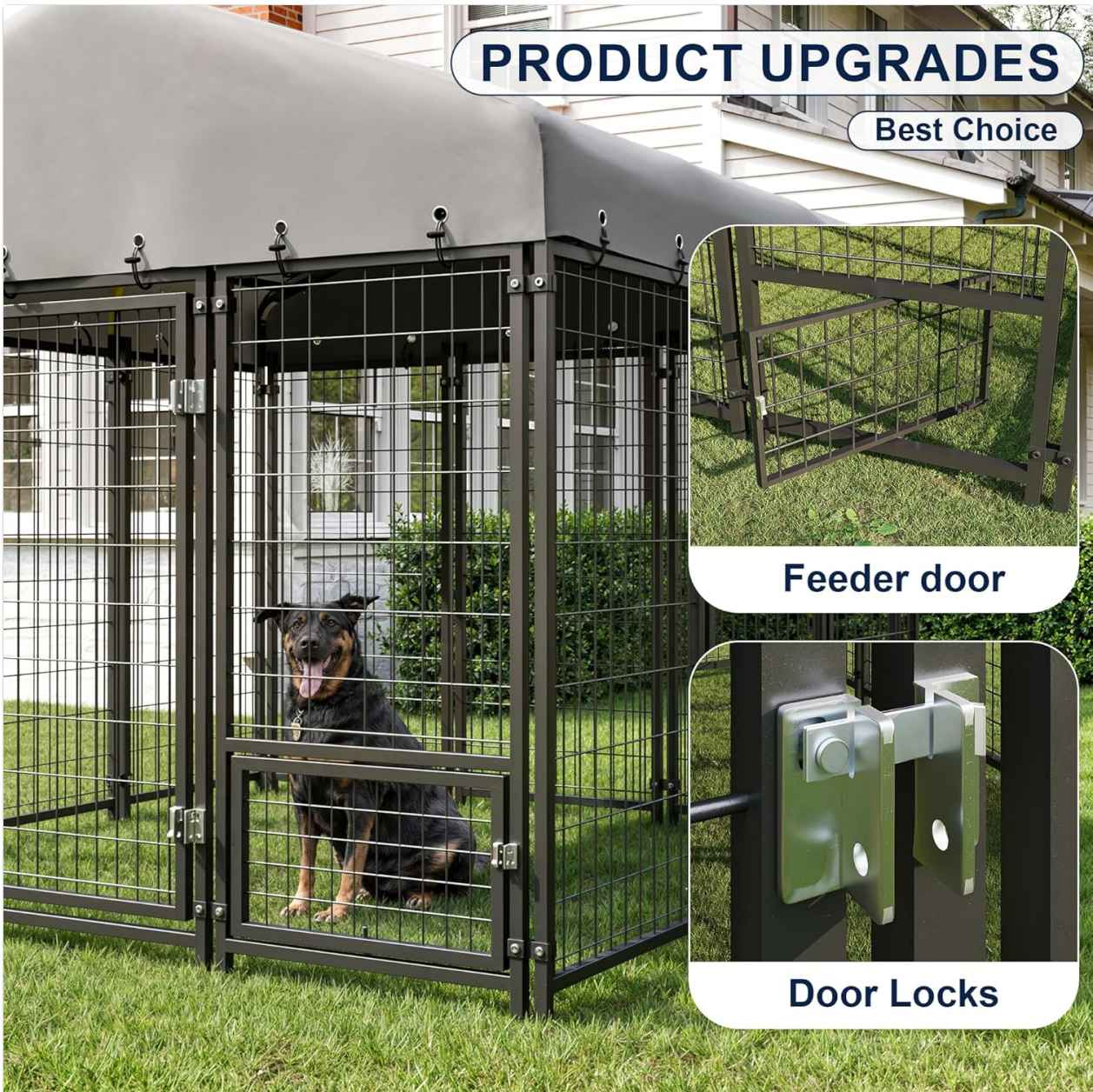
Image: Detailed view of the feeder door for convenient feeding and the robust double lock system.