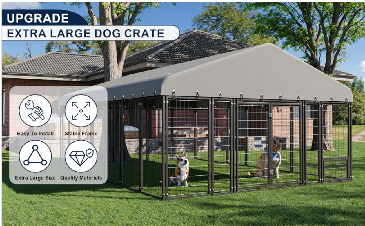
Image: The fully assembled kennel structure, demonstrating its size and layout in an outdoor setting.