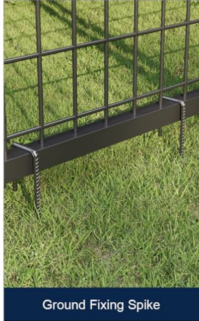
Ground Fixing Spike