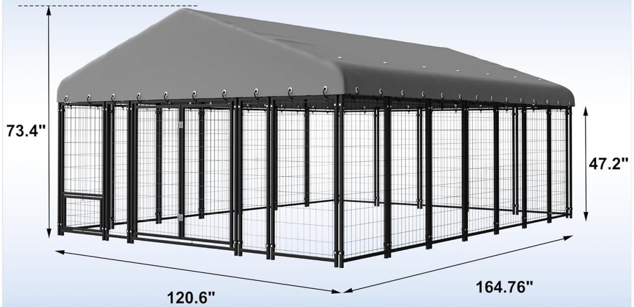
Image: Visual representation of the kennel's overall dimensions, including height, length, and width.