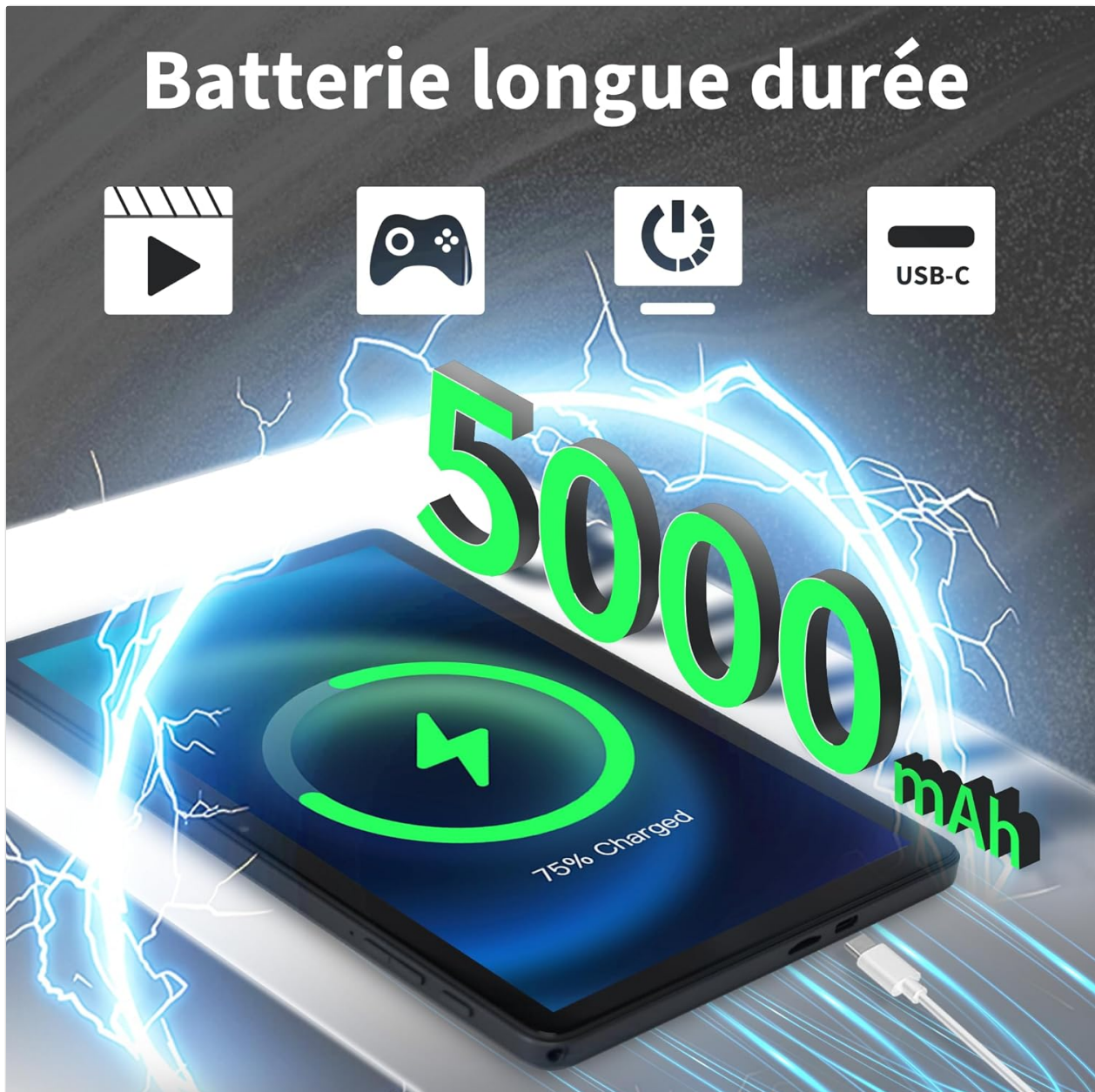
Image: Veidoo W40 Tablet connected to a USB-C charger, showing the battery icon and 5000mAh capacity.