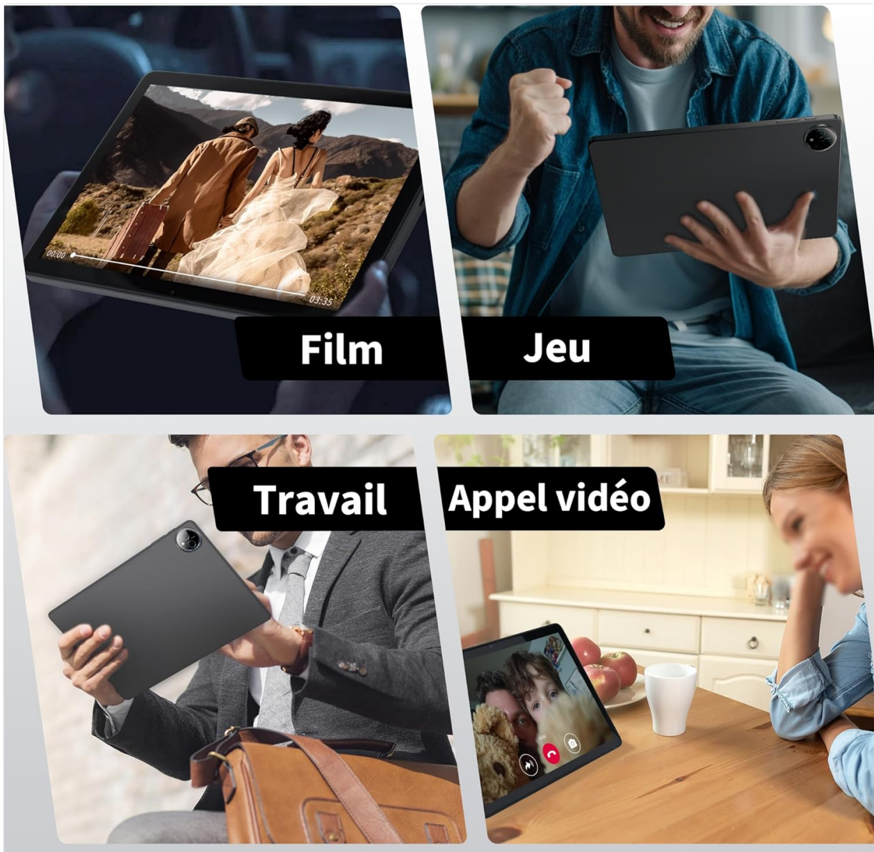
Image: Tablet in use for various activities such as watching movies, playing games, working, and video calls, demonstrating its versatility.