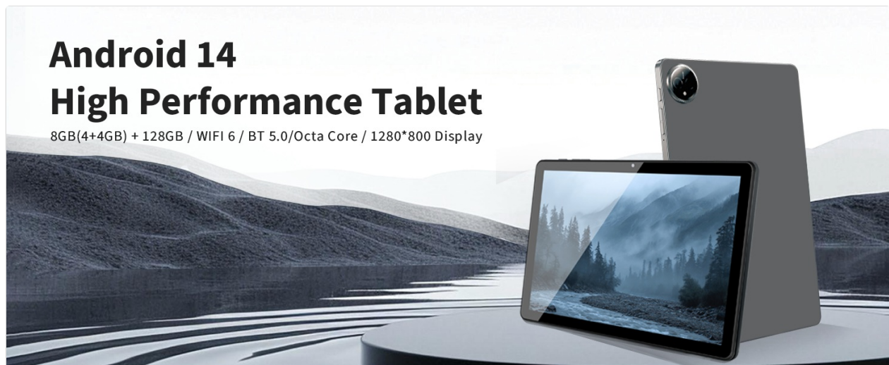
Image: Veidoo W40 Tablet configuration summary, highlighting key features like Android 14, 11-inch In-Cell display, 1280x800 resolution, Octa-Core processor, 8GB RAM, 128GB ROM, 5000mAh battery, WiFi 6, Bluetooth 5.0, and dual cameras.