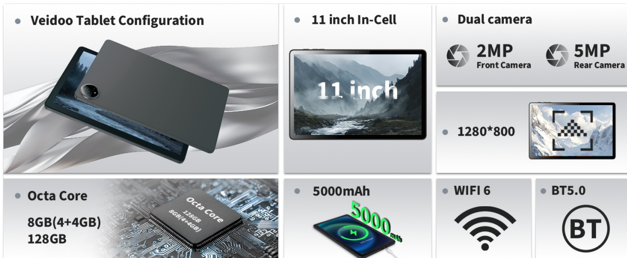
Image: Tablet storage illustration, showing how photos, videos, and music can be stored on the 128GB ROM and expanded with 8GB RAM.