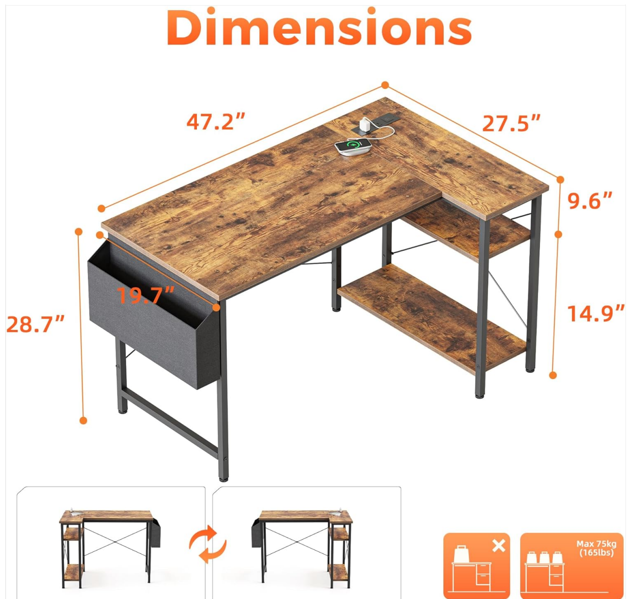
Image 4.1: Desk Dimensions. Main desktop length is 47.2 inches, depth is 27.5 inches, and overall height is 28.7 inches. The side shelves are 9.6 inches and 14.9 inches high.