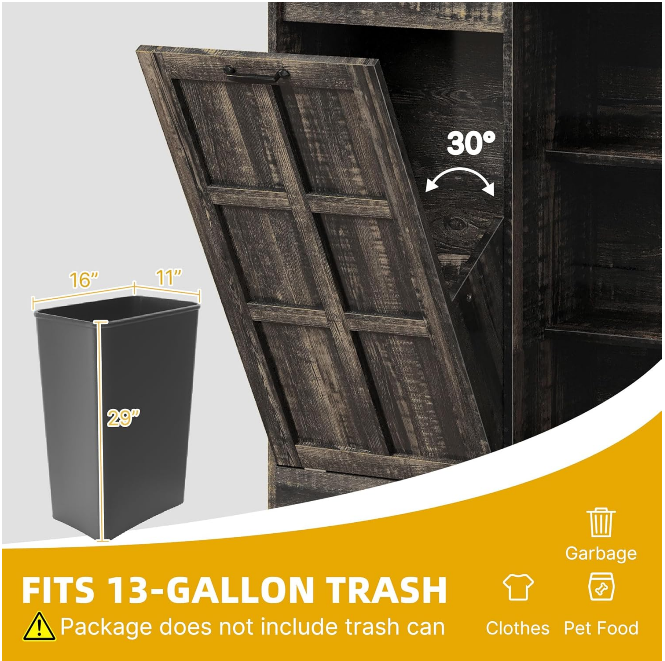
Figure 5: Visual representation of the tilt-out trash bin feature and its compatibility with a 13-gallon trash can.