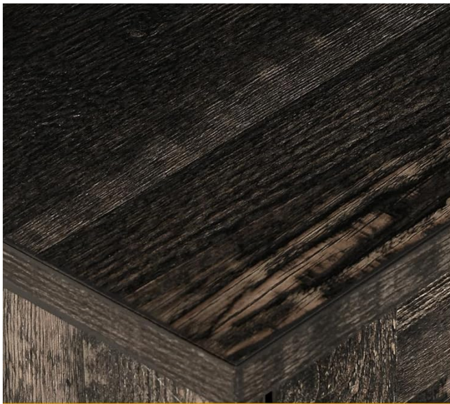
P2 Particle Board