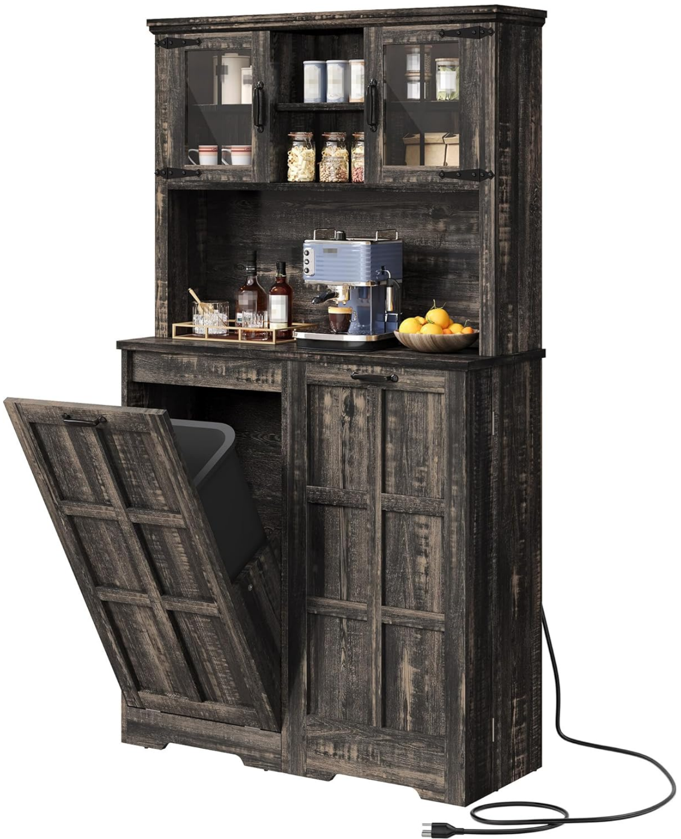
Figure 7: The cabinet with its power cord, emphasizing the convenience of the built-in charging station for kitchen appliances or devices.