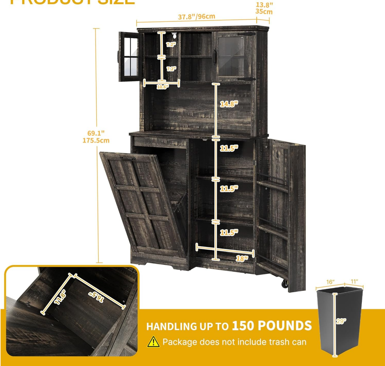
Figure 2: Detailed product dimensions for planning placement and understanding internal capacities.