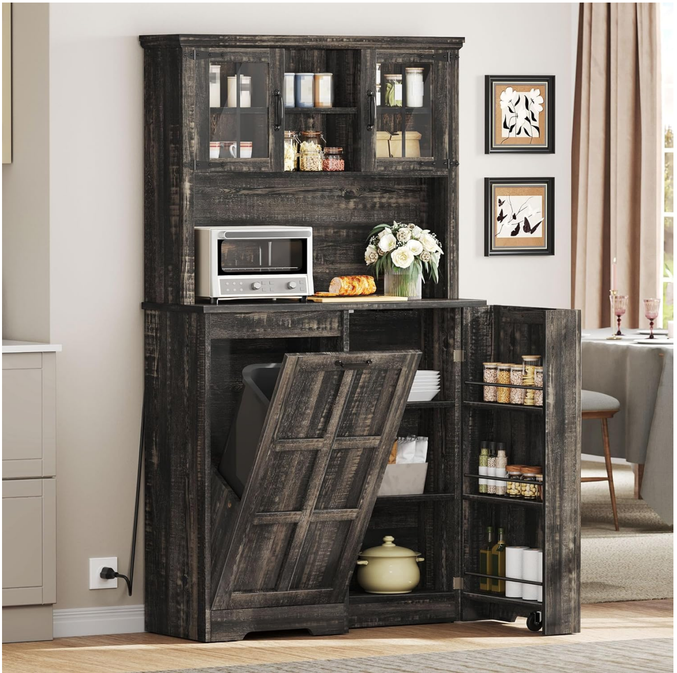
Figure 3: The cabinet's versatility, shown with a microwave on the counter and various kitchen items stored within.