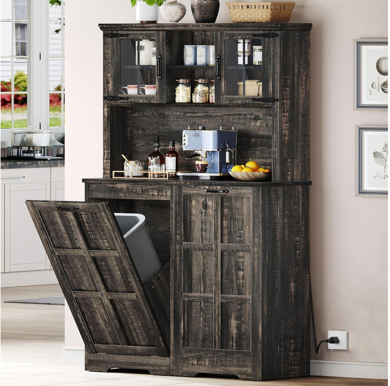
Figure 1: Front view of the DWVO Kitchen Pantry Cabinet, showcasing its multi-functional design with a coffee station and hidden trash bin.