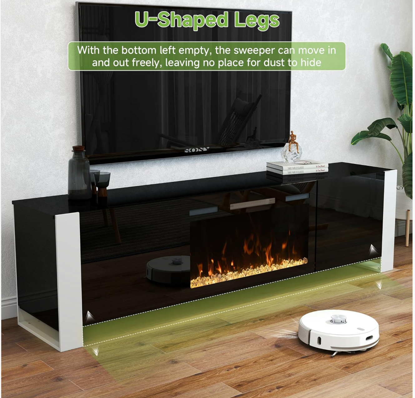
Image 3.3: The U-shaped legs design allows for easy cleaning underneath the unit.

With the bottom left empty, the sweeper can move in and out freely, leaving no place for dust to hide