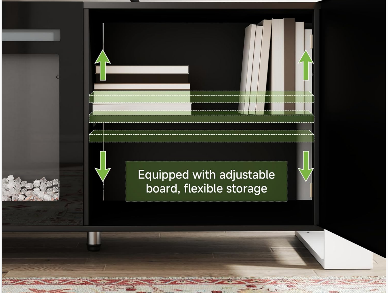
Image 3.2: Adjustable shelves provide flexible storage options within the cabinets.