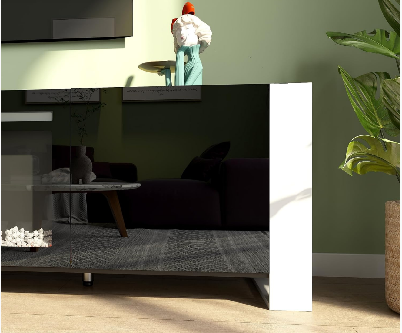
Image 5.1: The high-gloss surface is designed for easy cleaning and maintenance.