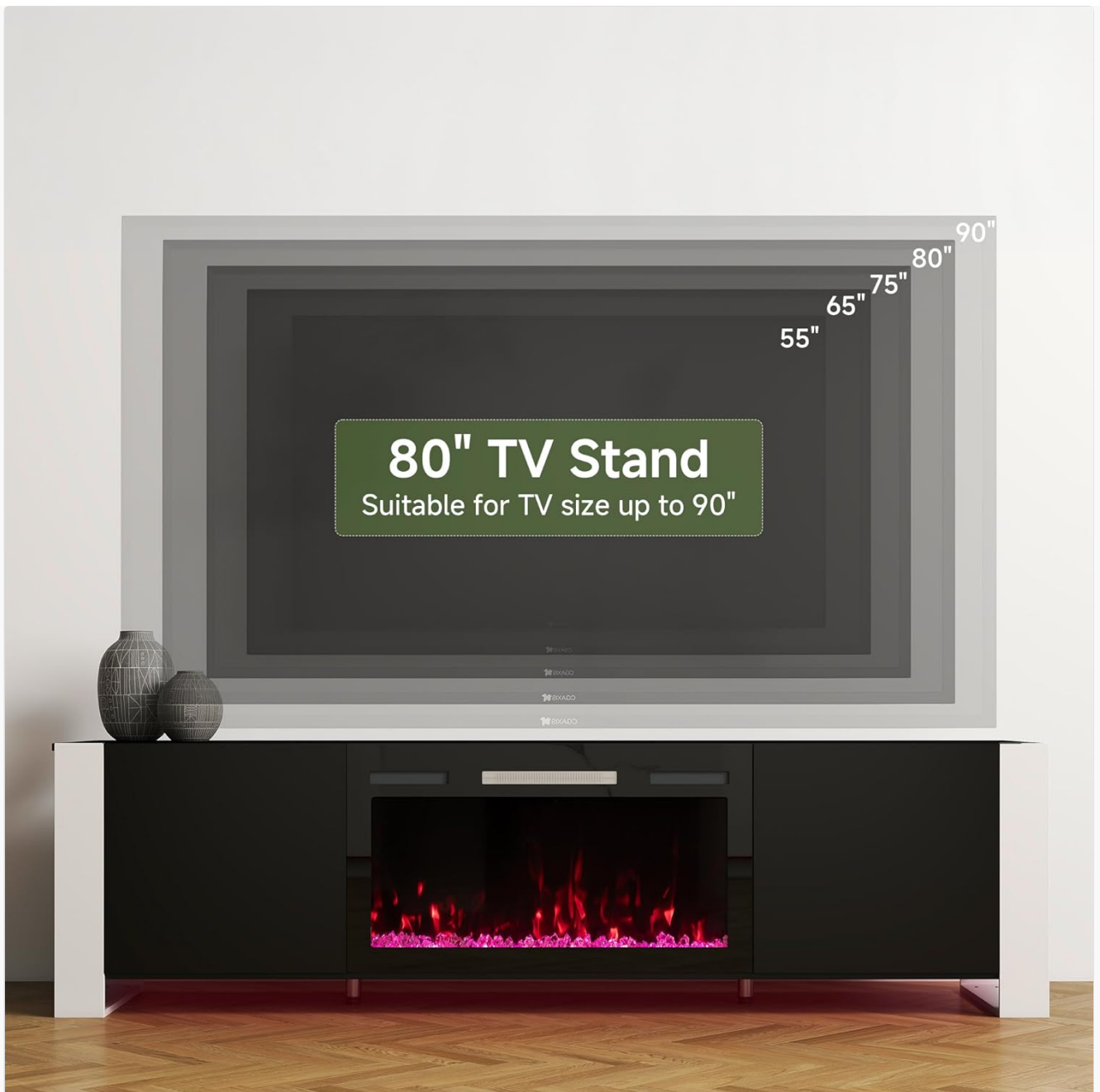
Image 3.4: The 80-inch TV stand is suitable for TVs up to 90 inches.