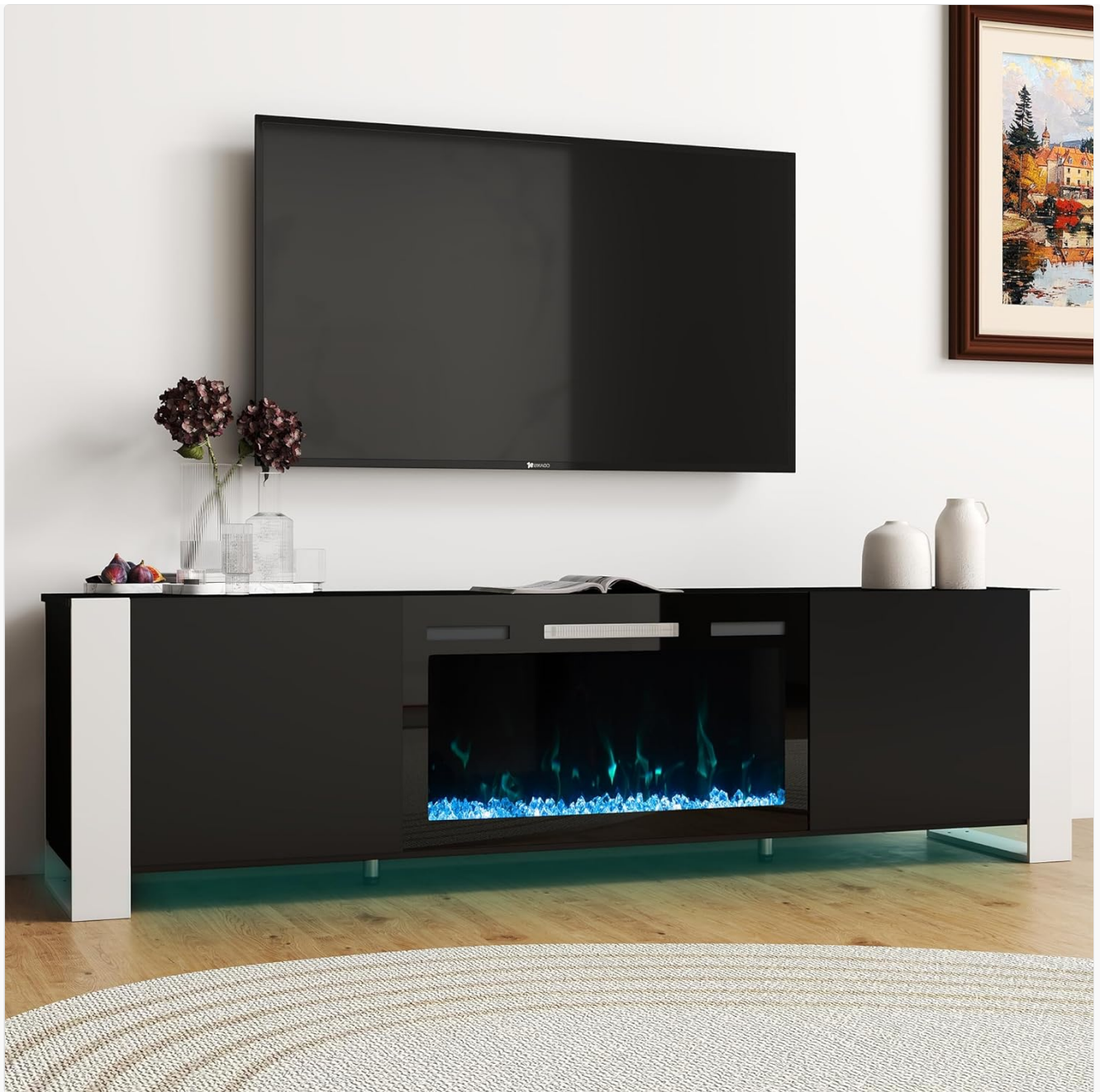
Image 2.1: The Real Relax 80-inch TV Stand with integrated electric fireplace.